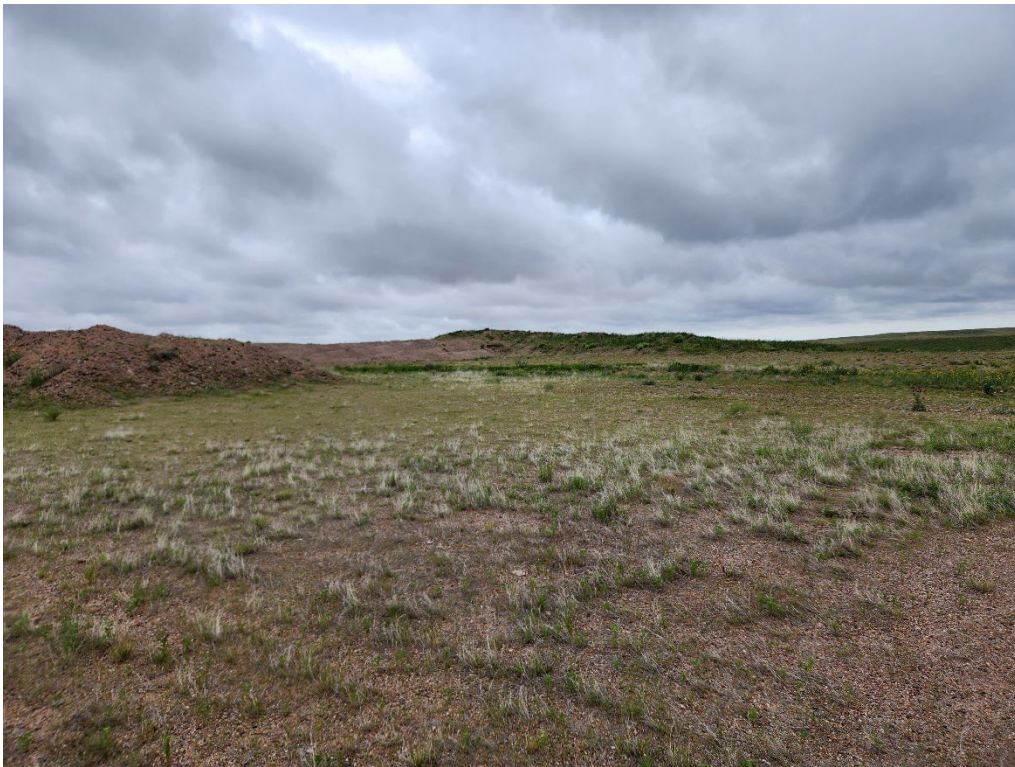
Photo 6. The pit floor, looking south.