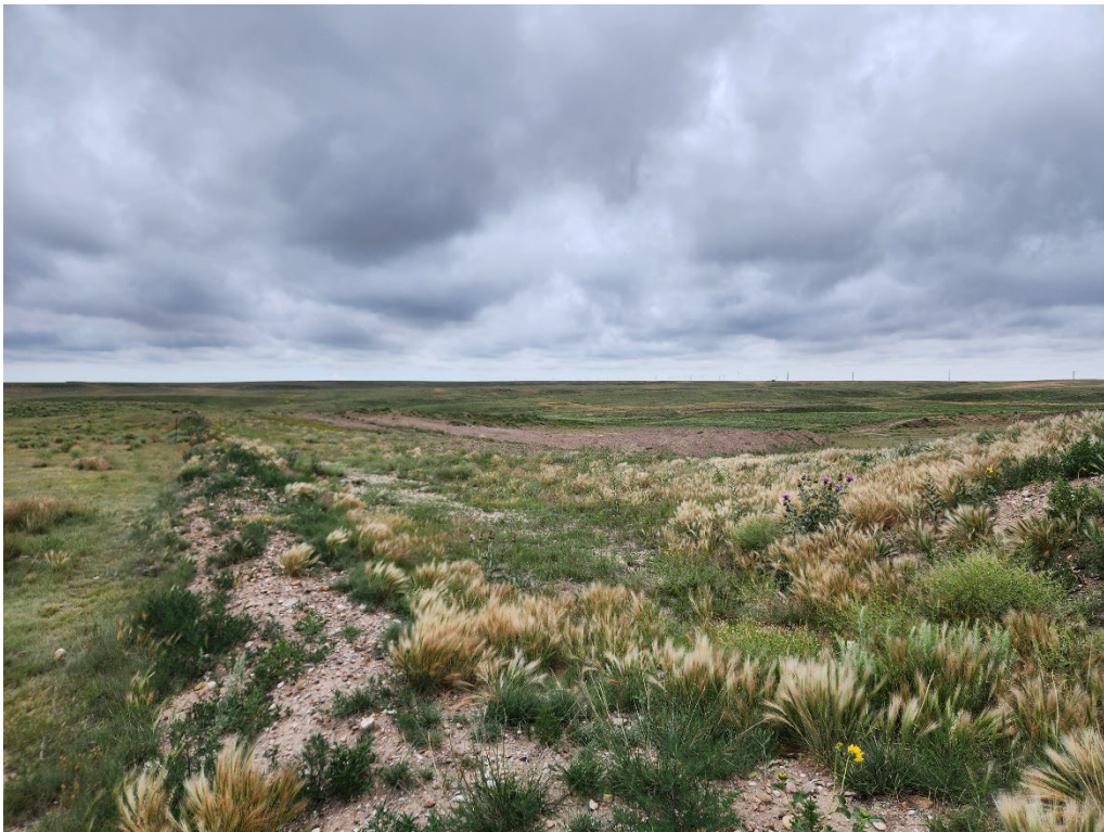
Photo 4. The southwest corner of the permit area, looking northeast.