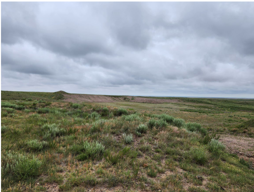
Photo 2. The northeast corner of the permit area looking in, looking southwest.