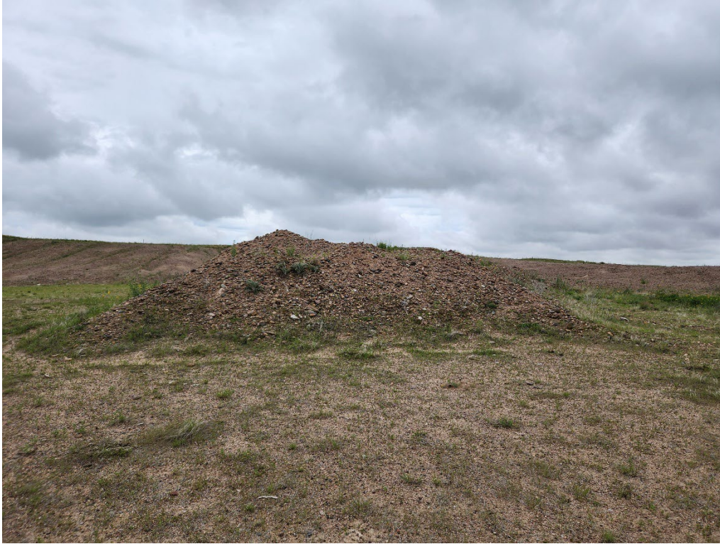
Photo 7. A material stockpile remaining on the pit floor.