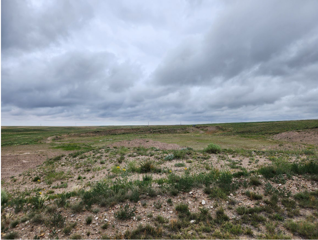
Photo 5. The northwest corner of the permit area, looking east.