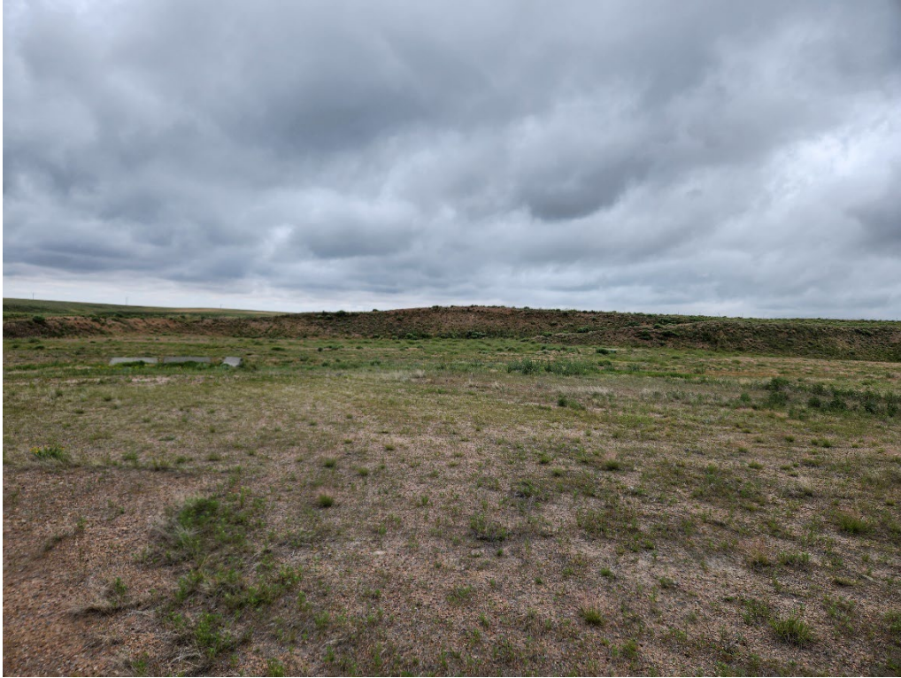
Photo 3. The pit floor, looking northeast.