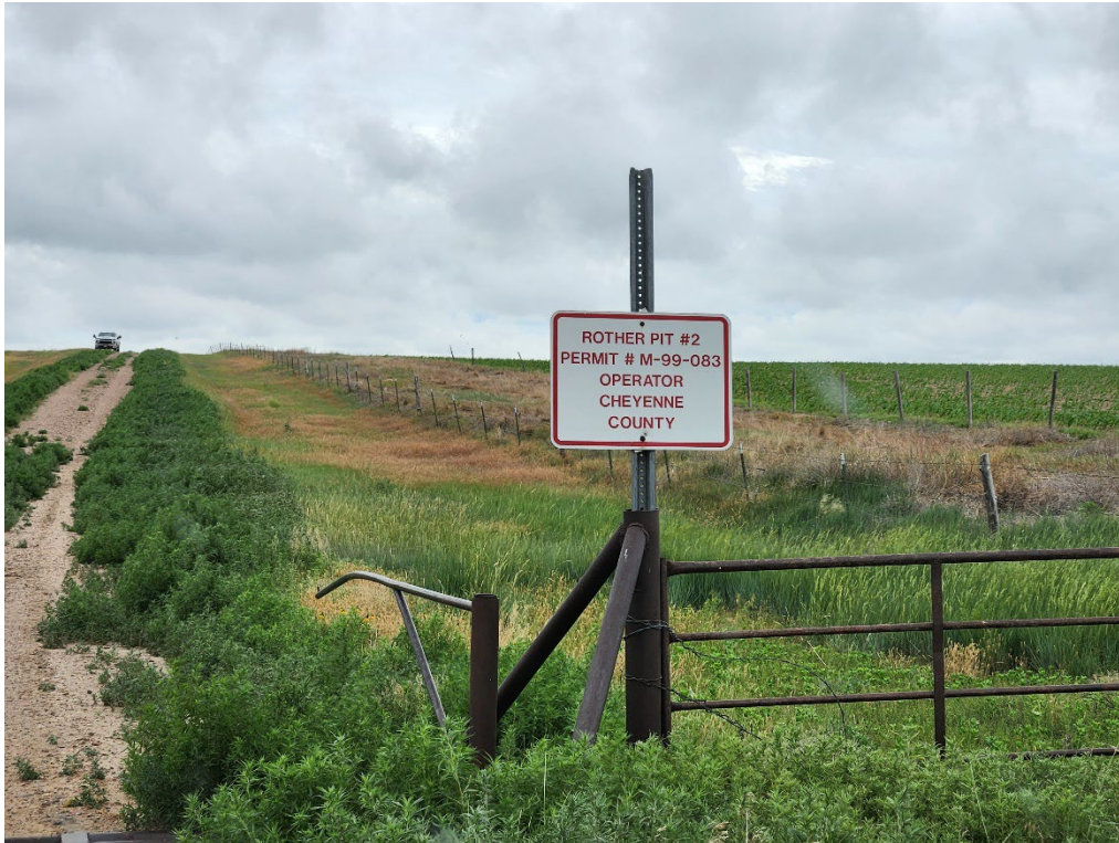
Photo 1. Mine Entrance sign, looking west.