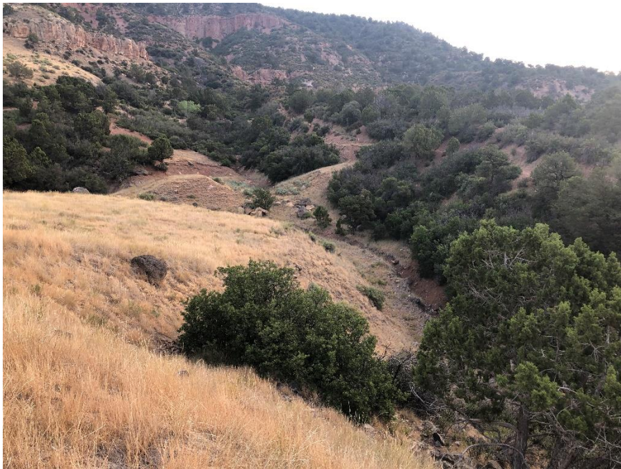
Reclaimed Pond 1 at the East Mine, looking up the drainage

Number of Partial Inspection this Fiscal Year: 1