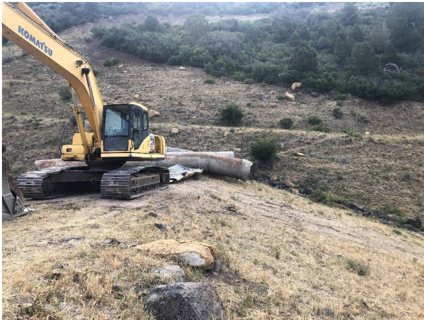
Pipes removed from under the lower pond

Number of Partial Inspection this Fiscal Year: 1