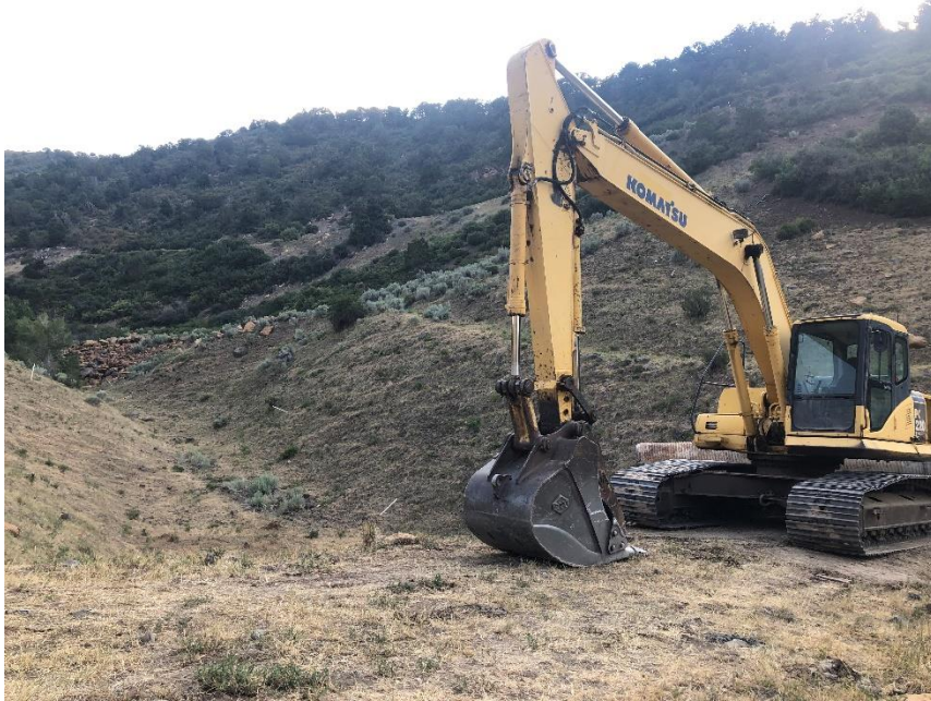
Excavator at West Mine, looking upstream at the remaining pond