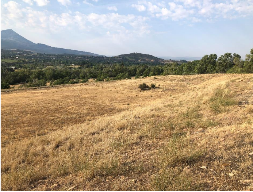
Coal storage by Highway 133, west side