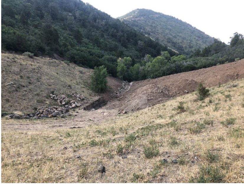
West Mine reclamation, looking downstream