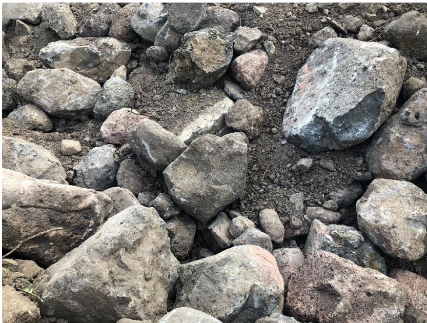
Riprap placed at West Mine reclamation

Number of Partial Inspection this Fiscal Year: 1