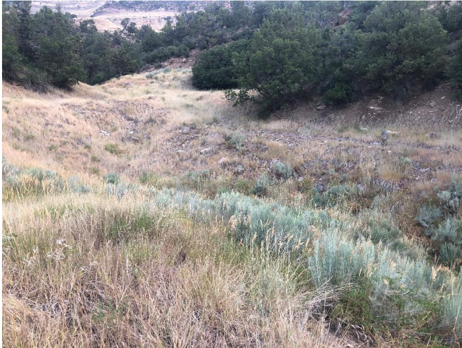
Reclaimed Pond 4 at the East Mine, looking up the drainage