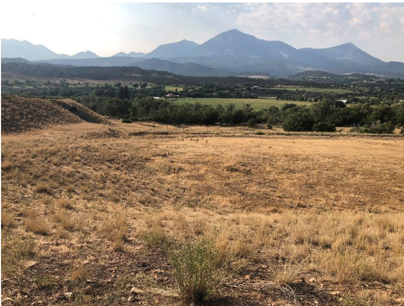
Coal storage by Highway 133, east side

Number of Partial Inspection this Fiscal Year: 1