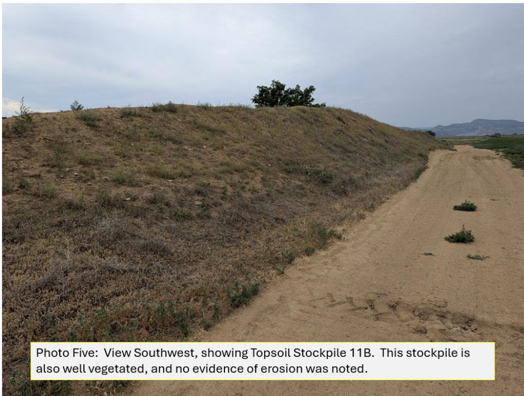
Photo Five: View Southwest, showing Topsoil Stockpile 11B. This stockpile is also well vegetated, and no evidence of erosion was noted.

Number of Partial Inspection this Fiscal Year: 1