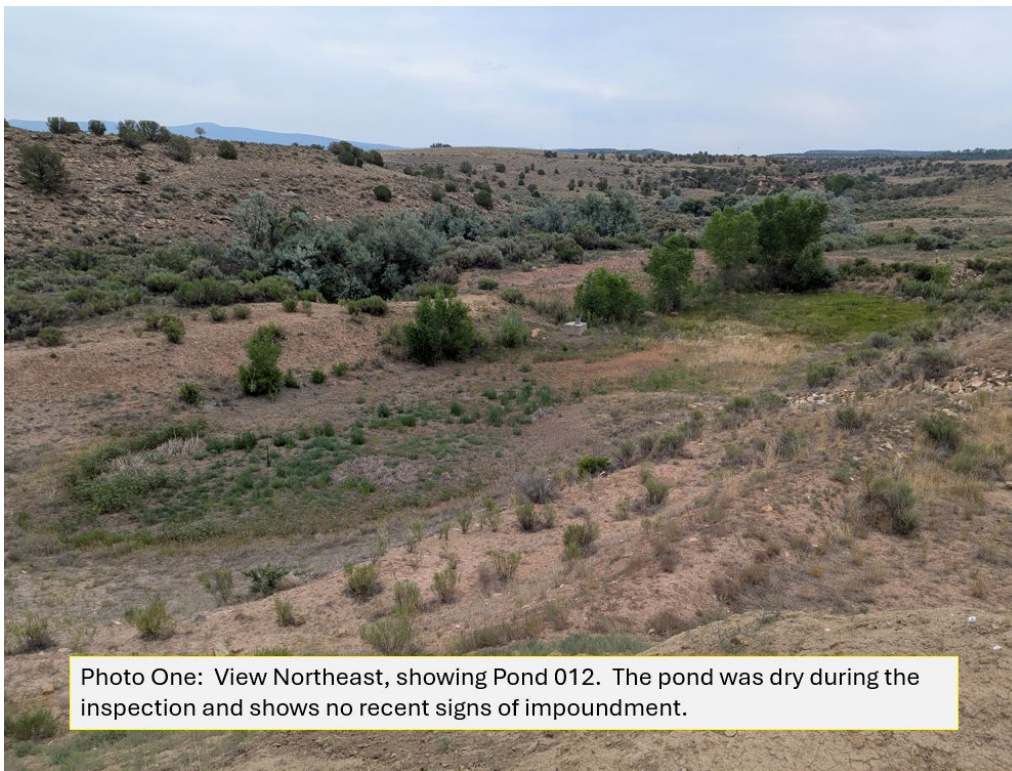
Photo One: View Northeast, showing Pond 012. The pond was dry during the inspection and shows no recent signs of impoundment.

Number of Partial Inspection this Fiscal Year: 1