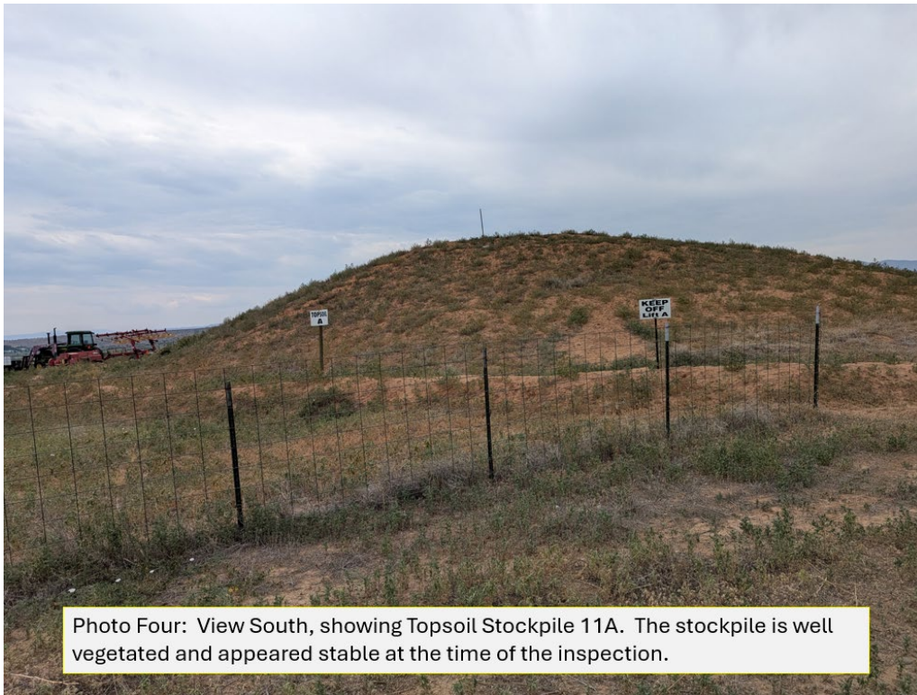
Photo Four: View South, showing Topsoil Stockpile 11A. The stockpile is well vegetated and appeared stable at the time of the inspection.