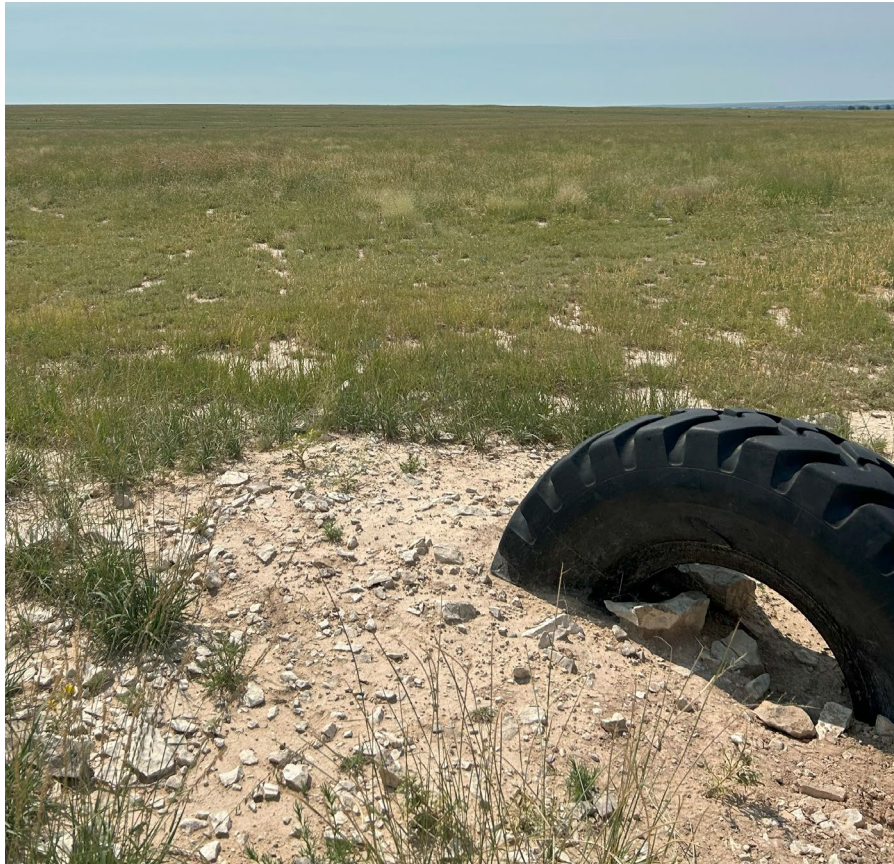
Photo 9. One of the permit boundary corner markers.