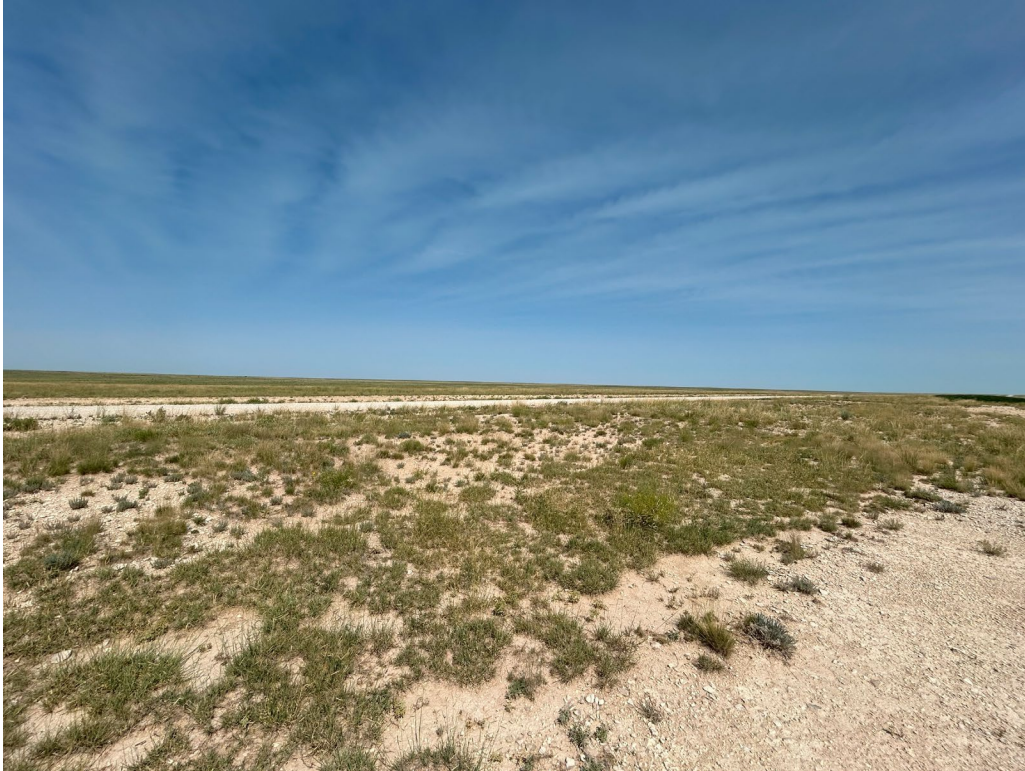
Photo 1. View looking west at Co Rd 10.