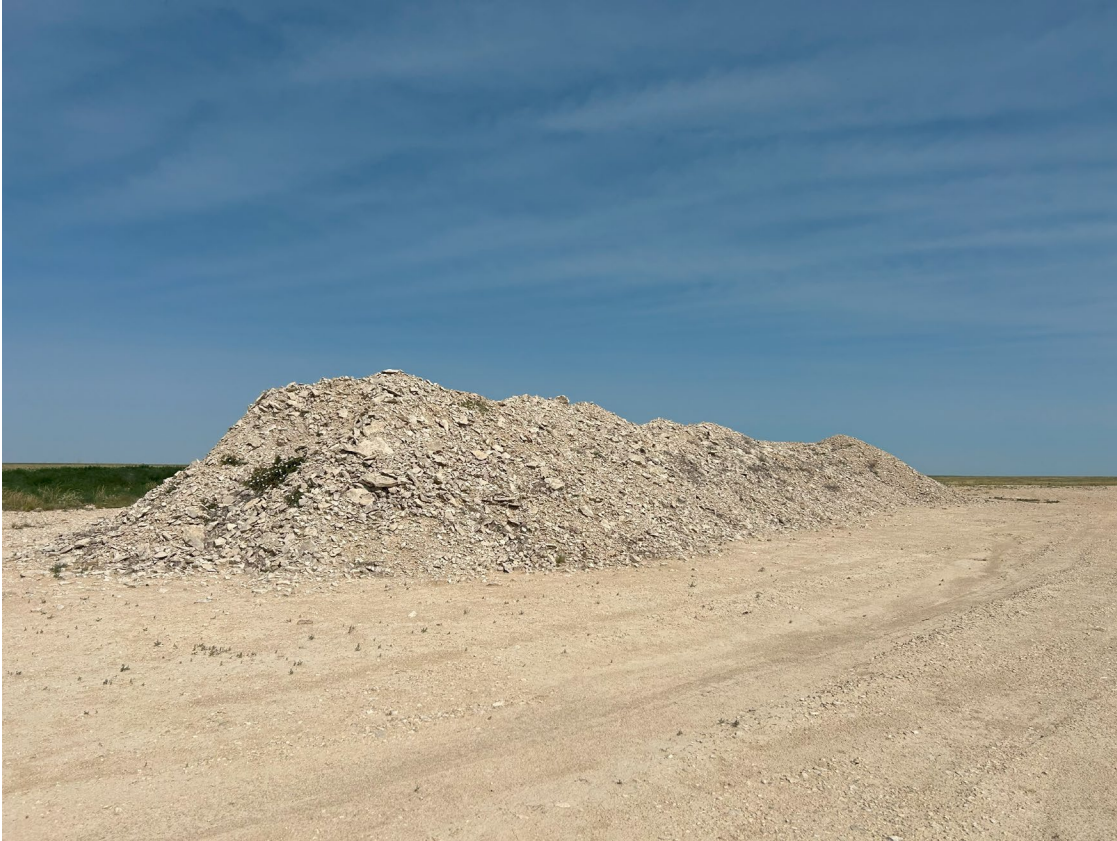
Photo 5. View looking northwest at the largest material stockpile onsite.