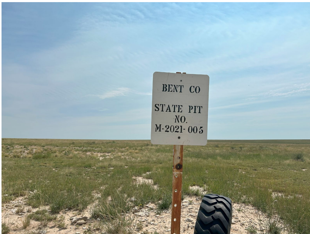
Photo 10. The posted mine identification sign that does not have the MLRB statement.