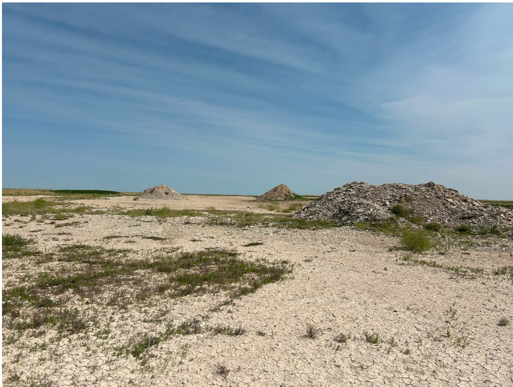
Photo 2. View of the mined area with the 3 material stockpiles, looking north.