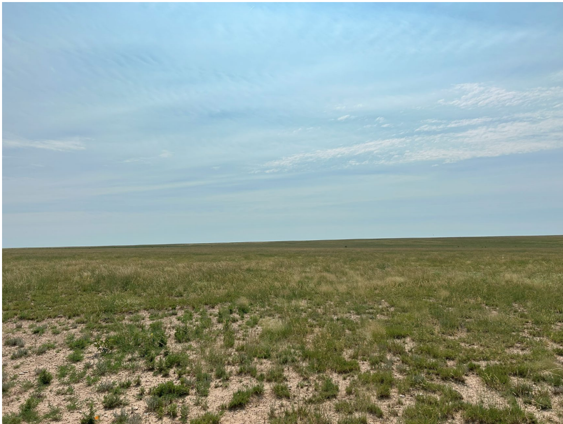
Photo 8. View looking east at the undisturbed permit area.