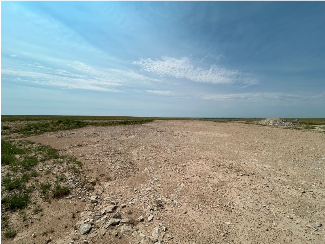
Photo 7. View looking south across the mined area.