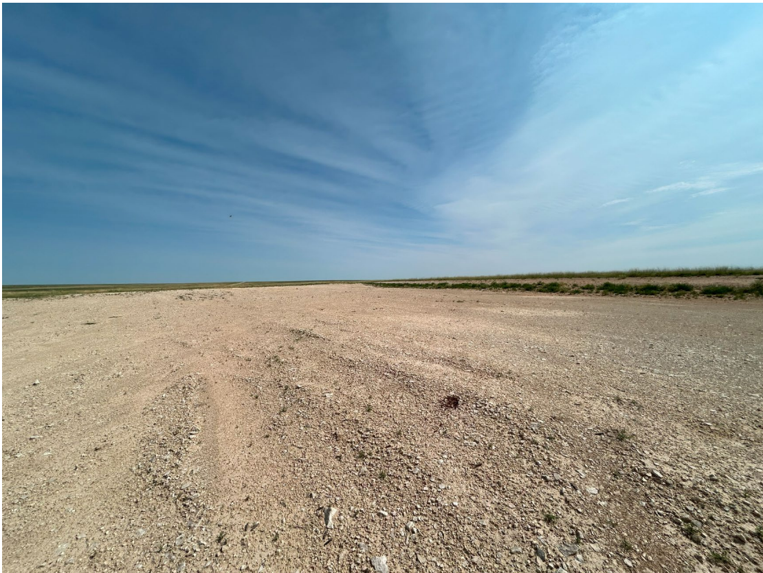
Photo 6. View looking north at the mined area.