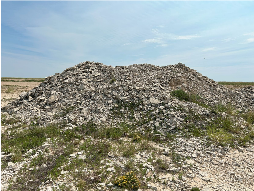
Photo 3. One of the material stockpiles.