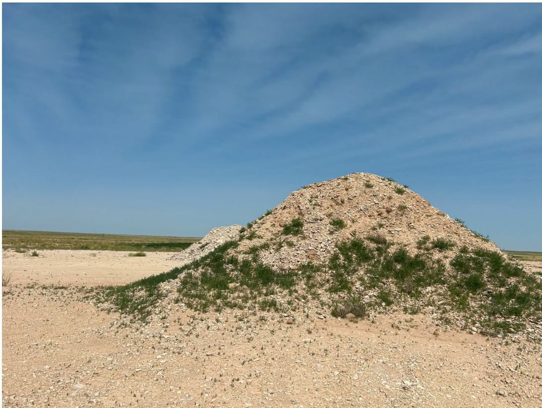
Photo 4. Looking west at one of the material stockpiles.