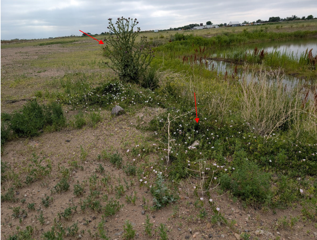
Photo 7: Noxious weeds observed on the north side of the pond. Red arrows point to thistle and bindweed plants.