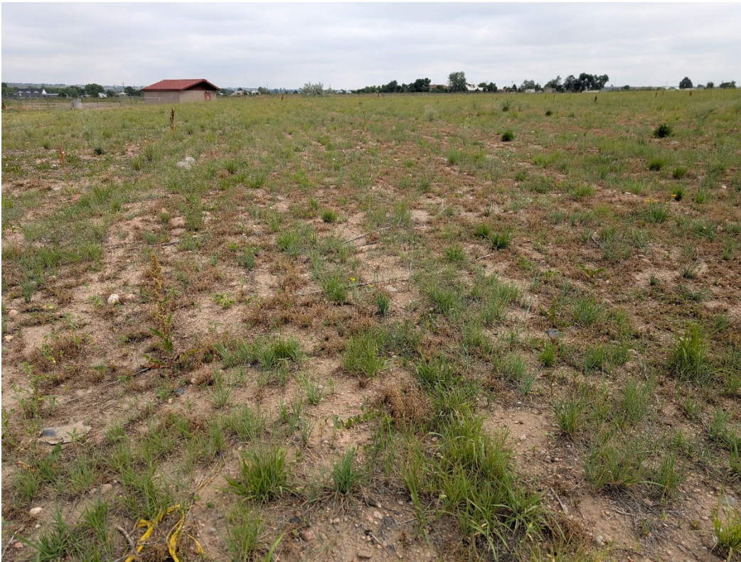
Photo 1: Looking north across the revegetated stockpile area on the adjacent parcel.