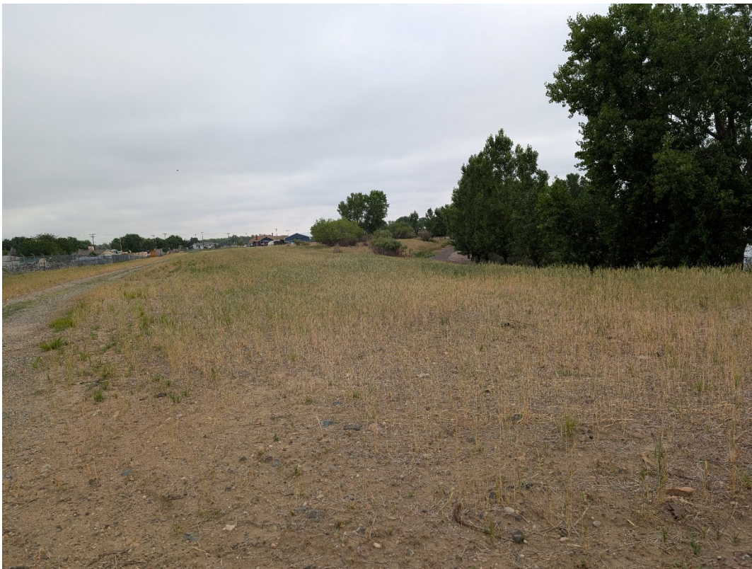
Photo 4: Looking north from the northwest corner of the permit area. The shoreline of the adjacent ski lake, north of the mining area has been reclaimed and the lake is currently used for water storage.