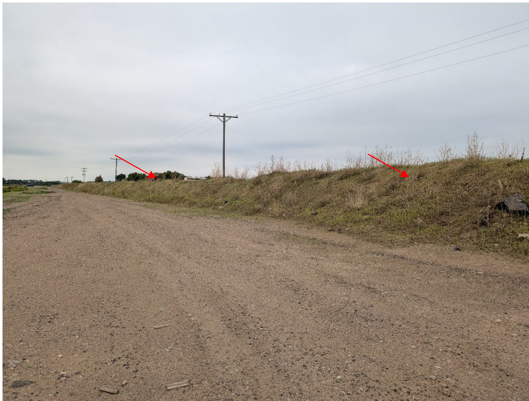
Photo 8: Gravel road that will remain in the permit area. Topsoil berms observed around the perimeter of the mined area (red arrows).