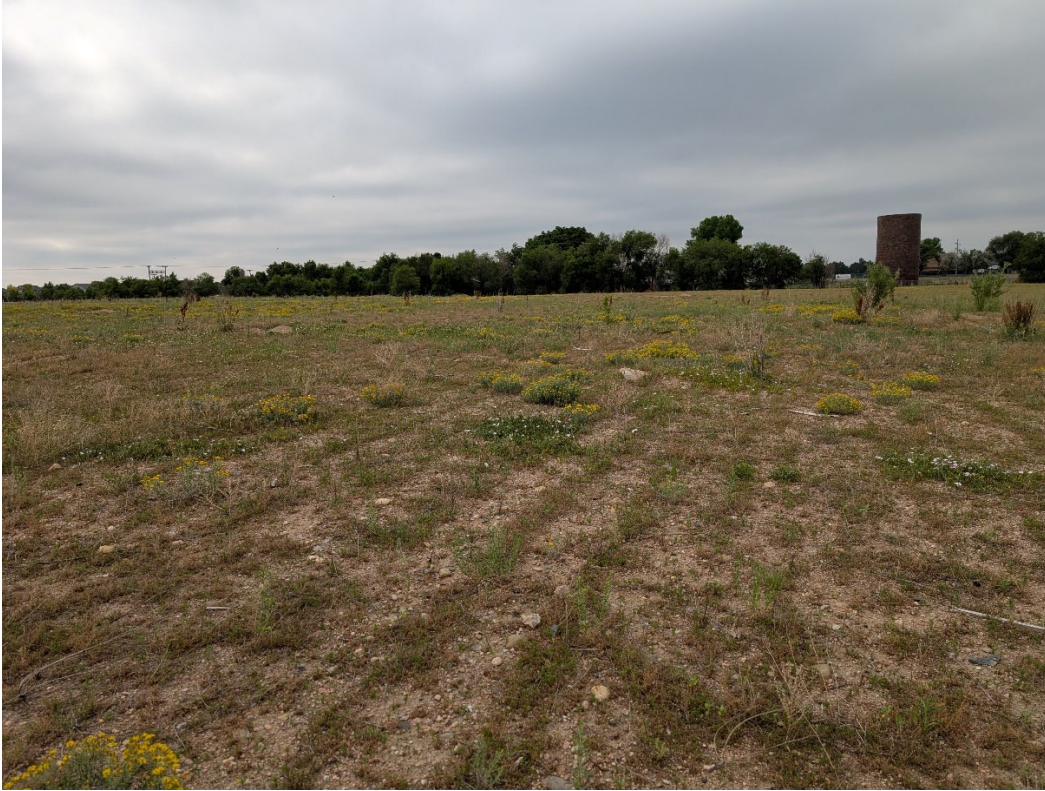
Photo 3: Looking south across the adjacent parcel in the area of the former access road.