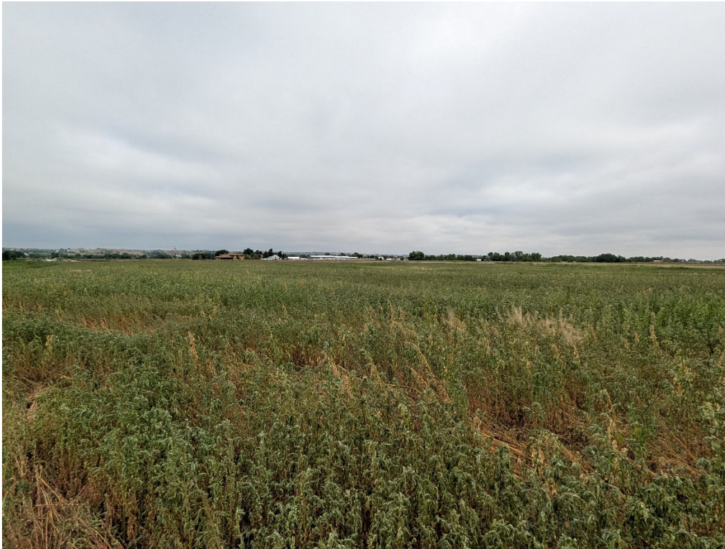
Photo 5: Looking northwest across the backfilled pit. Annual weeds (kochia) observed covering this area.