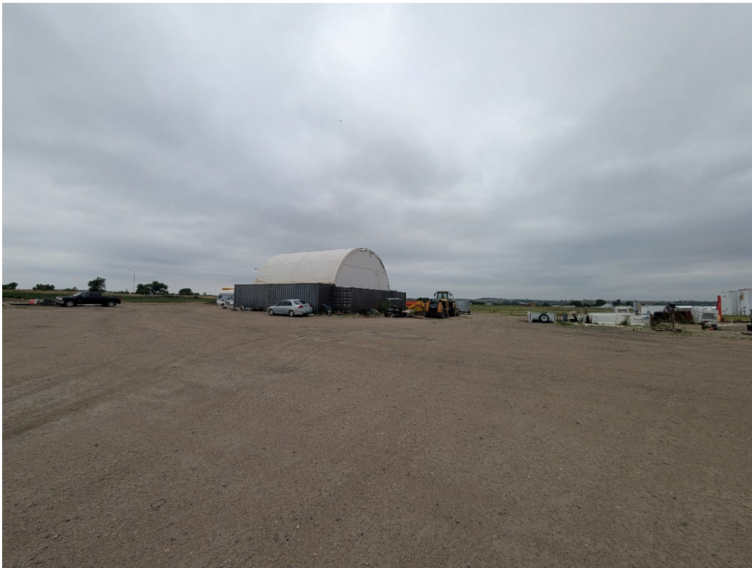
Photo 12: Canvas structure observed in a storage area on the east side of the permit area.