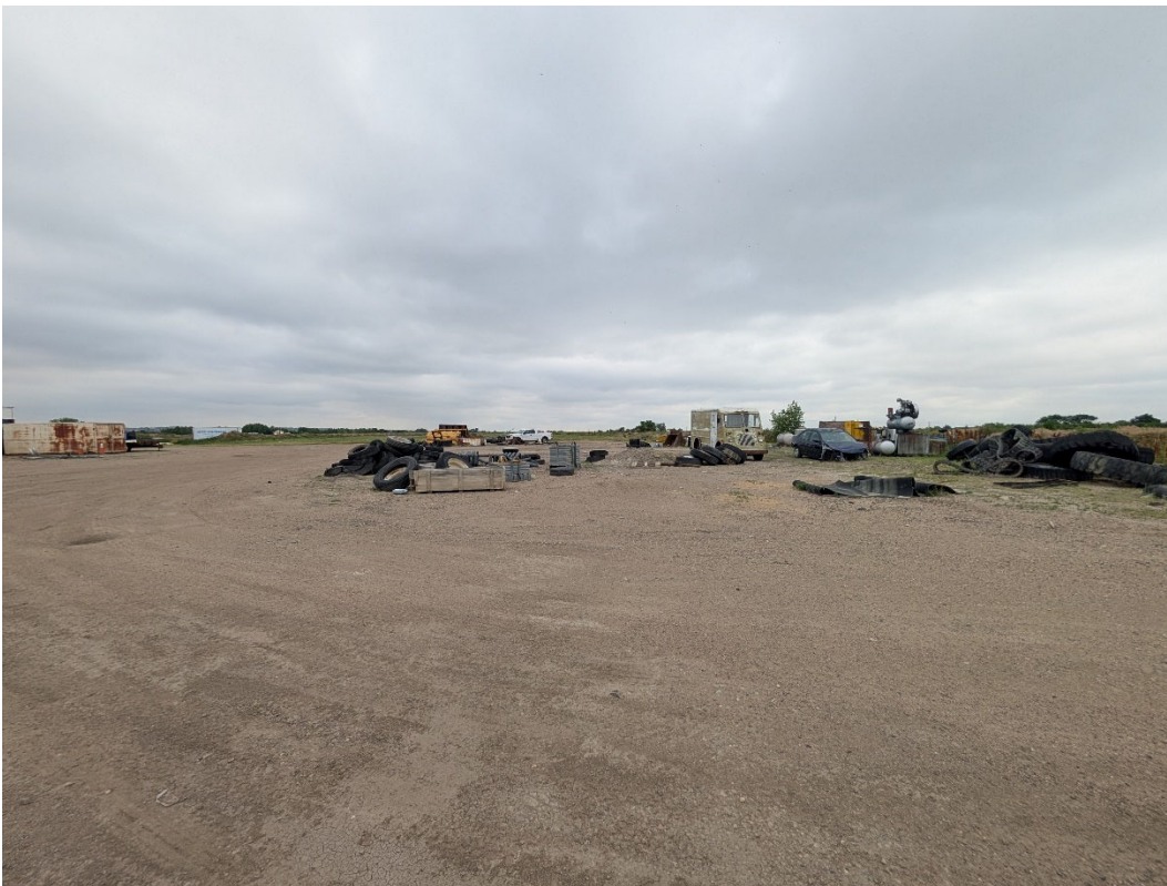
Photo 10: Looking north across a storage area on the east end of the permit area. Tires, cars and trash were observed here.