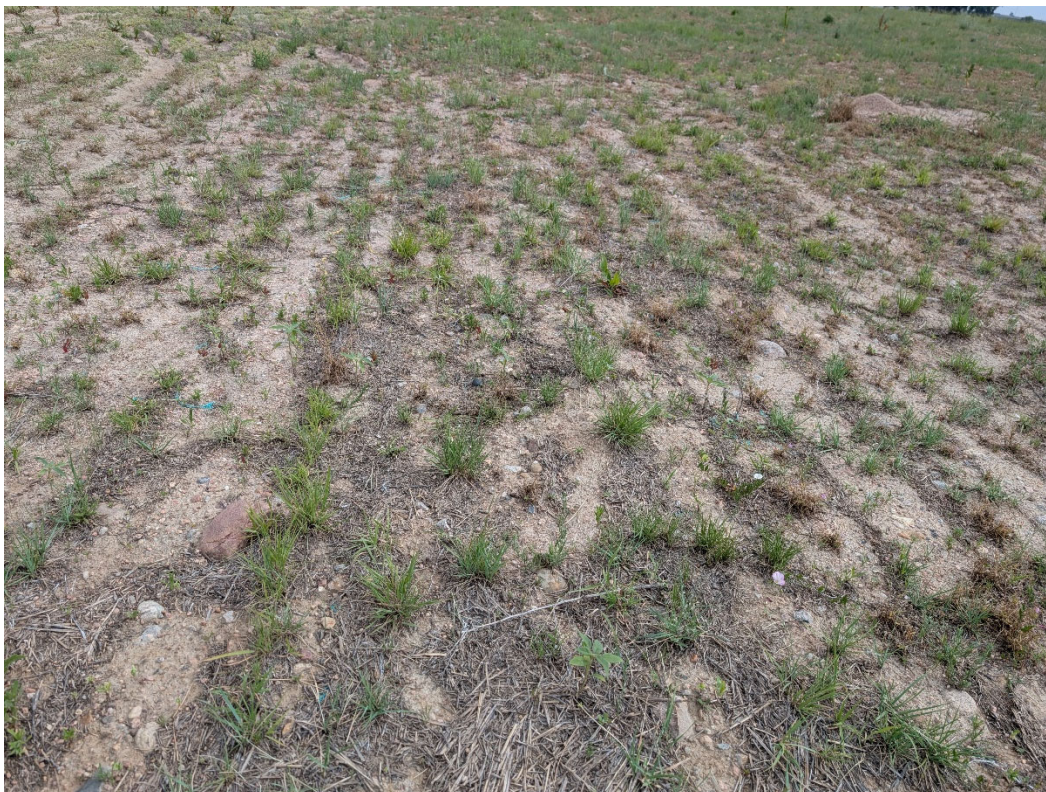
Photo 2: Grasses observed growing in the area of the former access road on the adjacent parcel.