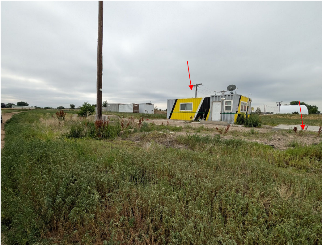
Photo 9: Office trailer and scale on the south side of the permit area (red arrows). Cheatgrass noted here.