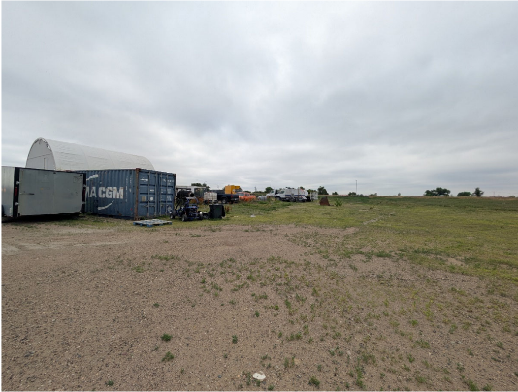
Photo 11: East end of the permit area. Trailers and vehicles stored on site.