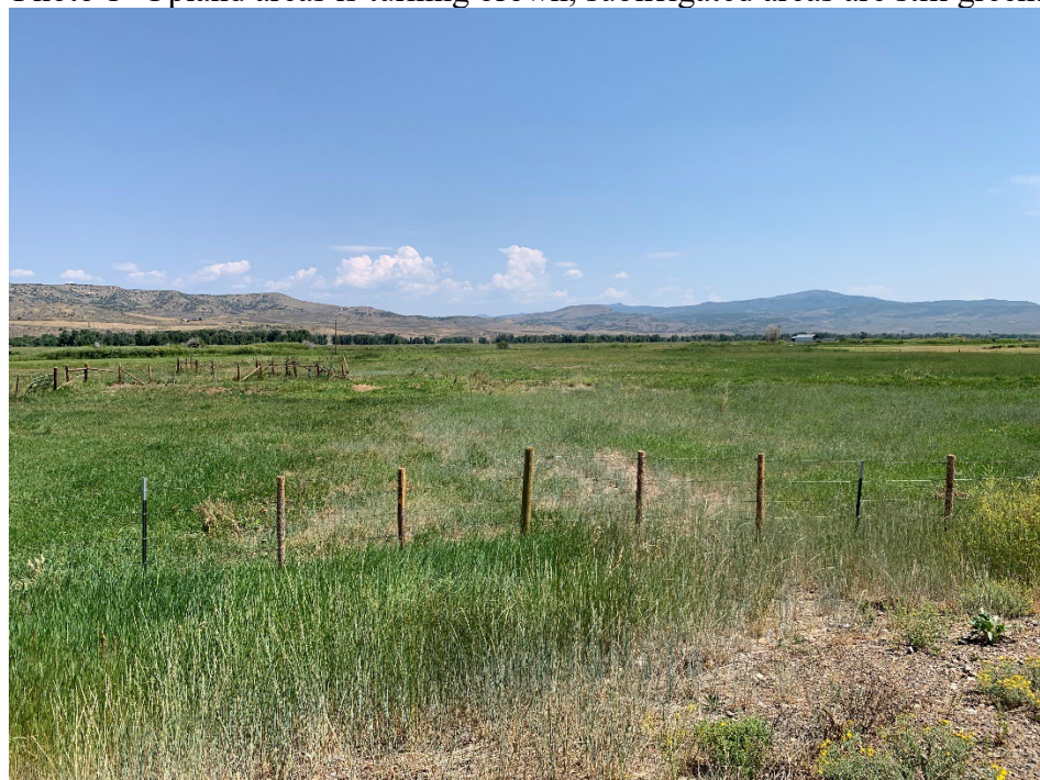
Photo 2- Reclamation area north of Hwy 40.

Number of Partial Inspection this Fiscal Year: 1