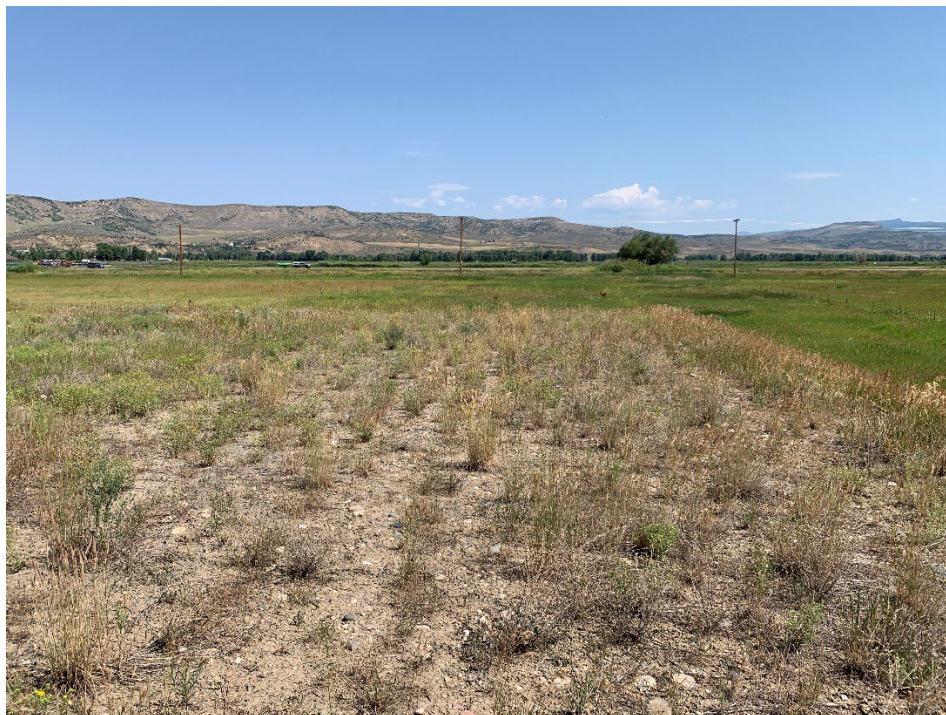
Photo 1- Upland areas is turning brown, subirrigated areas are still green.