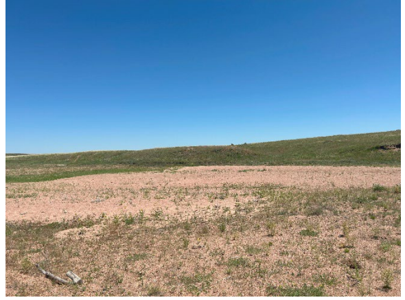
Photo 2: Center of pit facing east. This is the primary area of disturbance.