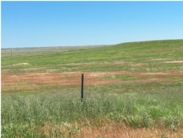
Photo 3: Example boundary marker located toward the adjacent wind farm.