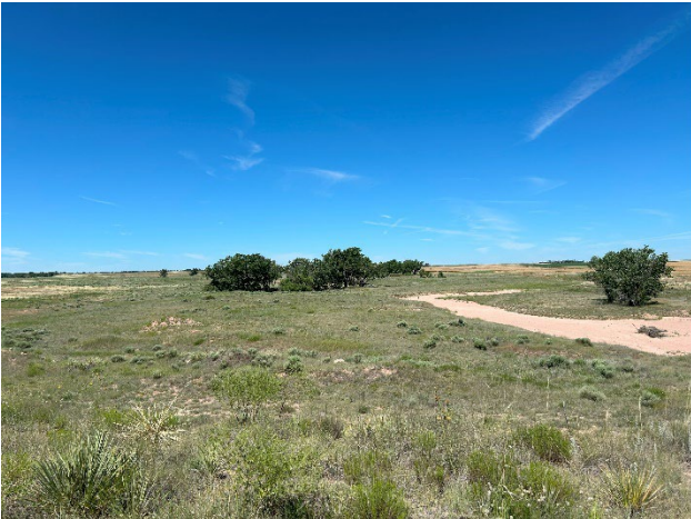
Photo 3: Revegetated area within the permit boundary. Little to no weed presence and complete cover were observed.