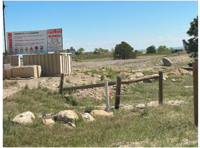
Photo 2: Posted pvc boundary marker, located near the main access road.