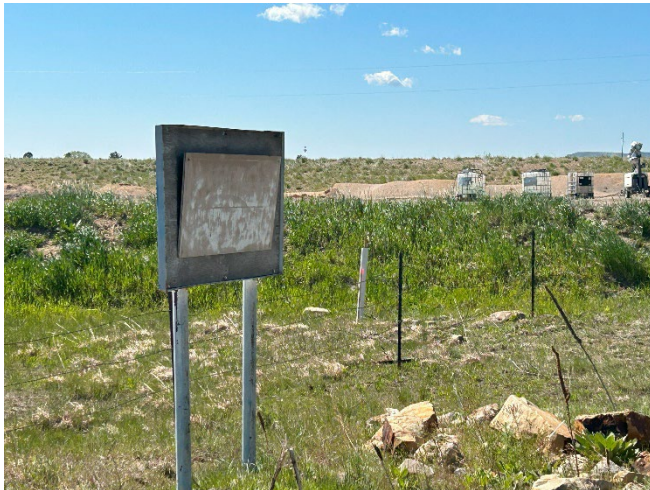
Photo 3: Boundary marker located near the entrance to the Church Pit.