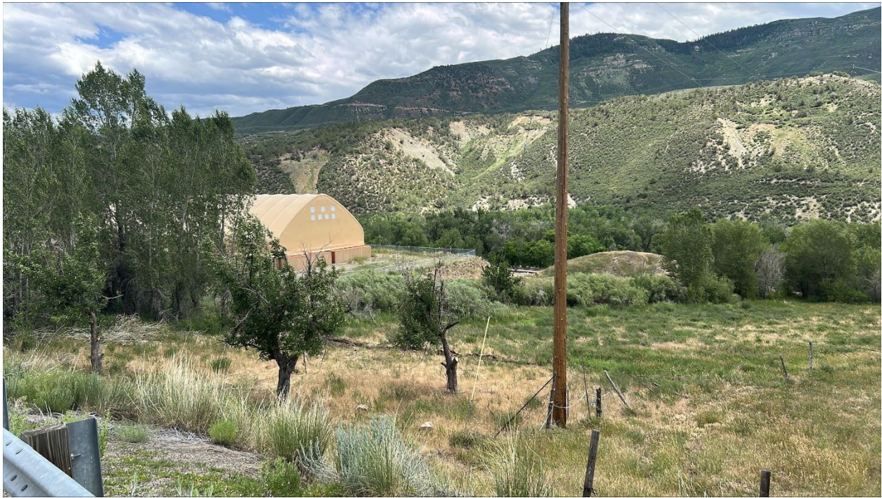
Figure 1: Topsoil stockpile