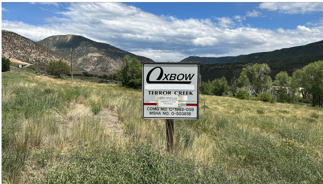
Figure 4: Mine ID sign

Number of Partial Inspection this Fiscal Year: 8