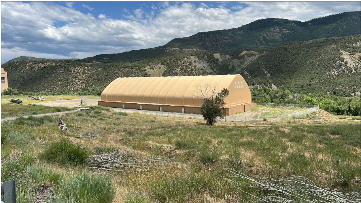
Figure 2: Lower pad

Number of Partial Inspection this Fiscal Year: 8