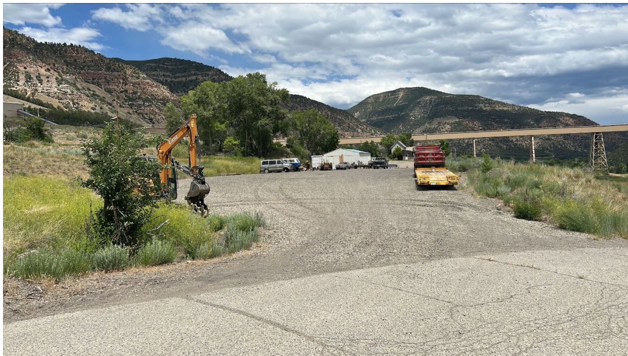
Figure 3: Upper pad