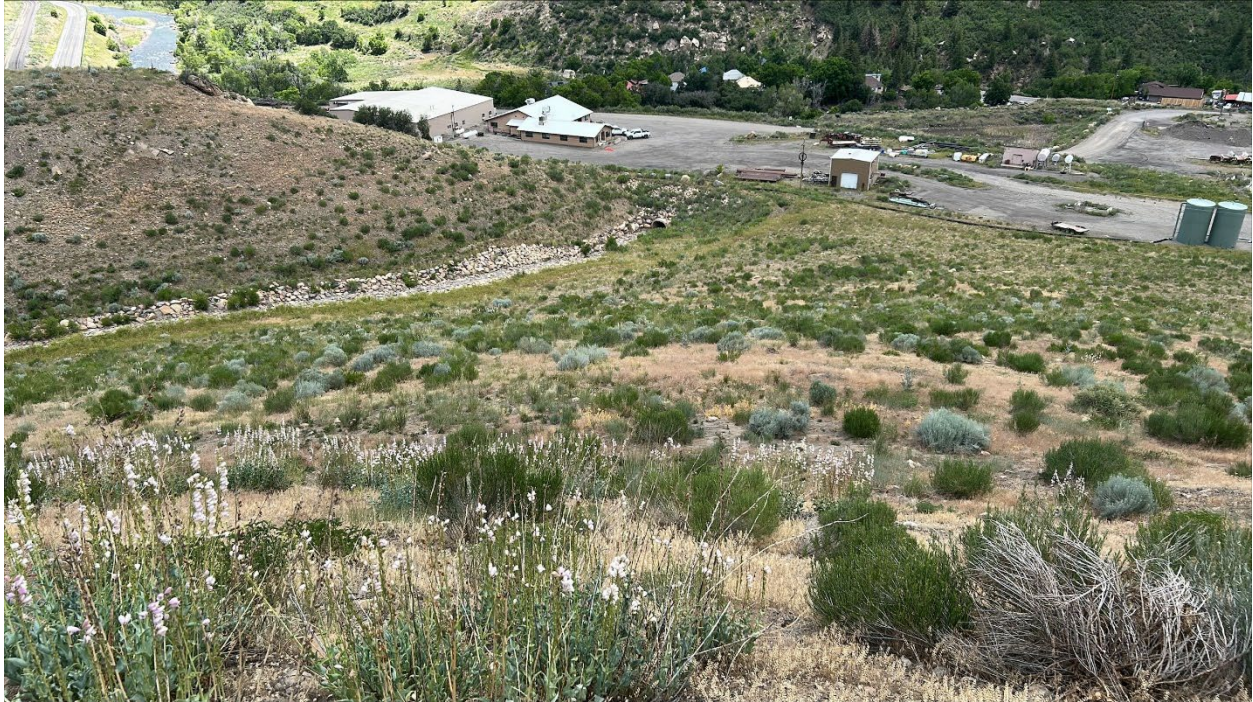
Figure 2: Facilities area (office, shop). and reclaimed Elk Creek channel