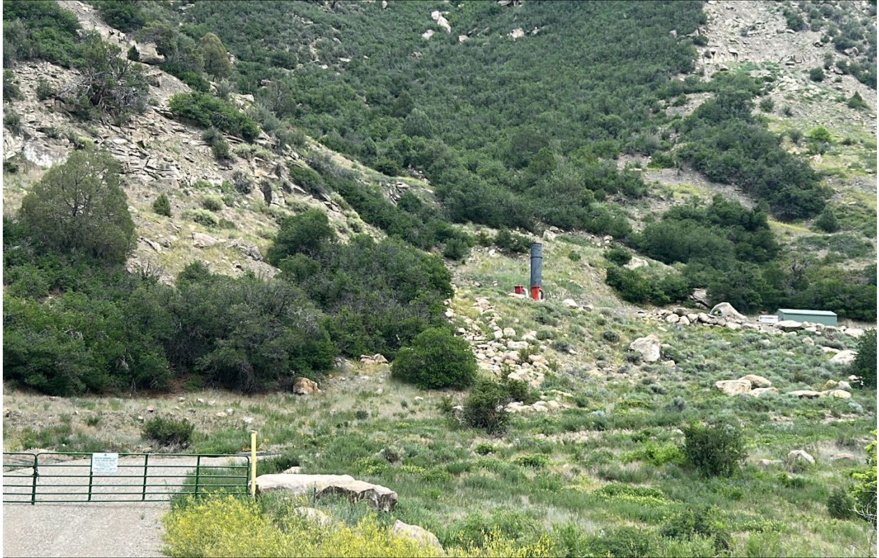
Figure 4: Hubbard Creek Methan Destruction Project

Number of Partial Inspection this Fiscal Year: 8