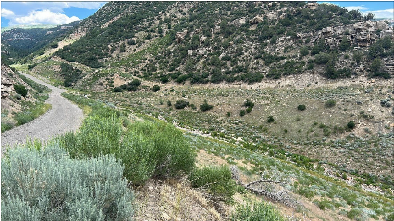
Figure 3: Elk Creek

Number of Partial Inspection this Fiscal Year: 8