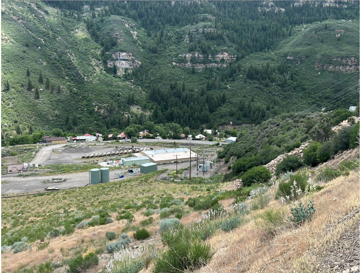
Figure 1: Facilities area (substation, bath house, fuel storage)

Number of Partial Inspection this Fiscal Year: 8