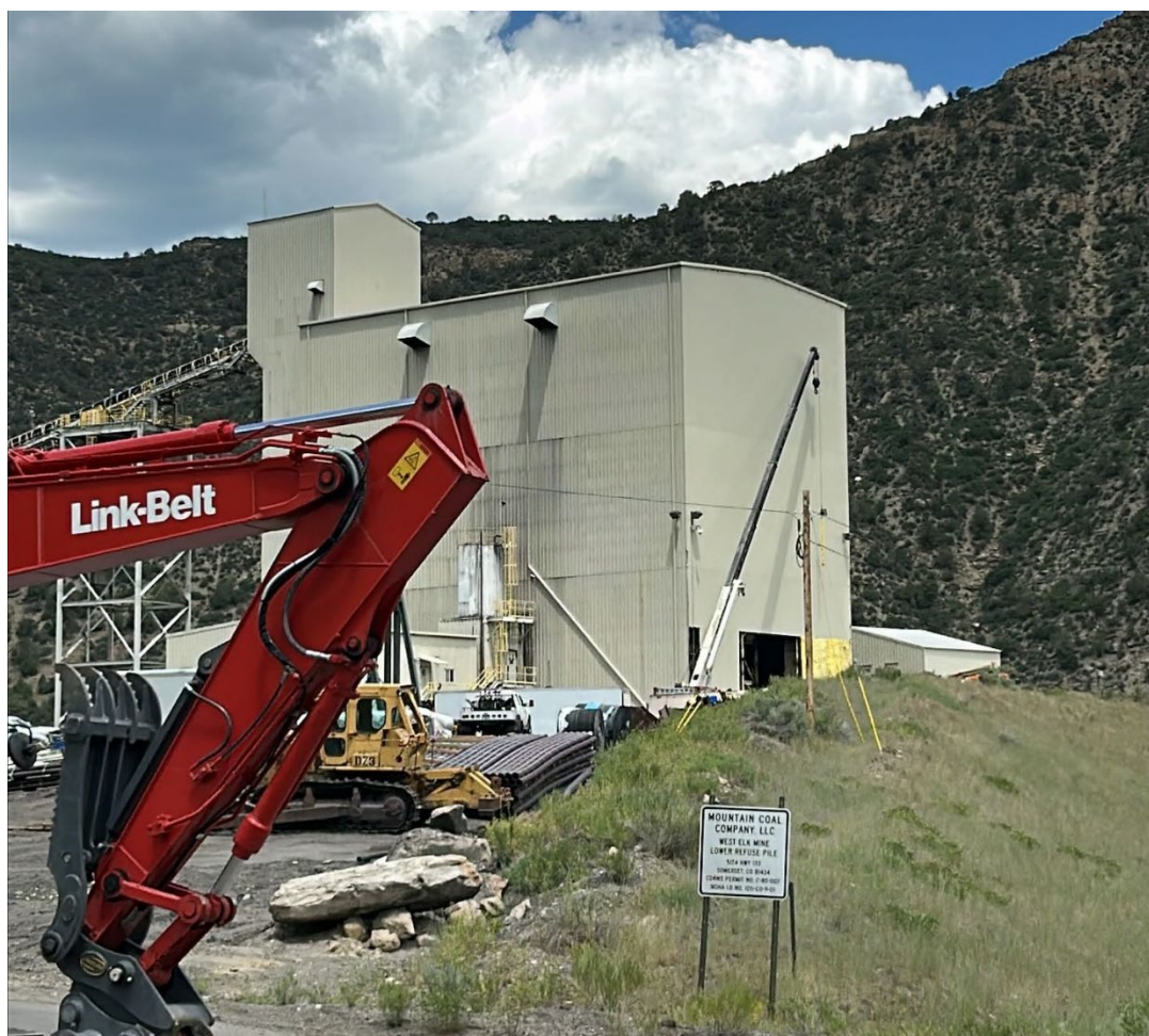
Figure 3: Maintenance work in progress on prep plant

Number of Partial Inspection this Fiscal Year: 8