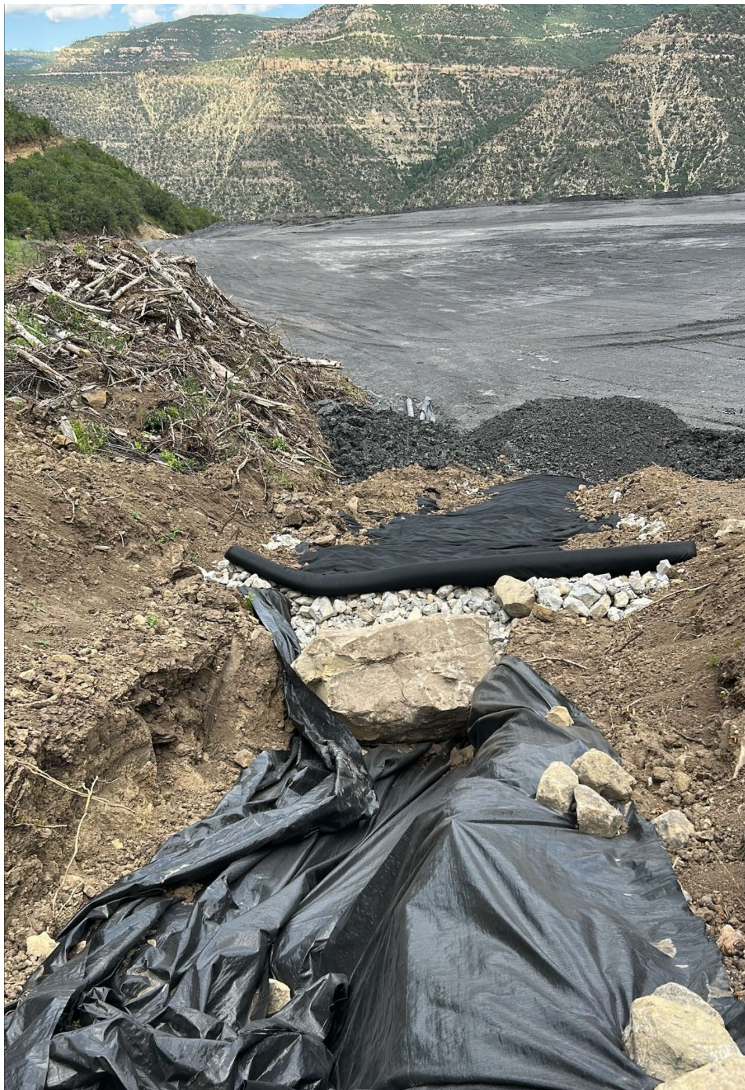
Figure 4: Newly extended underdrain on RPEE

Number of Partial Inspection this Fiscal Year: 8