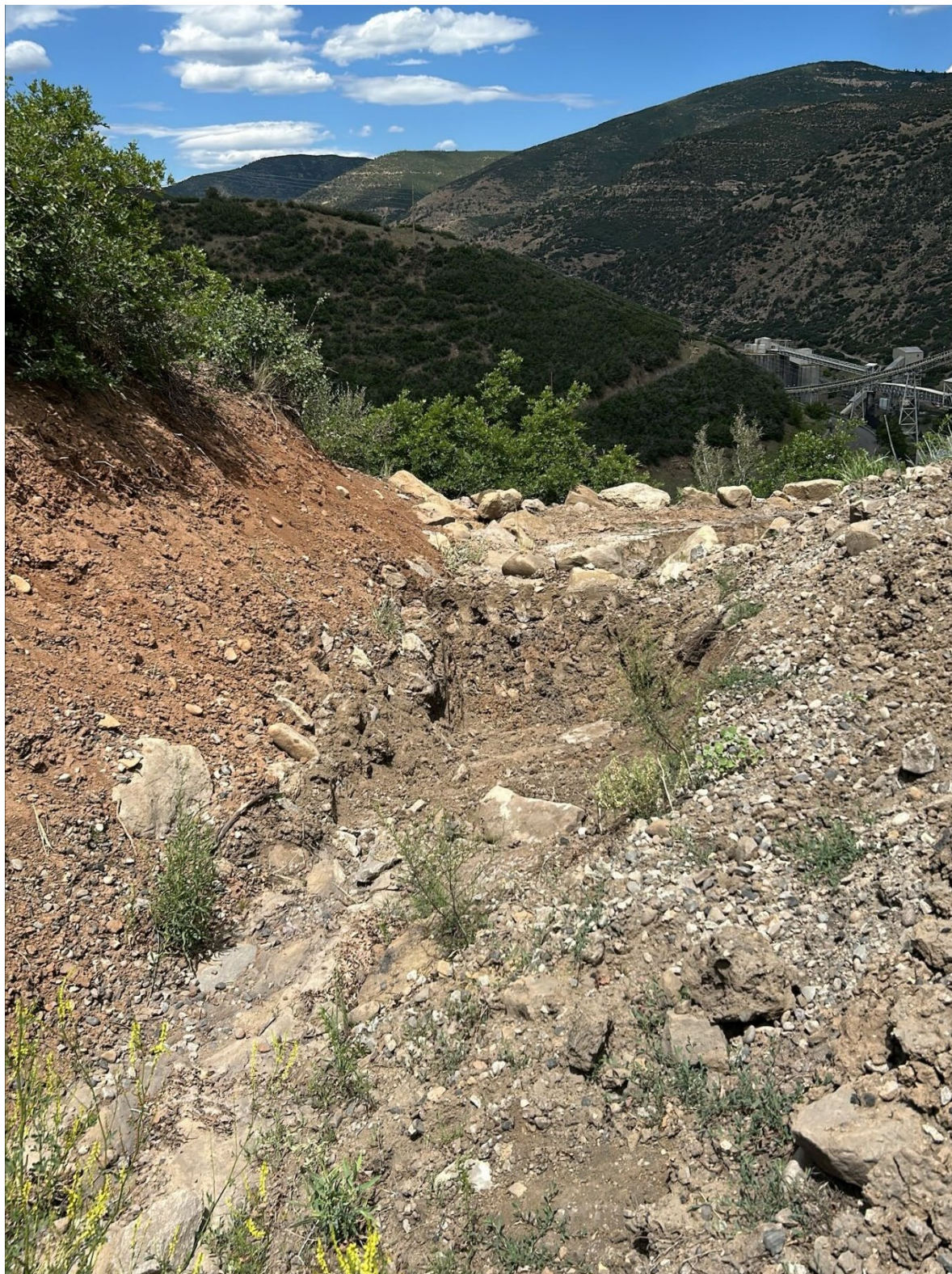
Figure 8: Sediment trap on RPEE haul road

Number of Partial Inspection this Fiscal Year: 8