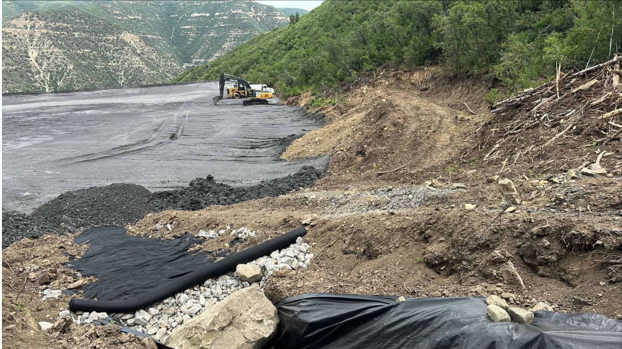
Figure 5: RPEE (eastern edge), showing vegetation and scrap metal moved