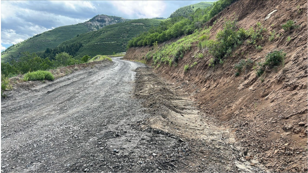
Figure 7: Recent ditch cleaning on RPEE haul road

Number of Partial Inspection this Fiscal Year: 8