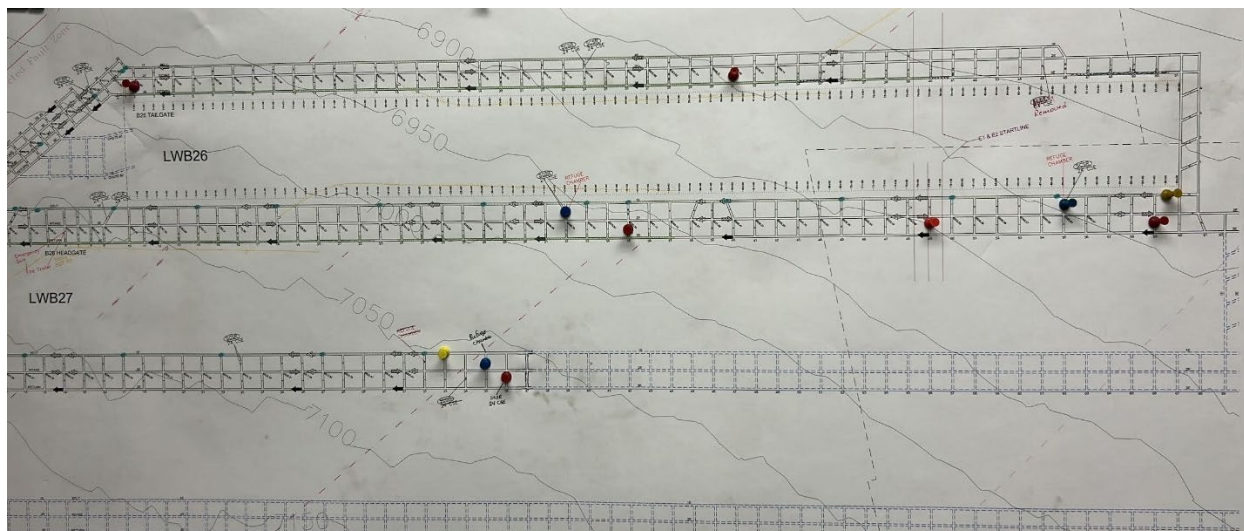
Figure 2: Mine map showing LWB26, 27 and 28 panels