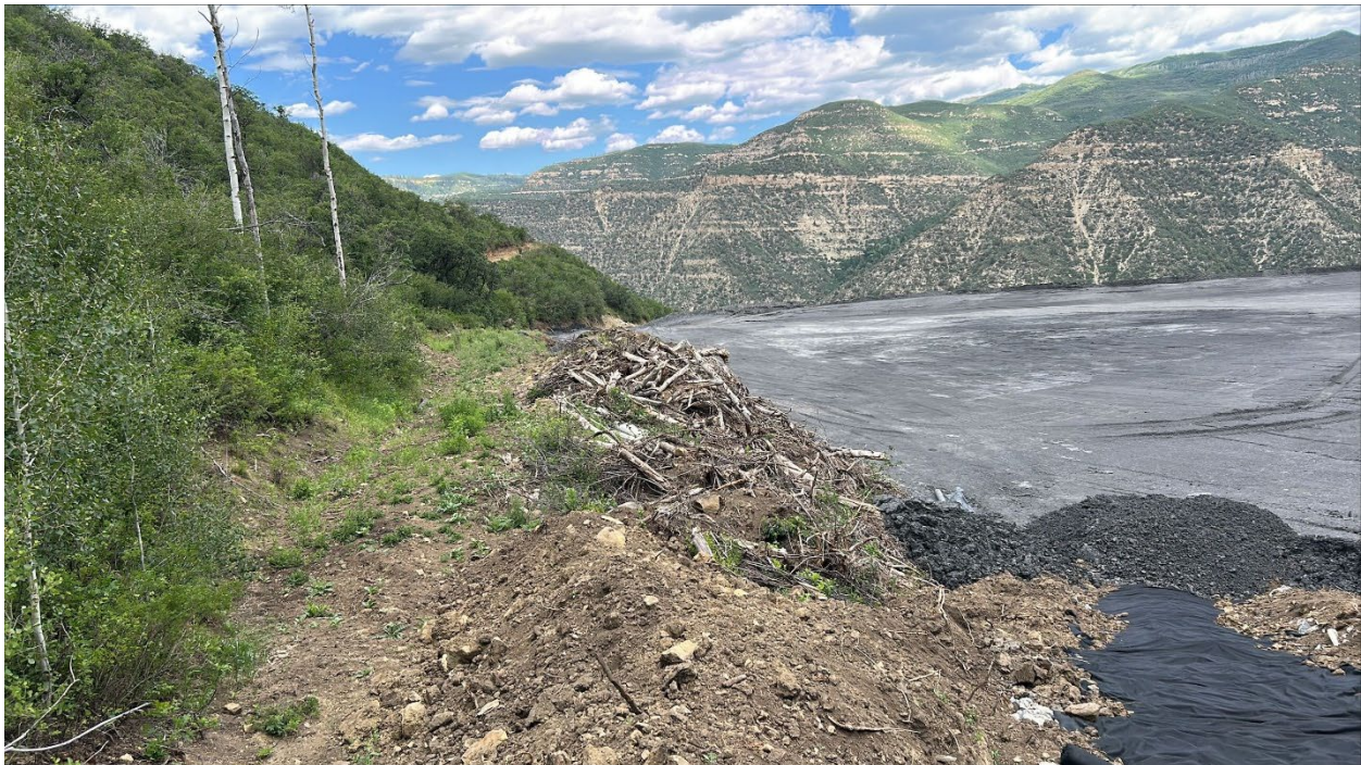
Figure 6: RPEE (western edge)

Number of Partial Inspection this Fiscal Year: 8