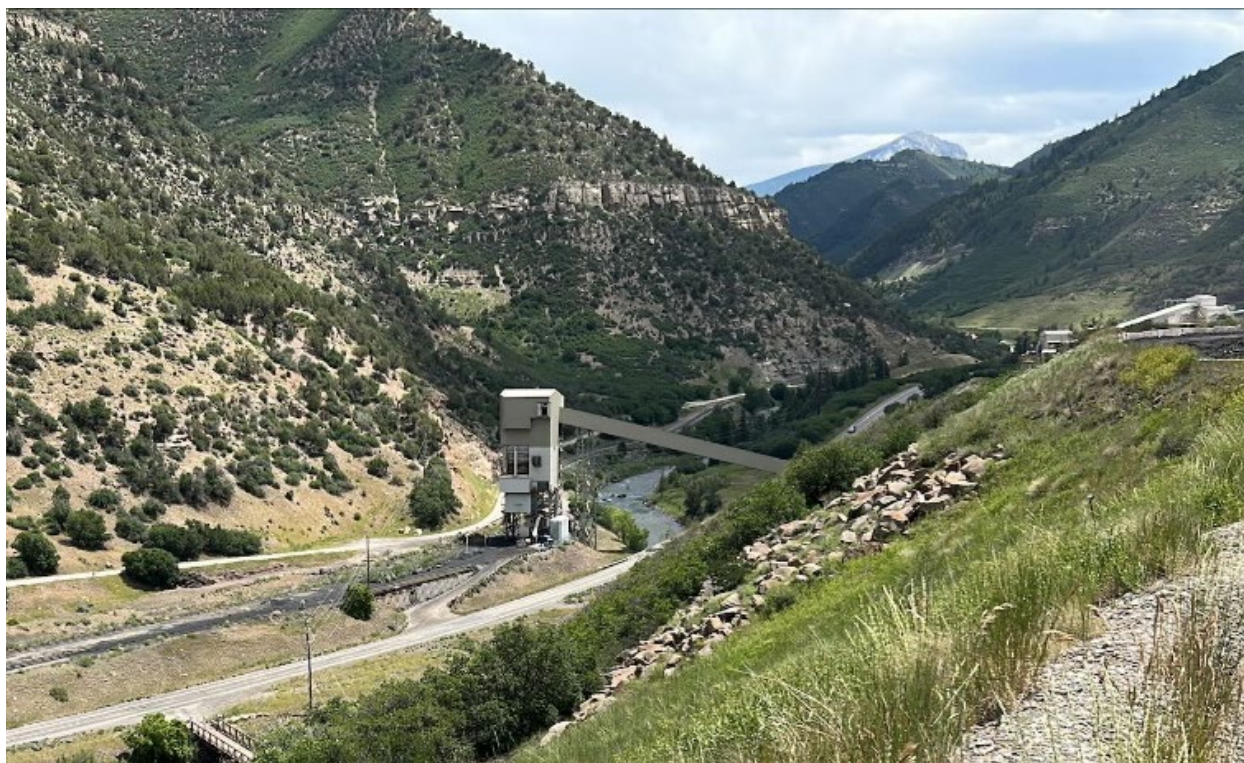
Figure 10: Train loadout

Number of Partial Inspection this Fiscal Year: 8