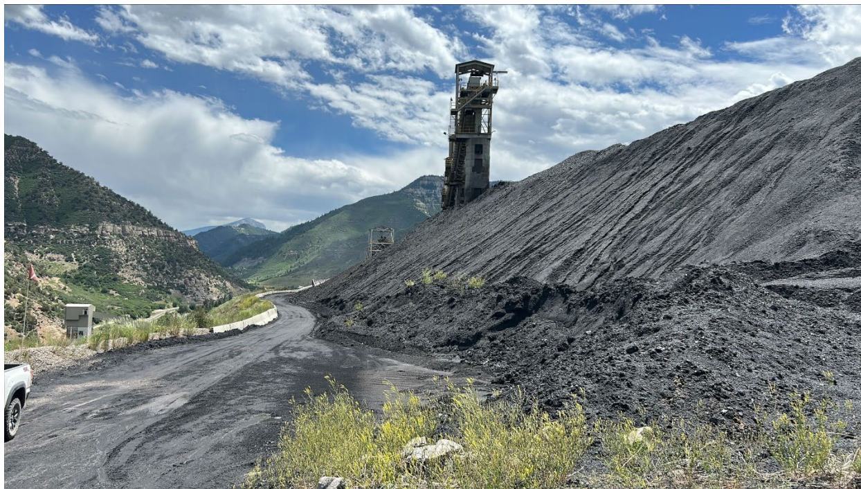
Figure 9: Run-of-mine stockpile