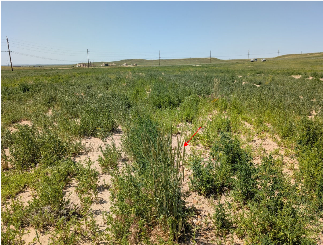
Photos 5 & 6: Looking at the vegetation in the stockpile area. Some native grasses were observed here.