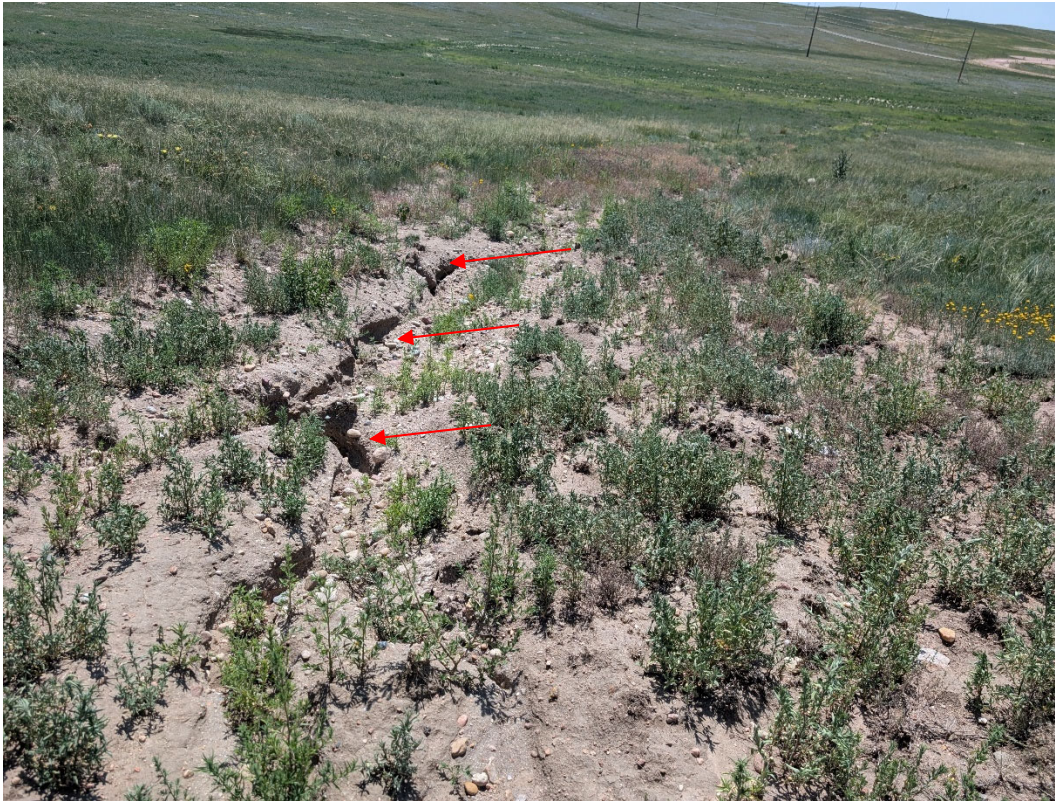
Photo 8: Erosion rills noted near the top of the eastern access road.