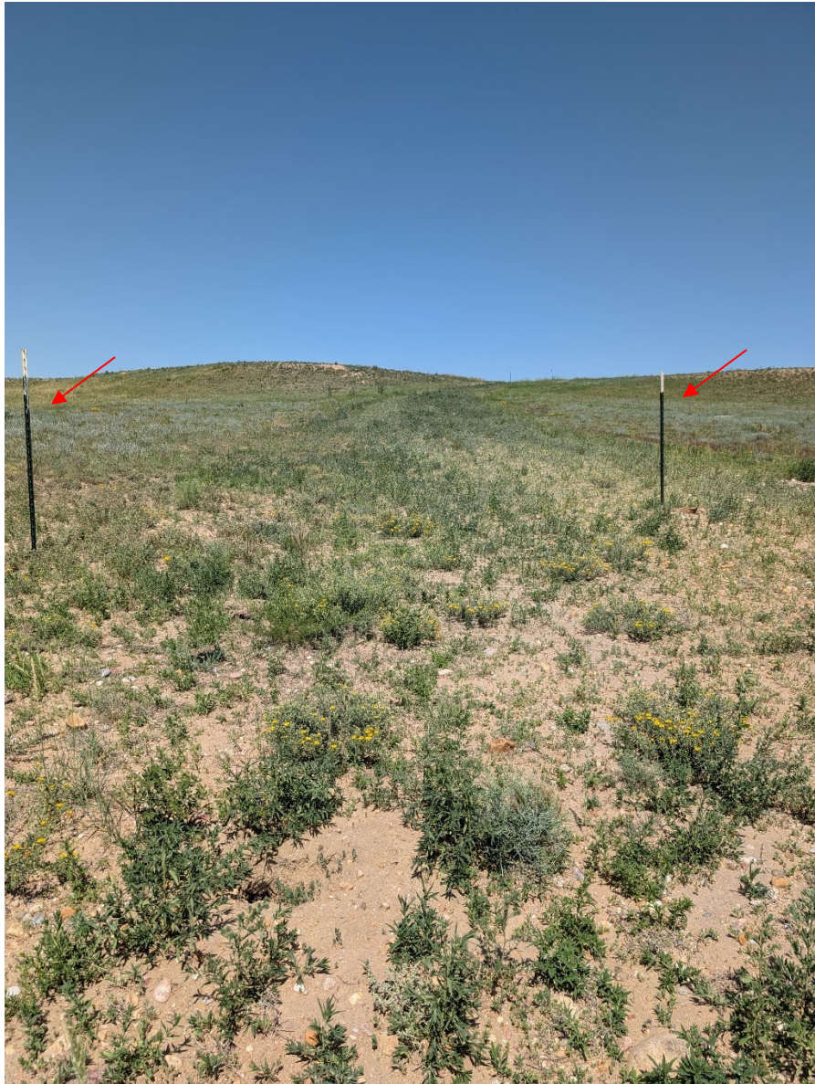
Photo 8: Looking at the western access road. T-posts mark the permit boundary along the roads (red arrow).