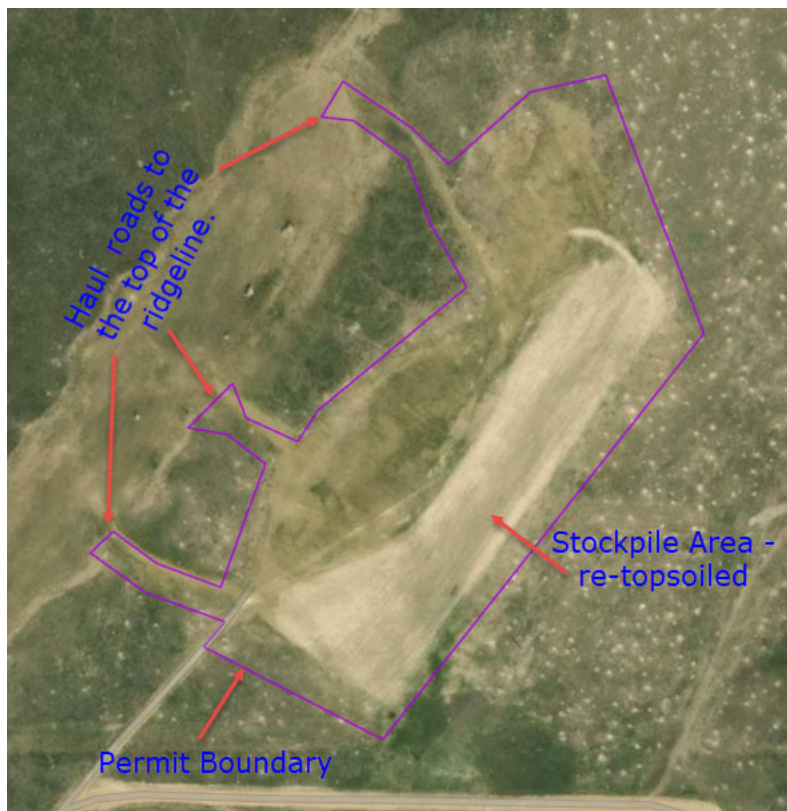
Figure 1: Google imagery showing the remaining segments in the permit area (purple boundary).