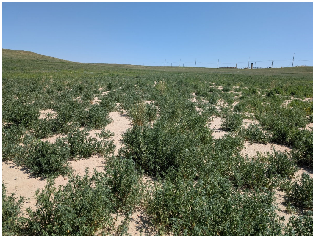
Photo 2: Looking north across the stockpile area. Kochia dominates this area.