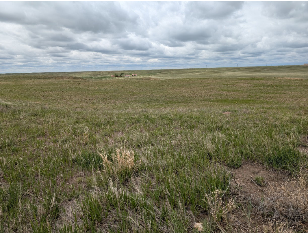
Photo 4: Looking southwest into the pit from the entrance to the pit from the access road.