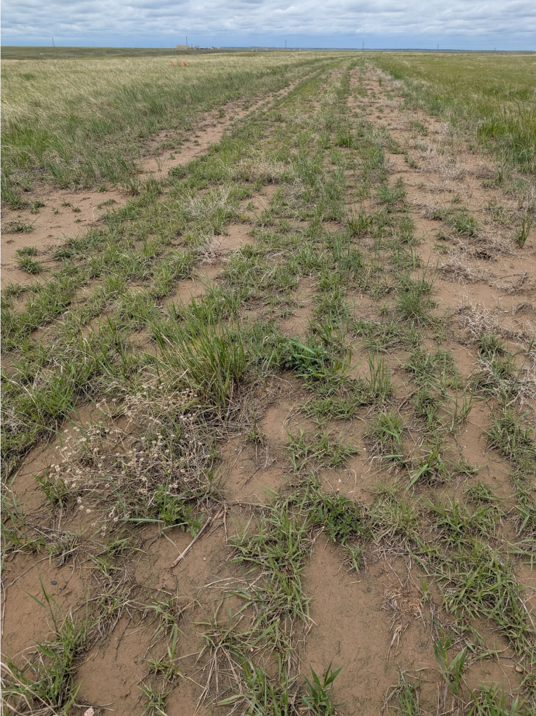
Photo 7: Looking southeast at grassy vegetation on the road, near the entrance of the site.