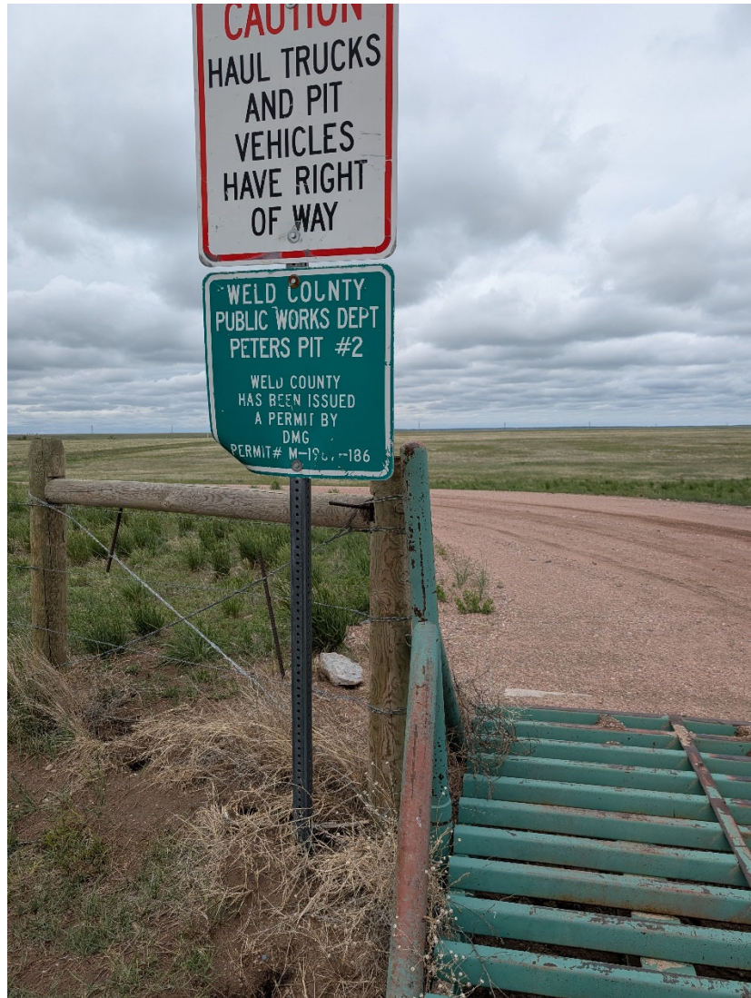
Photo 8: Mine sign installed at the entrance to the pit on WCR 136.5