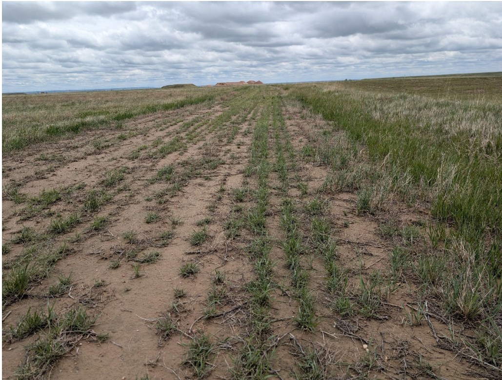
Photo 5: Looking south at the rows of drill seeded grass reestablishing on the access road near the entrance to the pit.