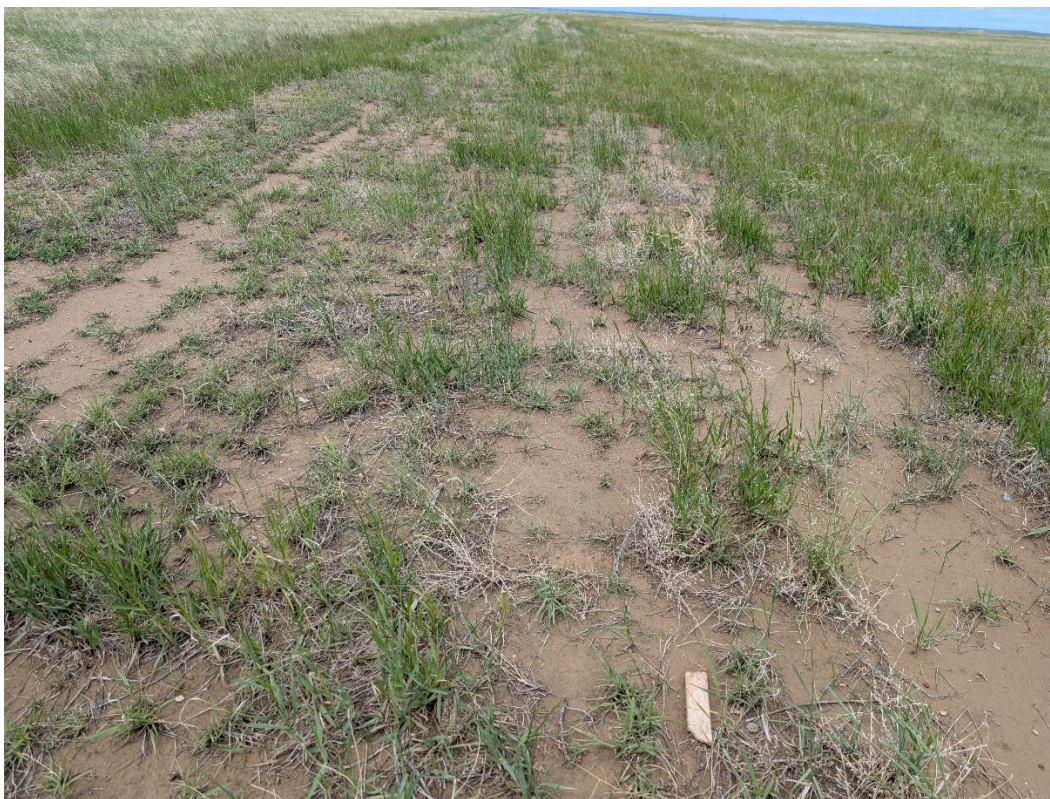
Photo 6: Looking south at revegetation along the center of the access road.