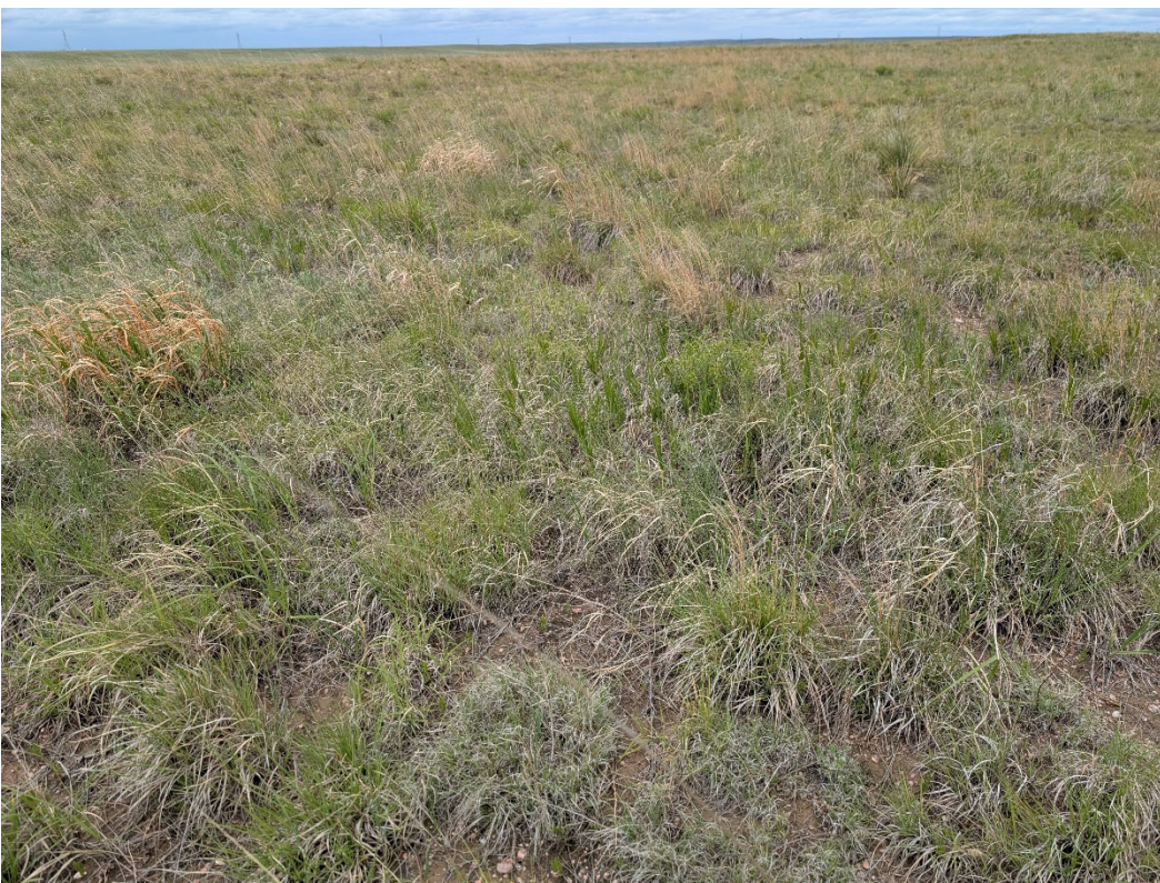
Photo 2: Looking west, close up view of the diverse grassy vegetation on the pit floor.