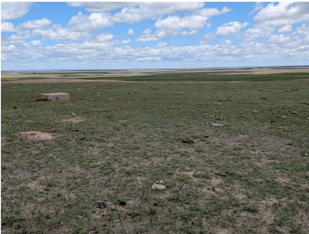
Photo 4: Looking north from the entrance. Evidence of grazing observed here.