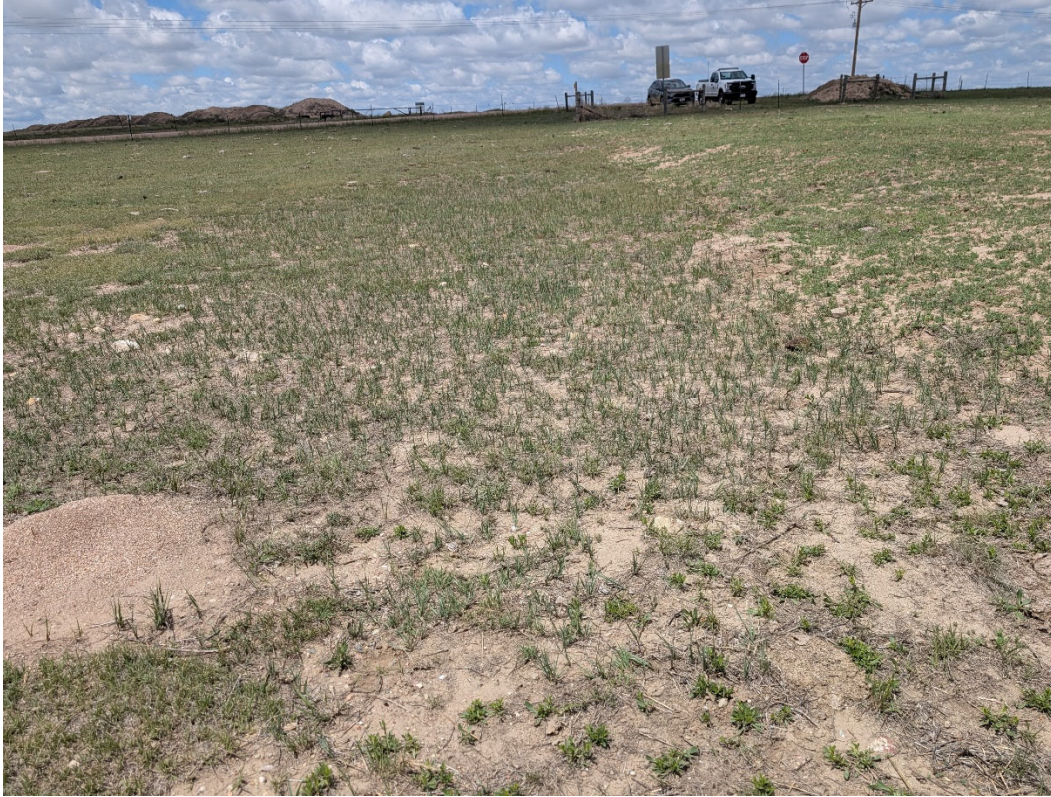
Photo 3: Looking west towards the entrance to the pit. This area has been re-topsoiled and re-seeded. Some kochia here, but overall erosion is well controlled and the native grasses are establishing.