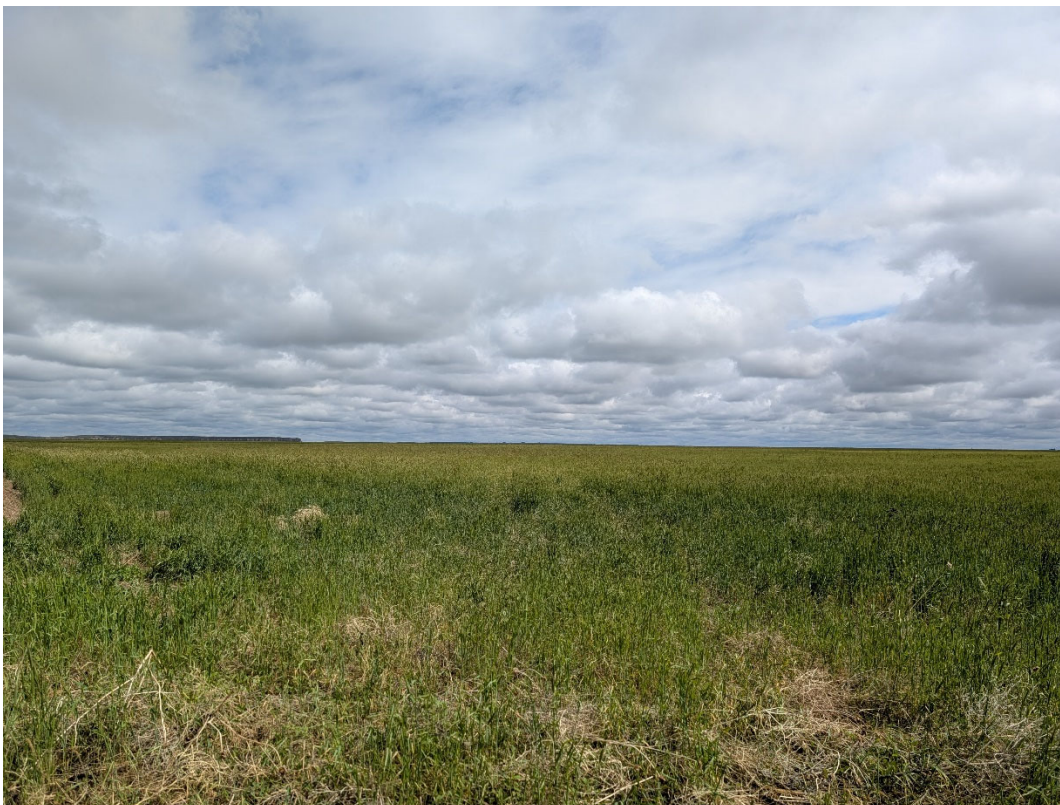
Photo 10: Dryland crop planted in the proposed amendment area, east of the existing permit area.