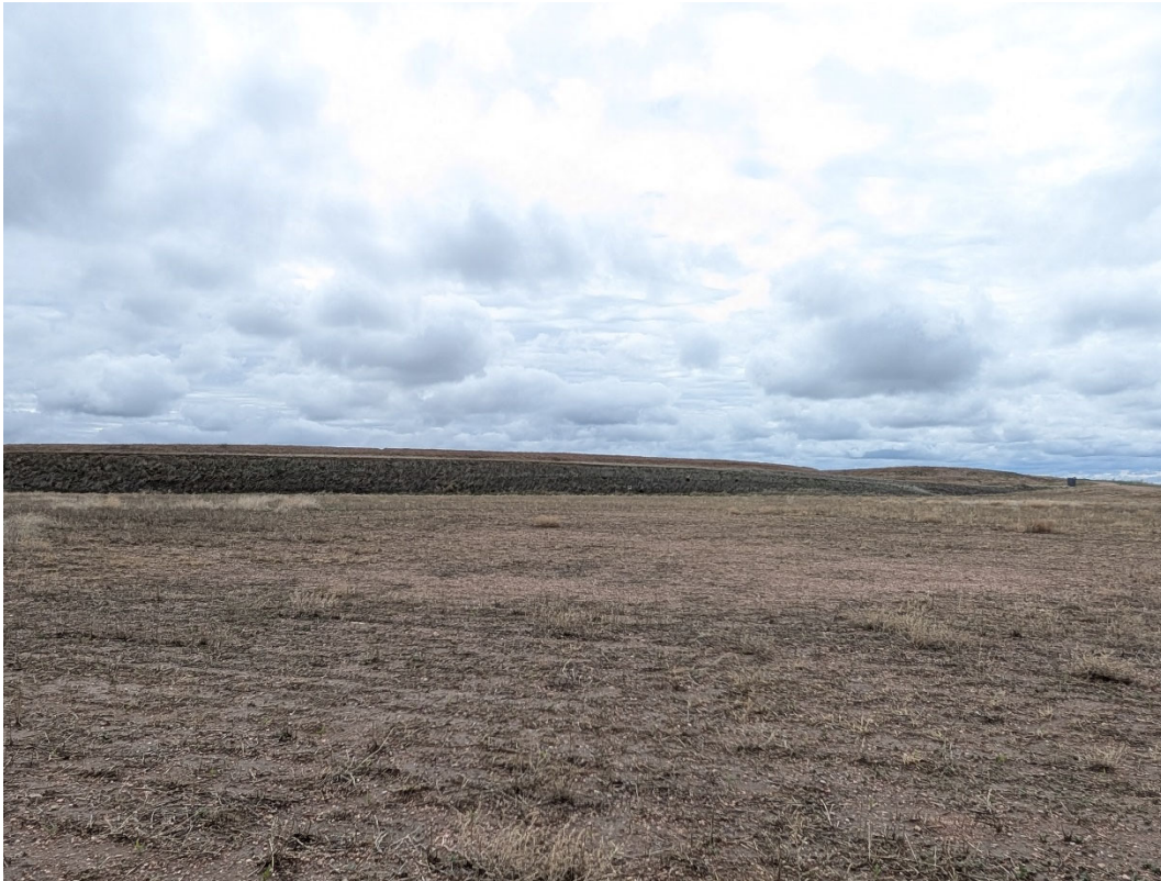
Photo 1: Looking southeast across the agricultural field in the release area.