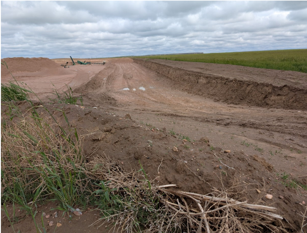
Photo 9: Looking north down the highwall which is located along the eastern permit boundary. Proposed amendment area is the field on the left.