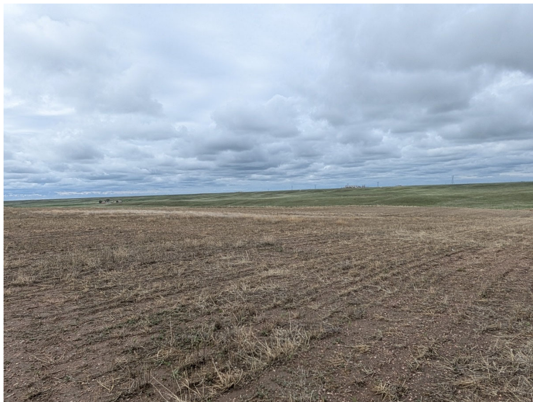
Photo 2: Looking west at the slope across the agricultural field in the release area.