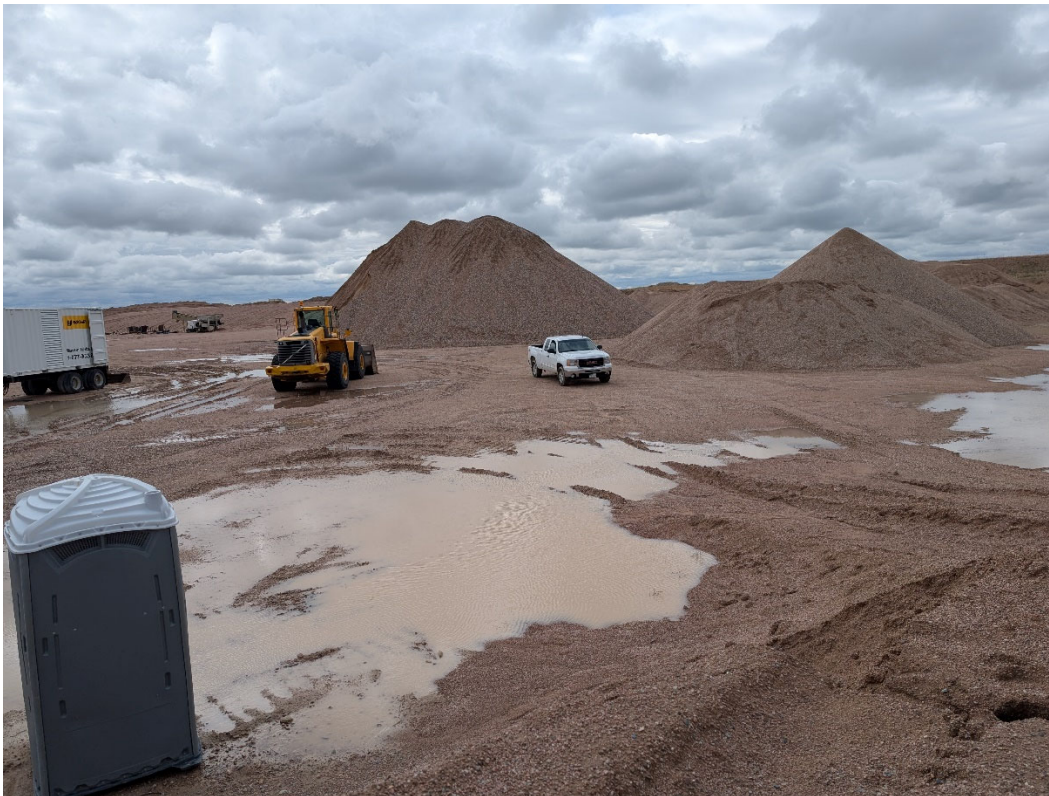
Photo 8: Stockpiles in the active mining area. Small amount of stormwater observed due to recent rains.