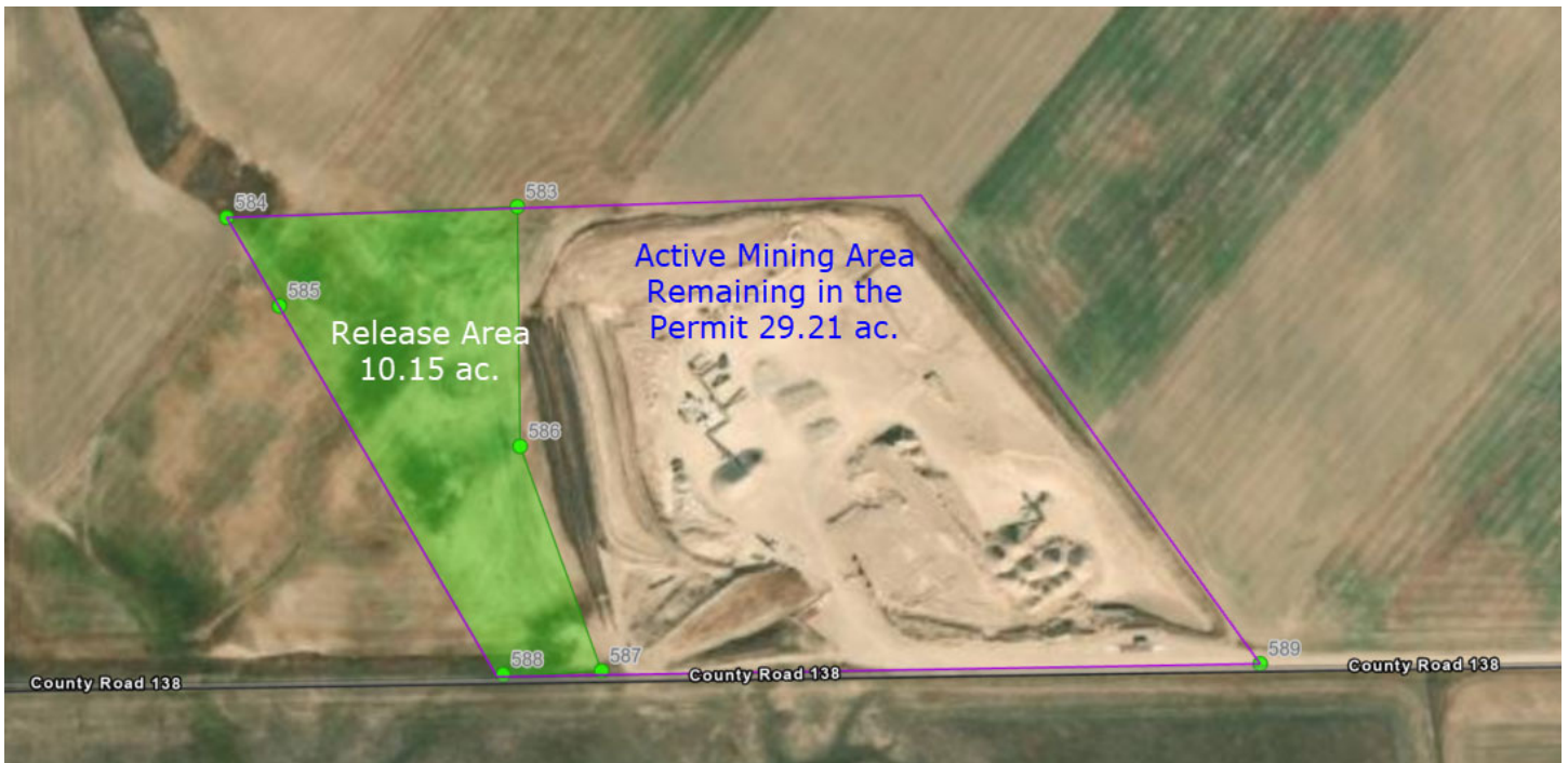
Figure 1: Google Image of release area shown in green. Remaining permit boundary outlined in purple.