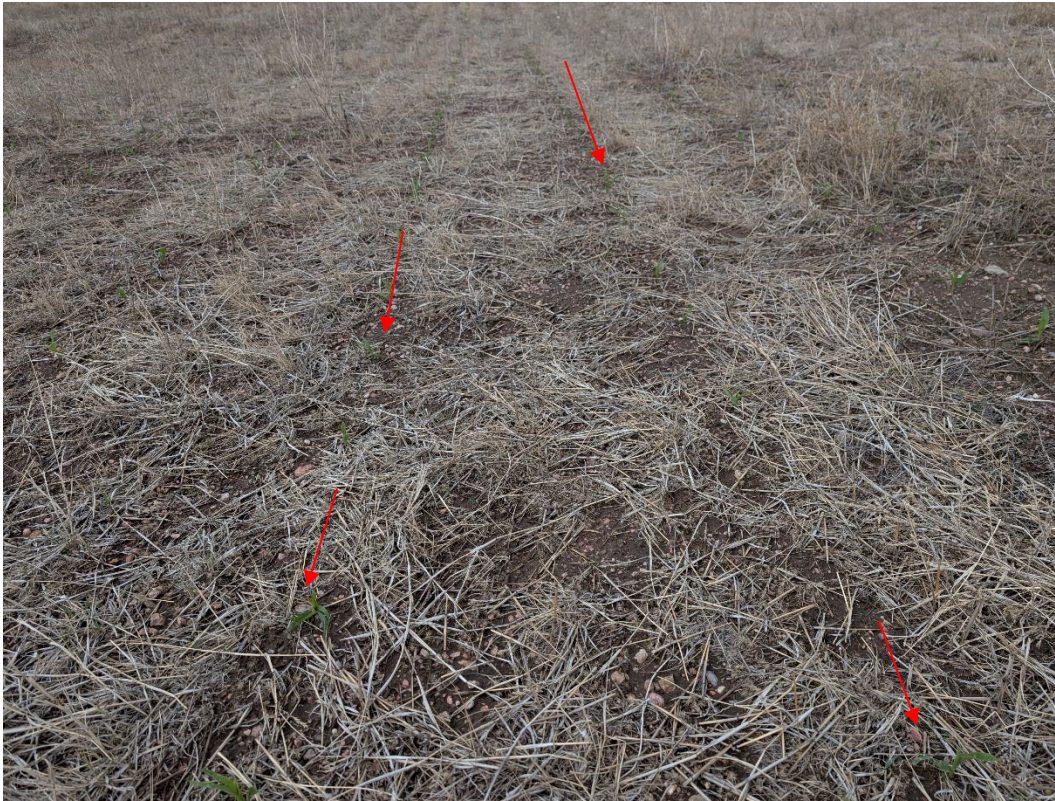
Photo 3: Close up of the crop planting. Wheat stalks from the previous year and rows of corn planted this season are noted by red arrows.