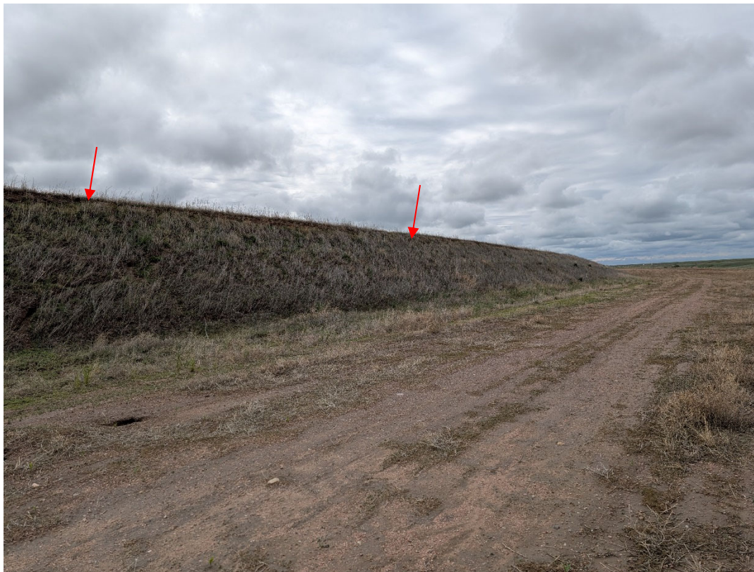
Photo 6: Access road around the west side of the active mining area will remain in the permit area. Topsoil berm placed along the west side of the active mining area. (red arrows)