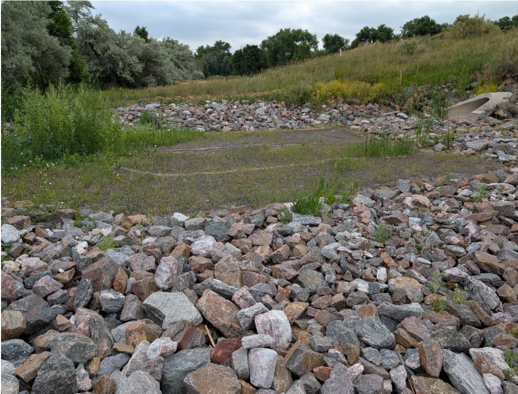
Photo 3: Looking at outlet and swale feature was installed on the north end of the permit area to handle stormwater runoff to the adjacent Bull Seep.