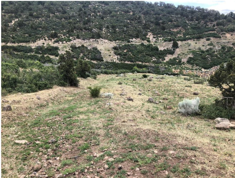
West Mine road

Number of Partial Inspection this Fiscal Year: 8