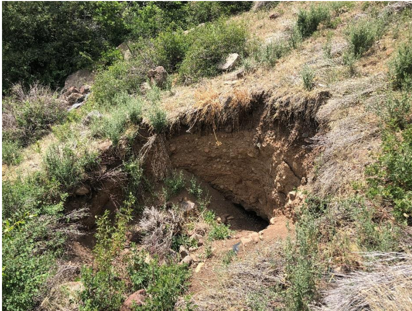
West Mine – sinkhole below lower pond

Number of Partial Inspection this Fiscal Year: 8