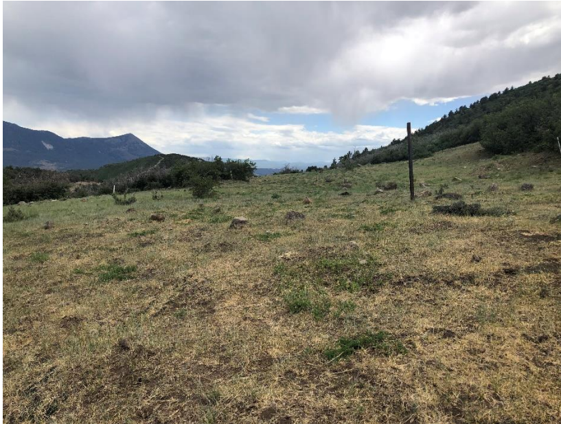
West Mine Fan (reclaimed pad)