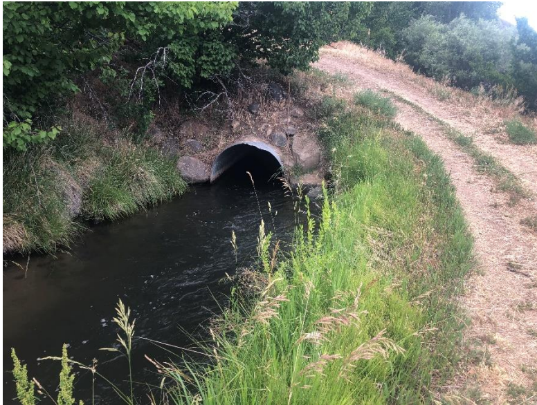
Culvert for Farmers Ditch at Loadout (lower end)

Number of Partial Inspection this Fiscal Year: 8