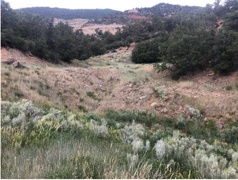
East Mine – reclaimed Pond 4, looking upstream