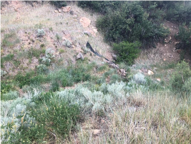
East Mine – reclaimed Pond 4, looking at lower end with old BMPs

Number of Partial Inspection this Fiscal Year: 8