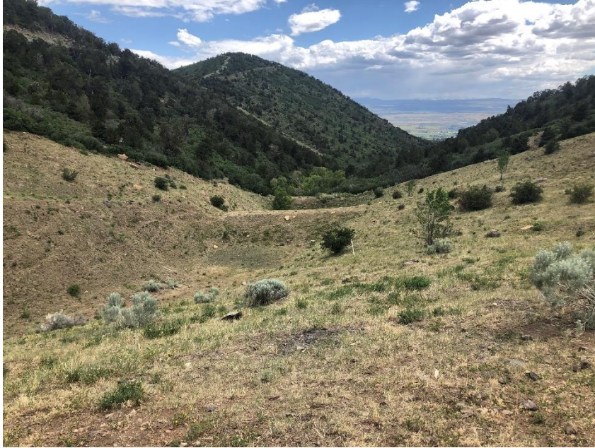
West Mine ponds