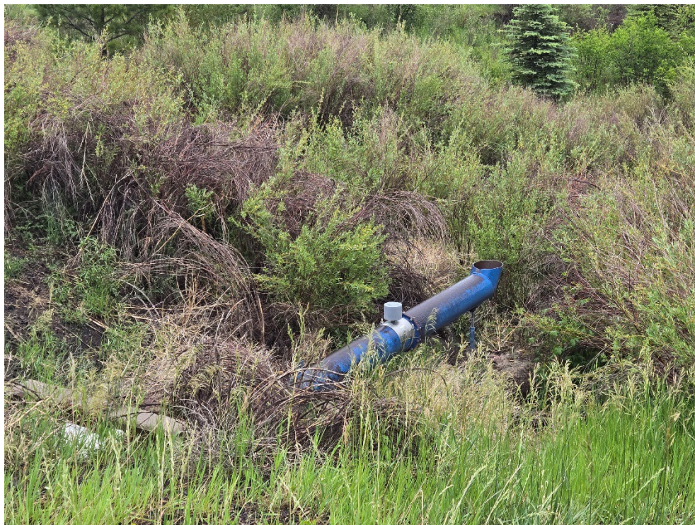
Photo 13: Principal spillway outlet for Pond 007a. Not discharging during the inspection.