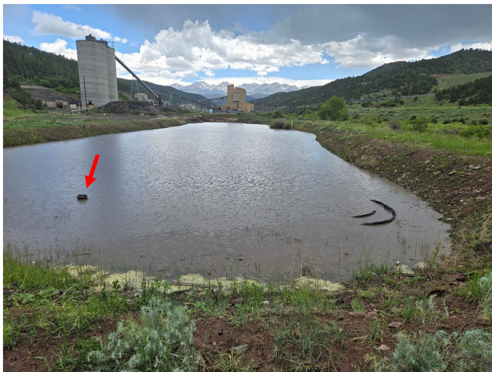
Photo 12: Pond 007A. The arrow points to the top of the principal spillway.

Number of Partial Inspection this Fiscal Year: 8