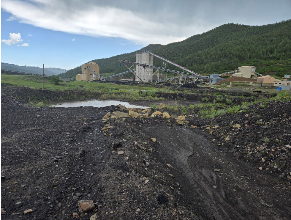
Photo 3: Looking east at the check dams on the north side of DWDA #2 leading to the sediment basin.