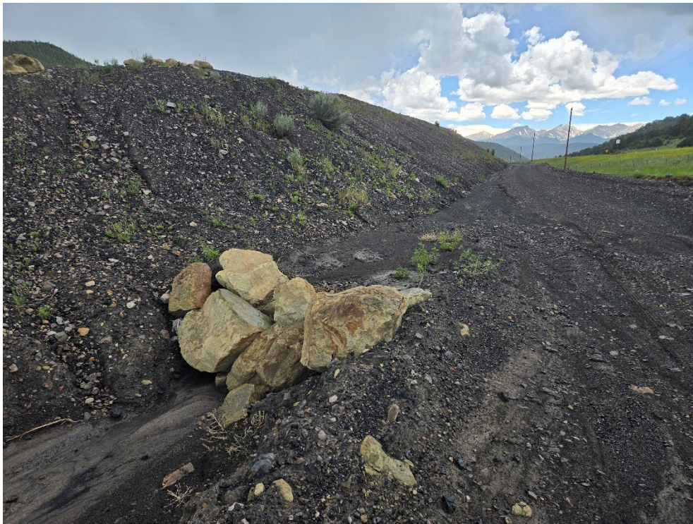
Photo 2: Looking west at the check dams on the north side of DWDA #2 leading to the sediment basin.

Number of Partial Inspection this Fiscal Year: 8