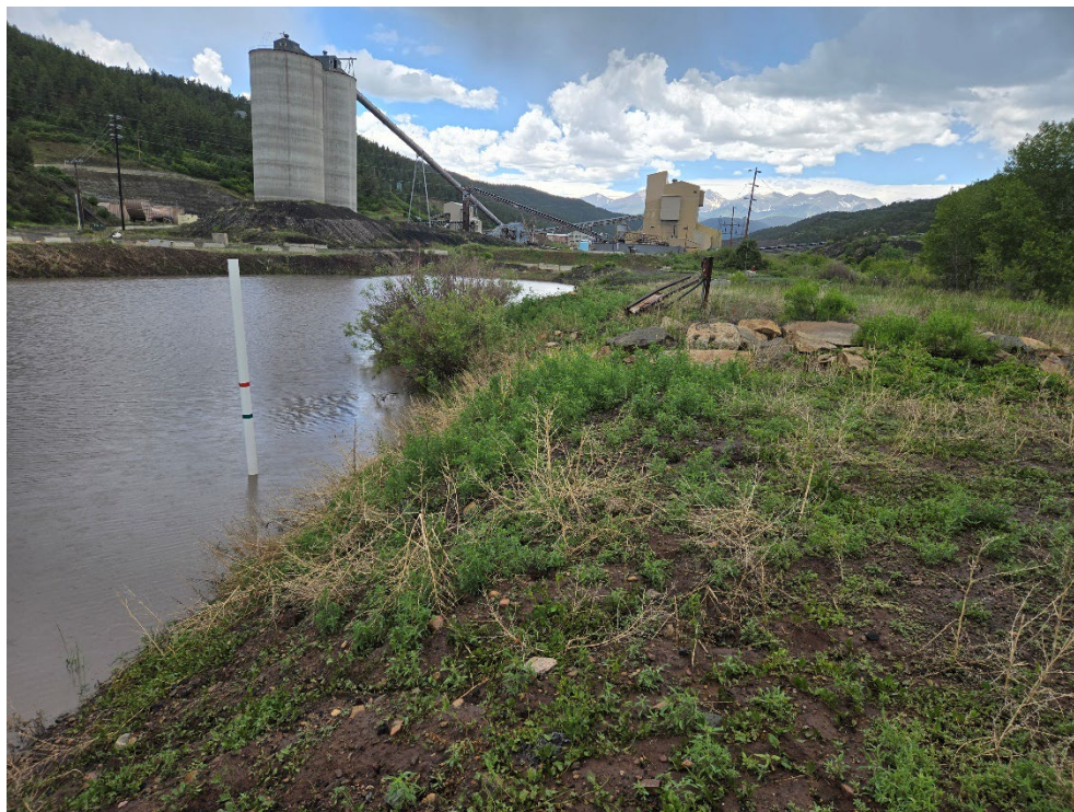
Photo 11: Water in Pond 007a compared to the capacity indicators on the white PVC pipe.