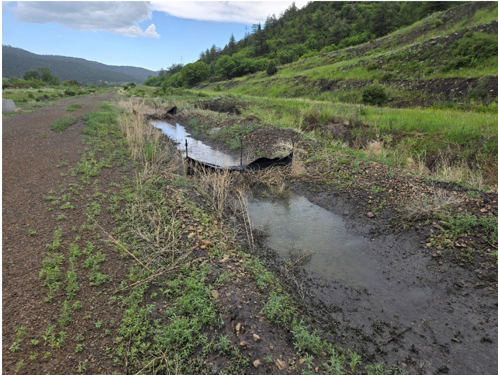
Photo 1: Silt fences within S.A.E, south of Pond 007a. The area experienced a lot of rainfall recently and it was raining at the time of the inspection.

During the September 2023 inspection, it was noted that the embankment slope on the northwest side of the Soil Storage Area was eroding and sluffing into the ditch that discharges to ditch D6. NECC was instructed to repair and stabilize the area. The ditch embankment separating the affected land drainage from the adjacent clear water ditch (D7) is very thin in areas. Failure of this embankment may overwhelm the ditch and cause sediment to discharge into the clean water ditch D7 that discharges to the river. During the October 2023 inspection, the Operator stated that they had hydro-mulched the northwest side of the Soil Storage Area in an attempt to stabilize the slope. They also stated that they are unable to safely get equipment in the area to mechanically stabilize the slope and berm separating the treated water run-off from the clean water ditch. NECC had been monitoring this area. As of this December 2024 inspection, it appears that the hydro-mulching and seeding of the bench has failed, as no vegetation appears to have been established. The Operator shall determine how to re-stabilize this bench and do so as soon as possible.