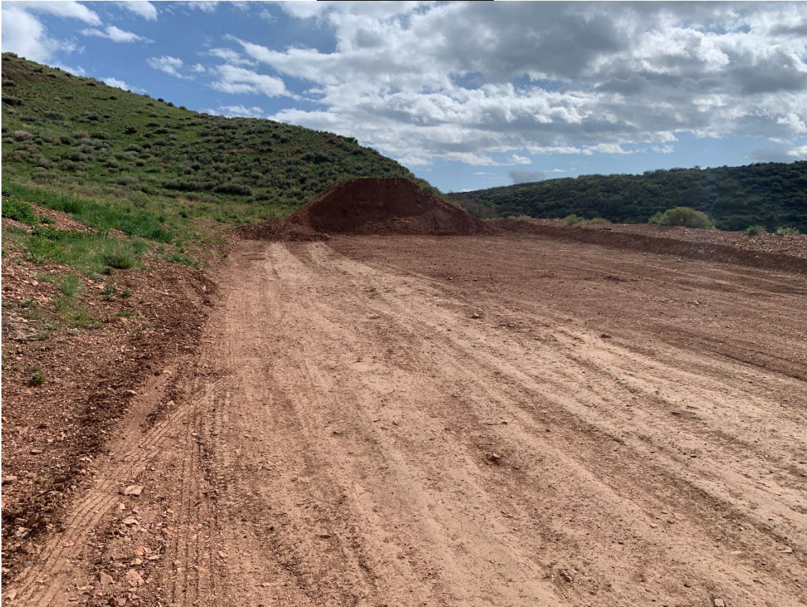
Photo 1 – Stockpile on north end of pit area. Photo facing north with CR 53 is on right side below the berm