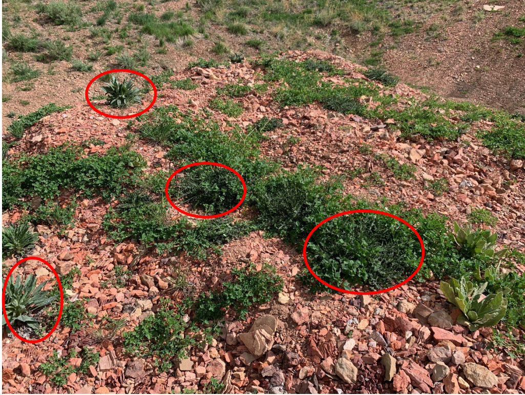
Photo 3- Houndstongue and thistle plants on stockpile.