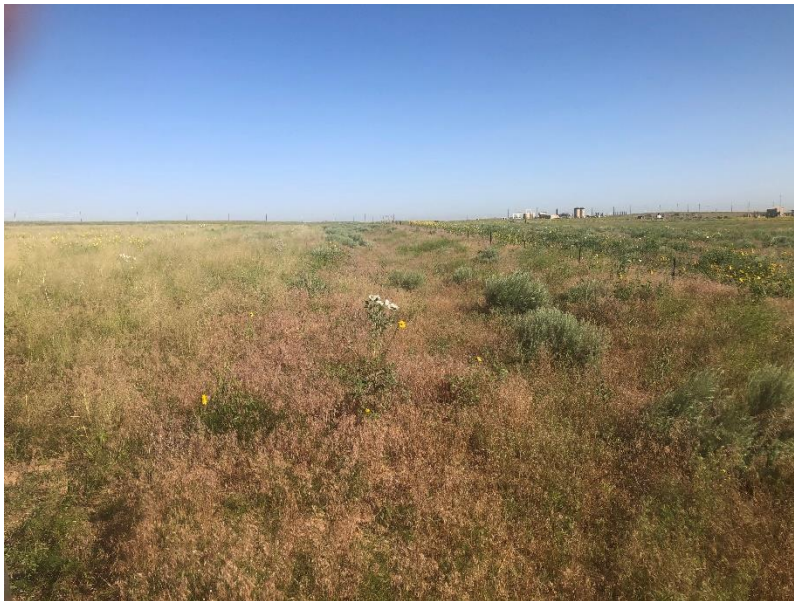
North boundary, looking northwest

Number of Partial Inspection this Fiscal Year: 8