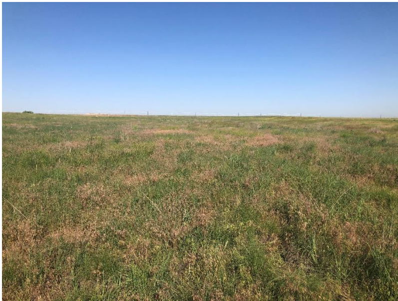
Excellent cover in Area 33

Number of Partial Inspection this Fiscal Year: 8