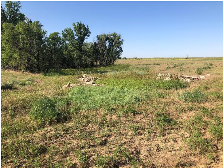
Spillway of the Dugout Pond

Number of Partial Inspection this Fiscal Year: 8