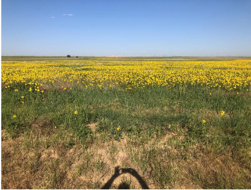
Sunflowers in Area 25