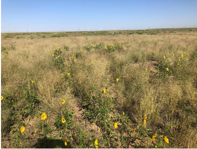
Sunflowers and Indian ricegrass in Area 37