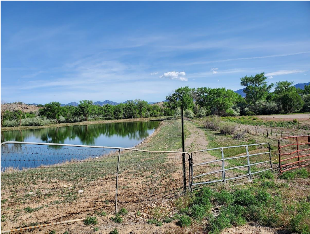
Photo 1: View to the north of partially reclaimed pond in Scott Pit portion of permit area.