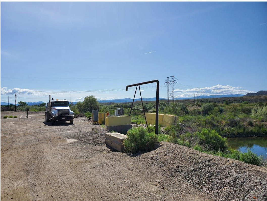
Photo 4: View to the east of water truck at entrance to permit area.