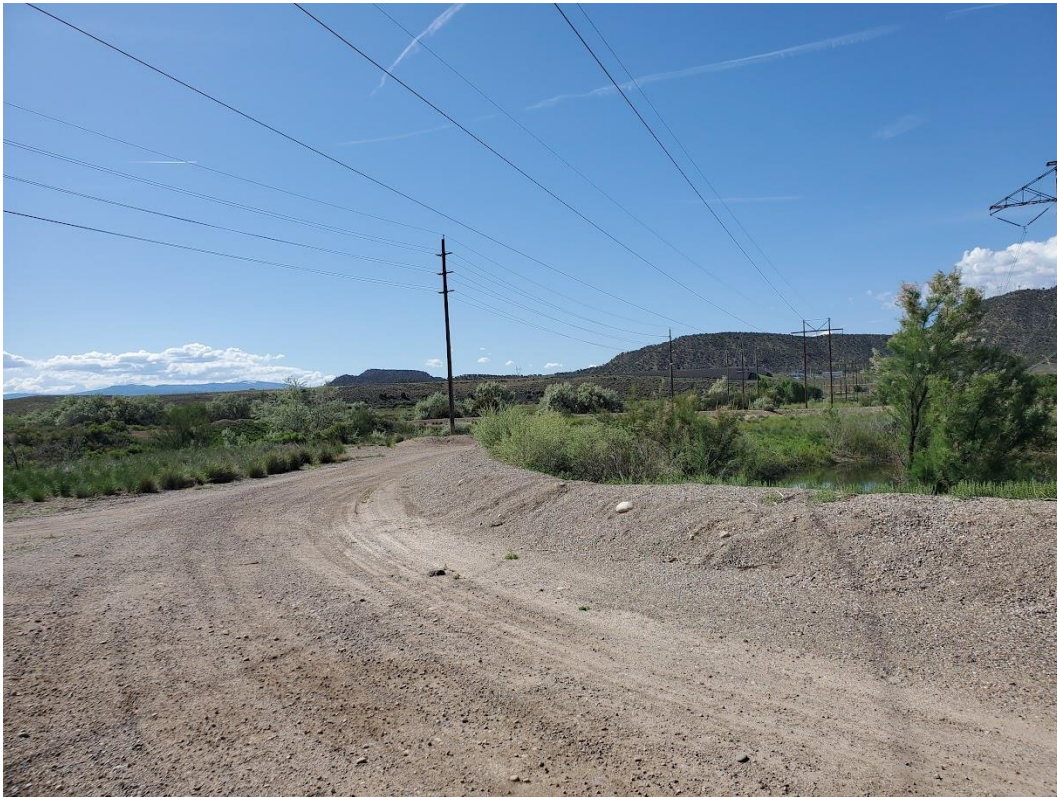
Photo 3: View to the south of power lines transversing permit area.