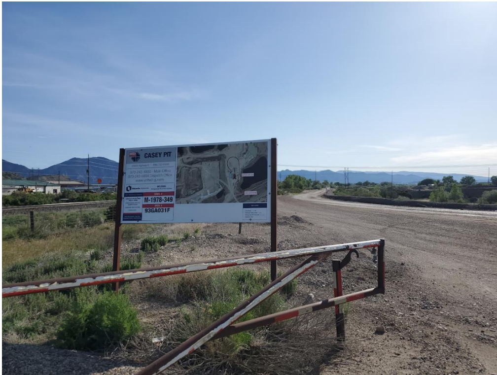
Photo 1: View to the east of proper mine ID signage at entrance to the site. Boundary fence can be seen in the background.