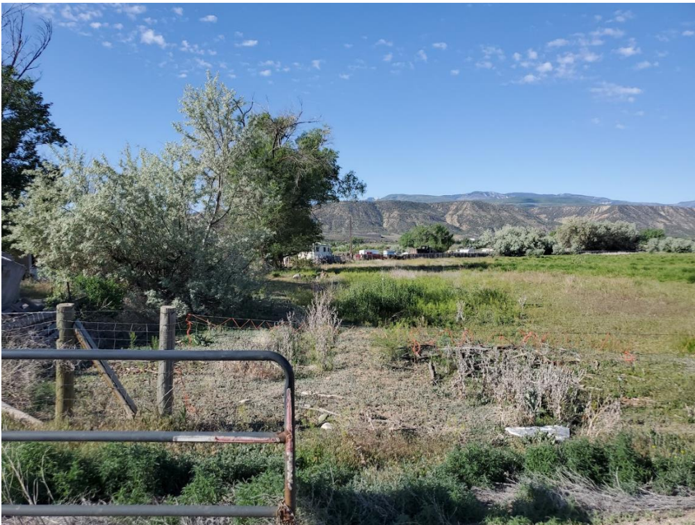
Photo 1: View to the east of proper mine ID signage at entrance to the site. Boundary fence can be seen in the background.