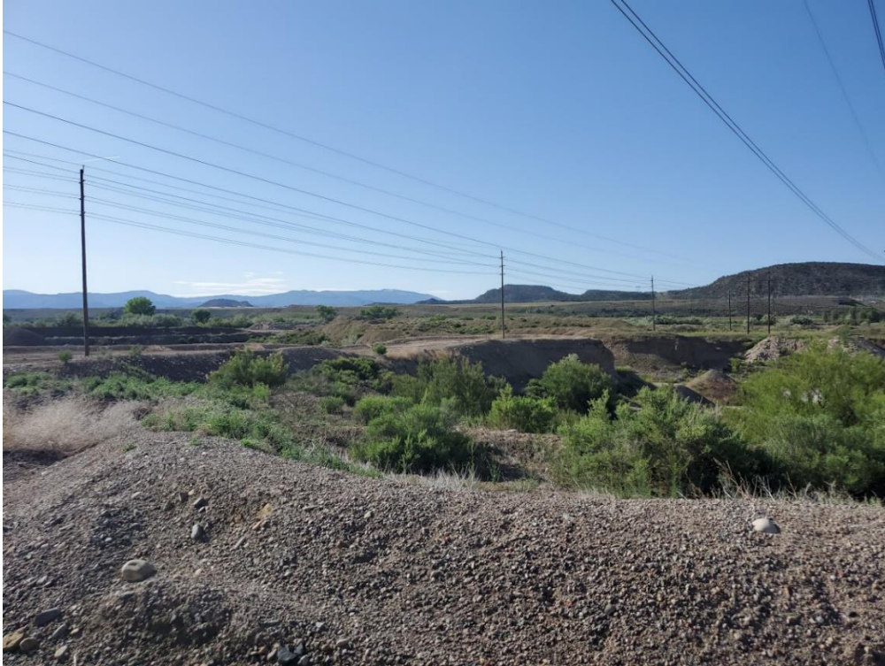
Photo 1: View to the east of proper mine ID signage at entrance to the site. Boundary fence can be seen in the background.