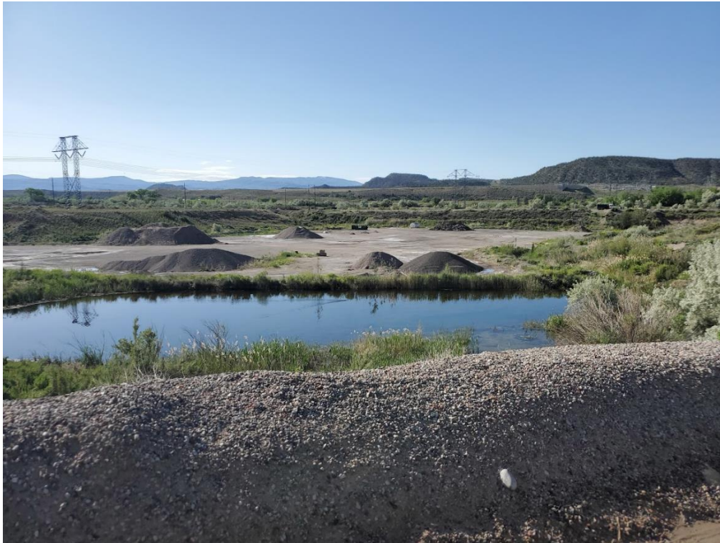
Photo 1: View to the east of proper mine ID signage at entrance to the site. Boundary fence can be seen in the background.