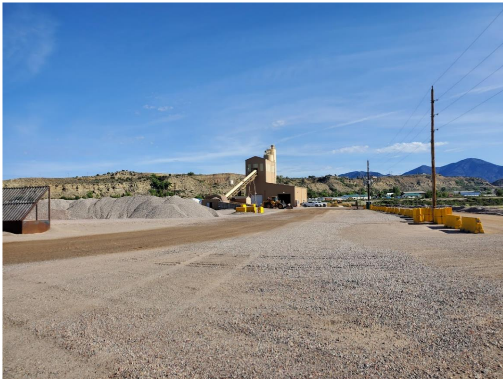
Photo 1: View to the east of proper mine ID signage at entrance to the site. Boundary fence can be seen in the background.