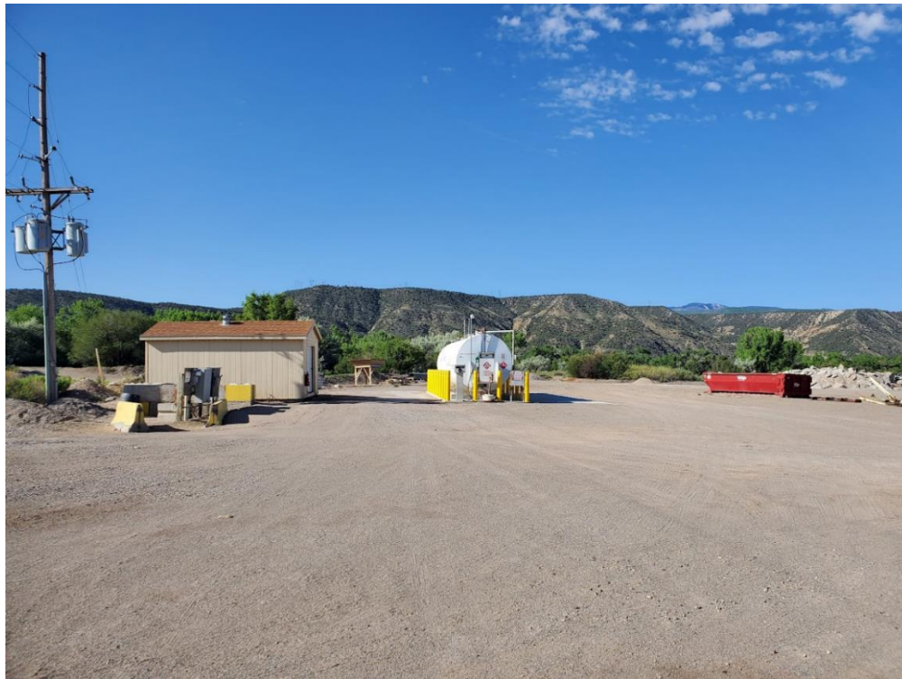
Photo 1: View to the east of proper mine ID signage at entrance to the site. Boundary fence can be seen in the background.