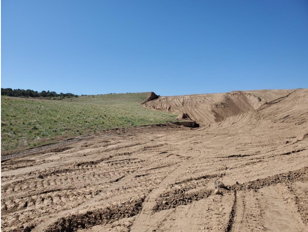
Photo 3 – View to the southwest of reclaimed area below well pad and highwalls near the area being graded.