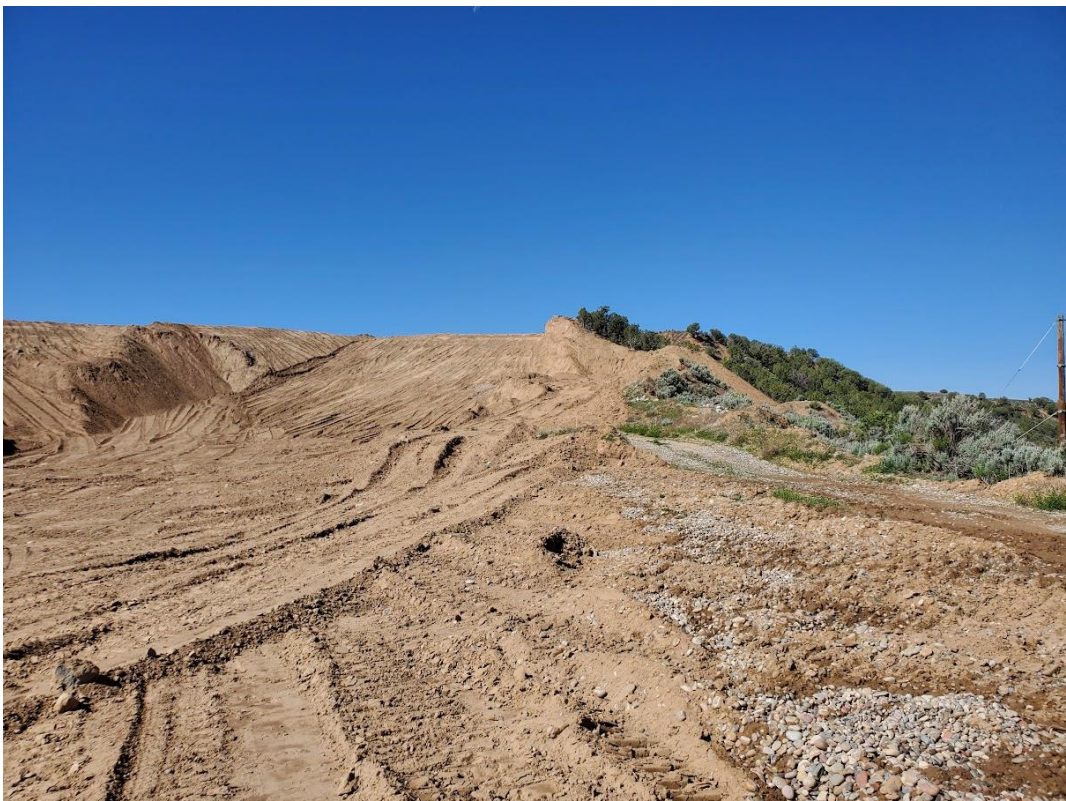
Photo 2 – View to the west of grading and highwall along the northern boundary.