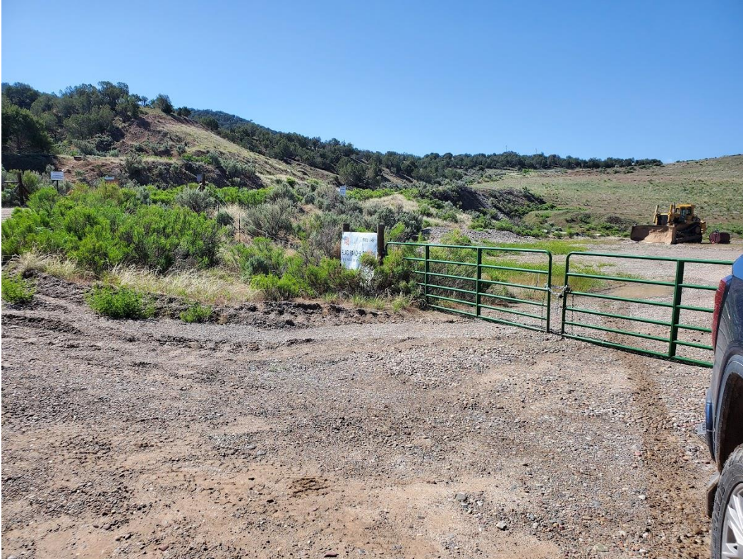
Photo 1 – View to the south of site entrance with proper mine ID sign.