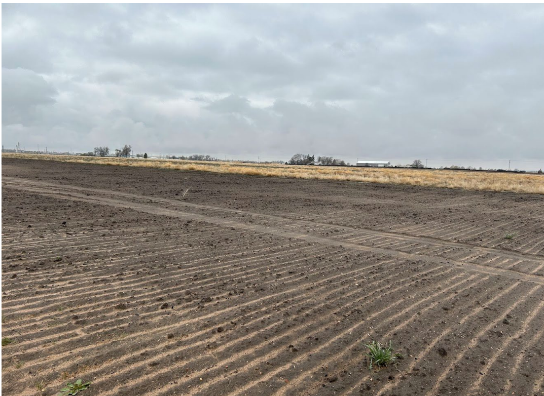
Photo 2: View of northeast quadrant of the permit area, facing northeast.