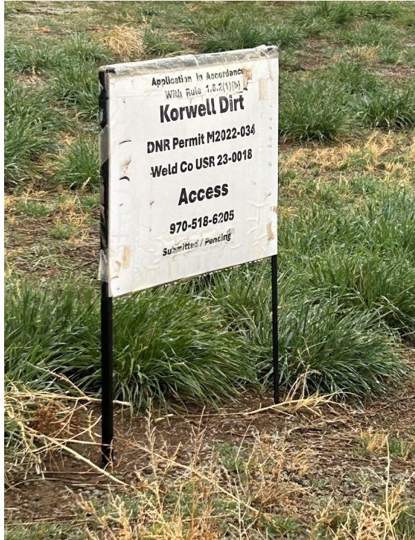
Photo 1: Mine Entrance Sign indicating DRMS-issued permit and permit number.