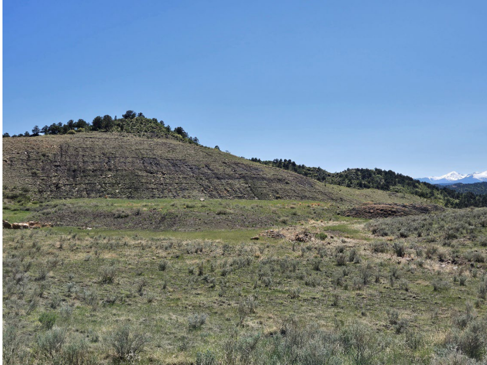
Photo 1: Erosion on the north-facing slope of the reclaimed area above the sediment drying area.