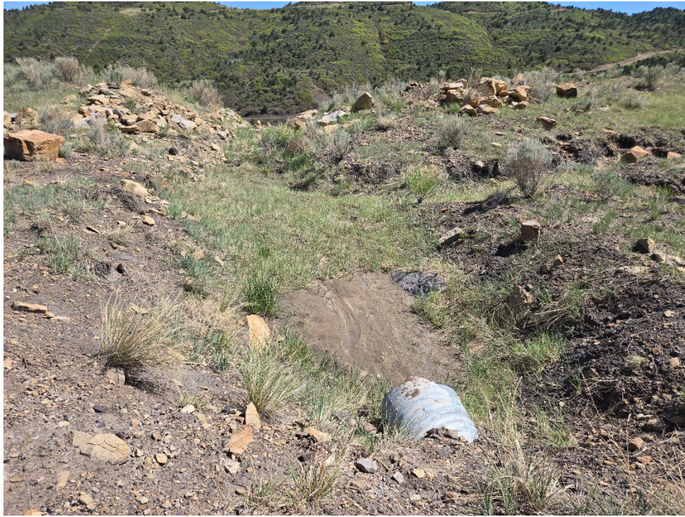
Photo 3: Looking at the outlet for culvert C4 on the southside of the road.