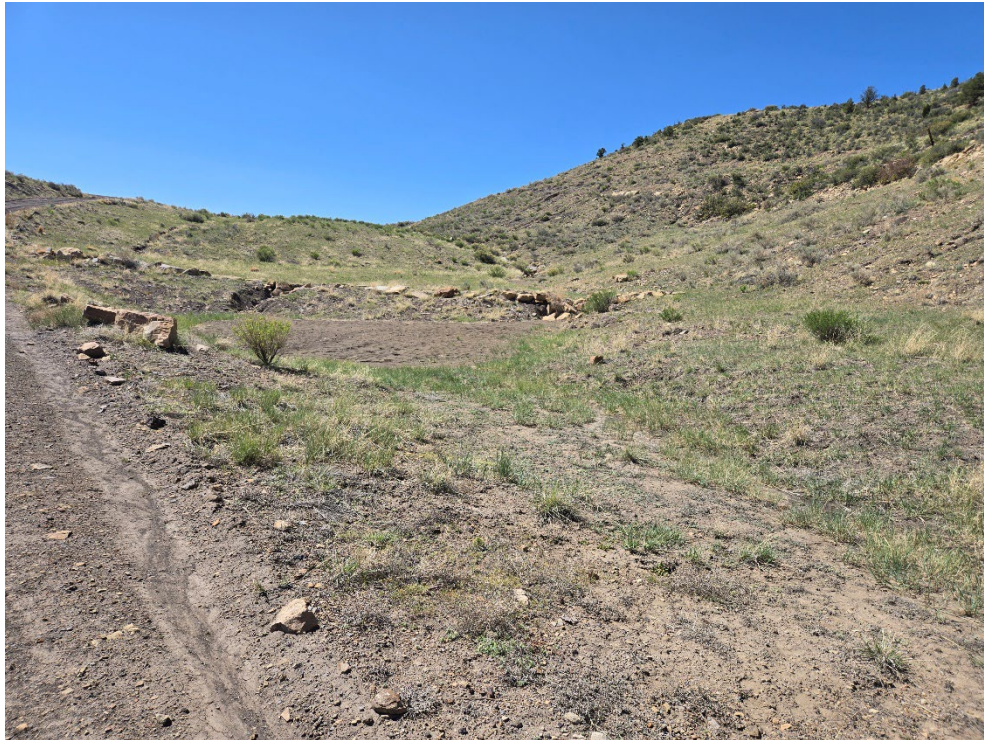
Photo 2: Looking northwest at the sediment catchment basin on the north side of the road, on the south side of “The Knob”.