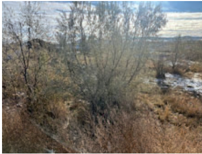
IMG_5699 (1).jpg 57K