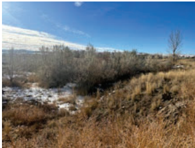
IMG_5700 (1).jpg 47K