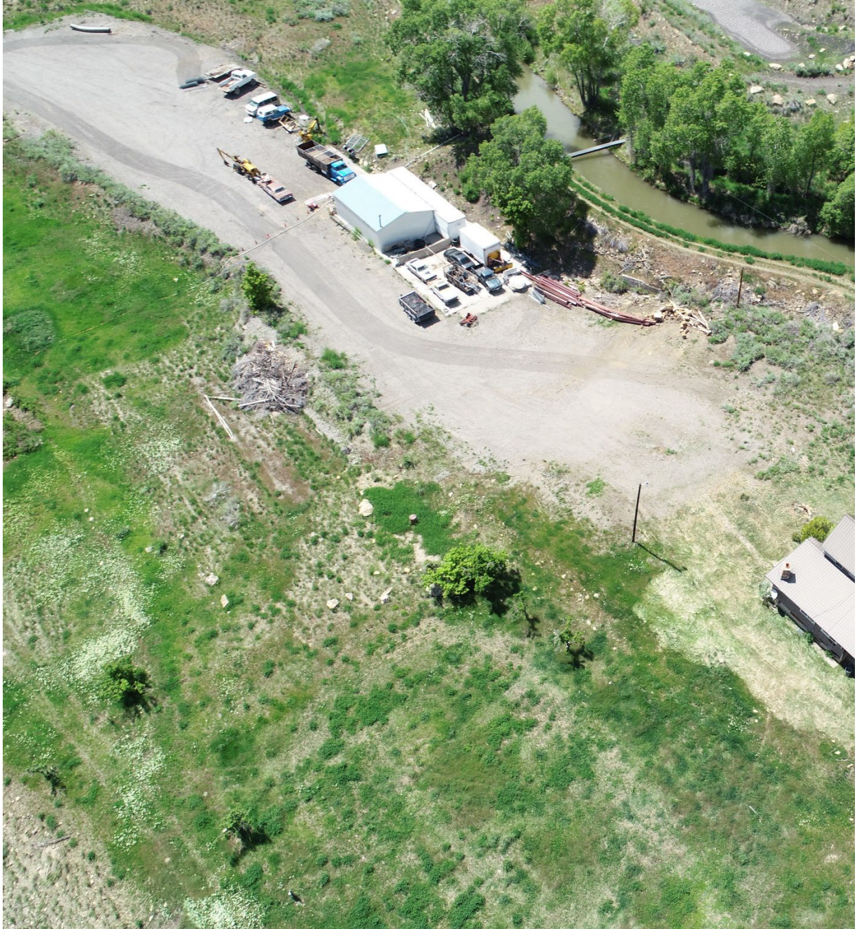
Figure 5: Upper pad

Number of Partial Inspection this Fiscal Year: 8