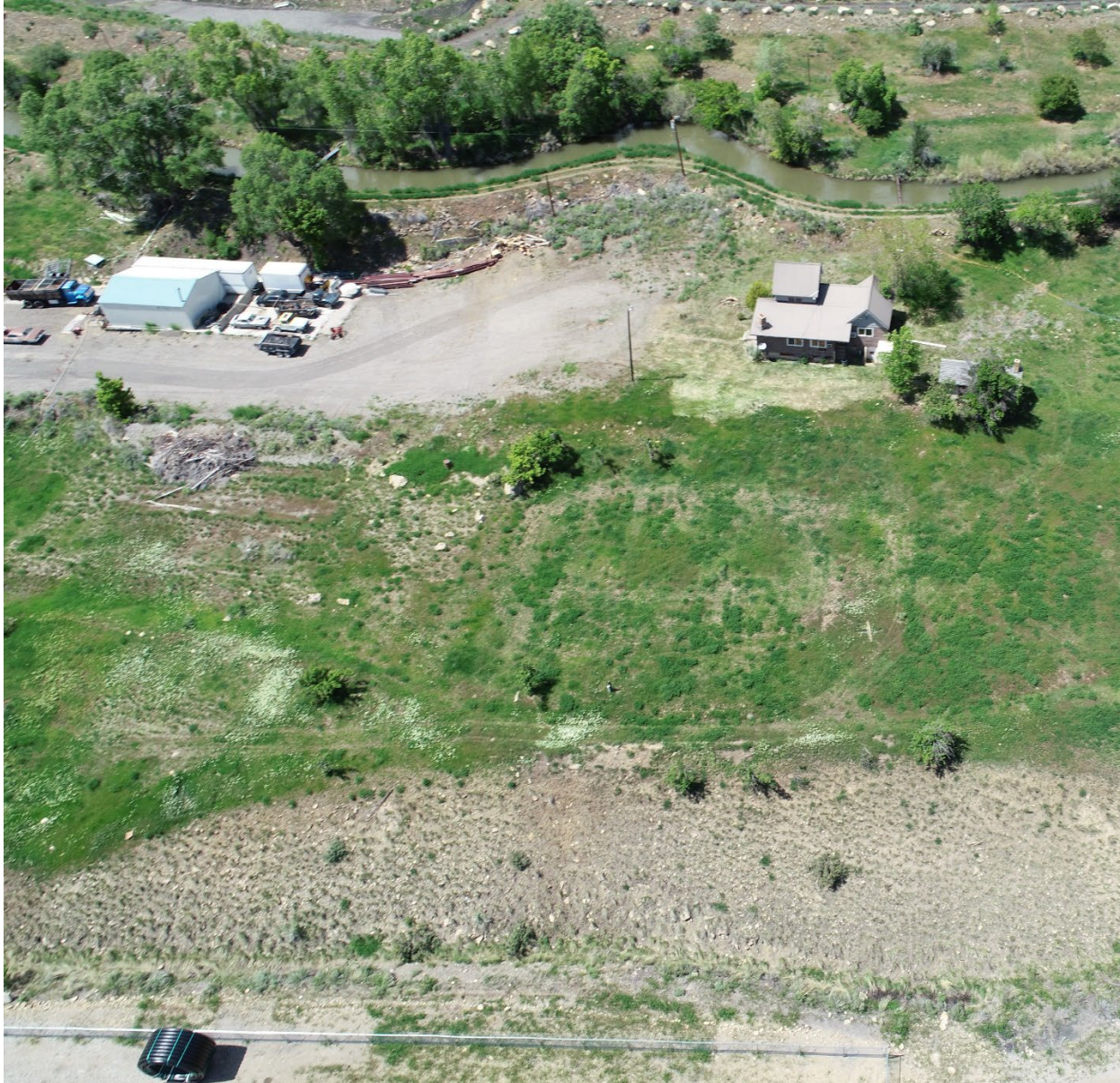
Figure 4: Office and east end of upper pad

Number of Partial Inspection this Fiscal Year: 8