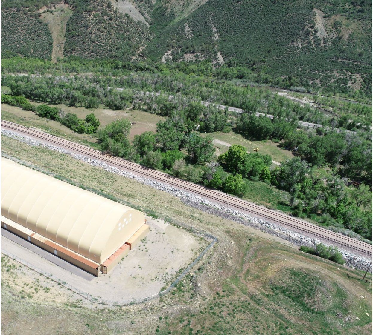
Figure 2: West end of lower pad, and topsoil stockpile

Number of Partial Inspection this Fiscal Year: 8