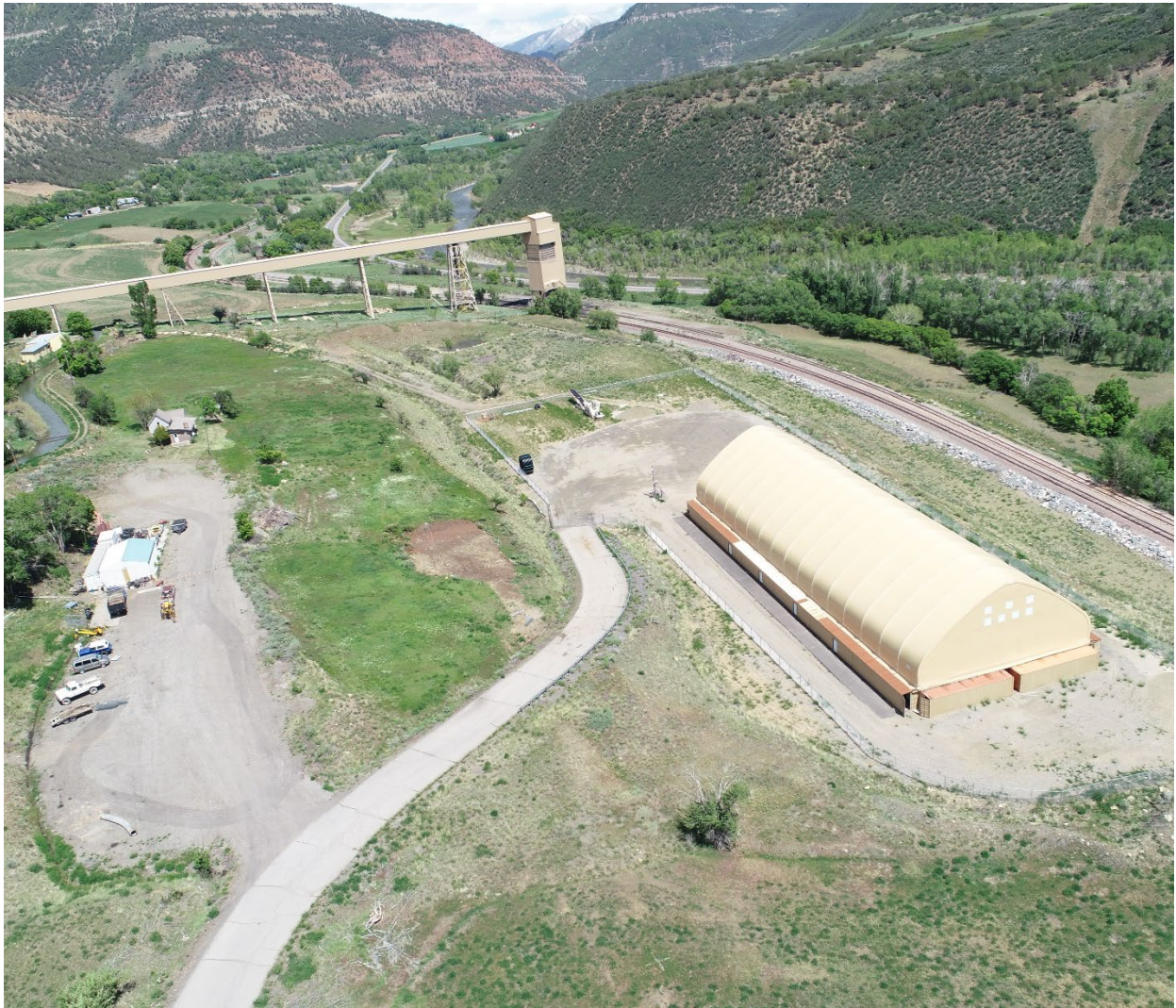
Figure 1: Overview of site

Number of Partial Inspection this Fiscal Year: 8