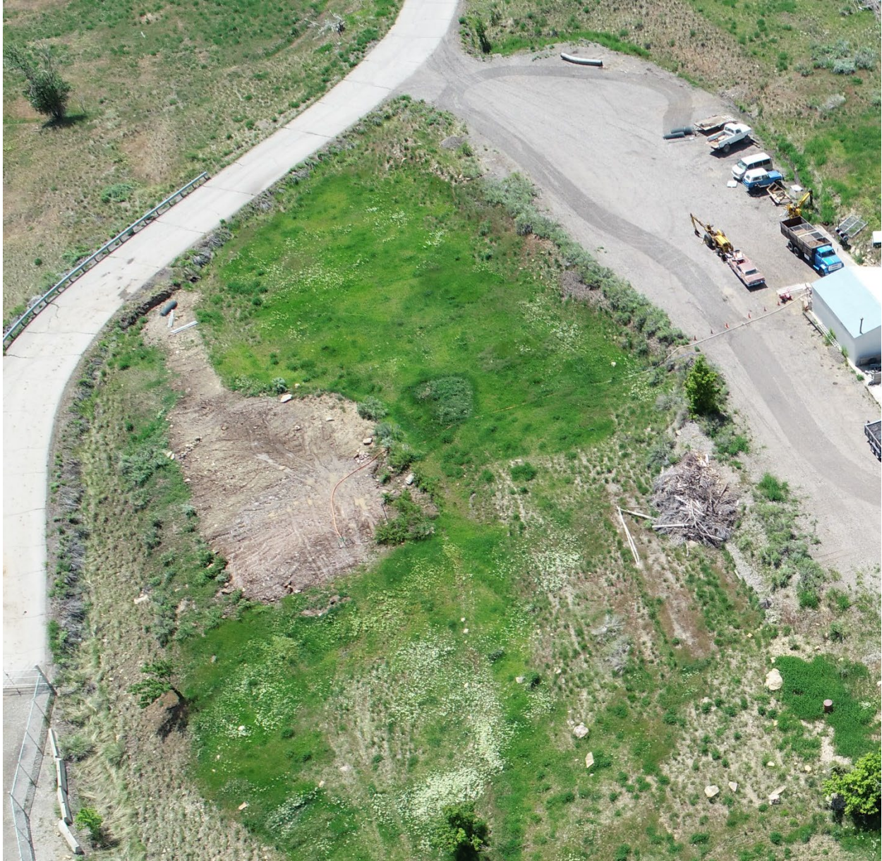
Figure 6: Reclaimed substation

Number of Partial Inspection this Fiscal Year: 8