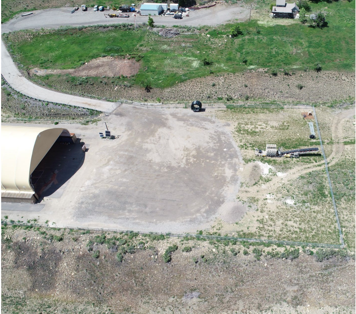
Figure 3: Railway embankment, east end of temporary building, security fence and gate

Number of Partial Inspection this Fiscal Year: 8