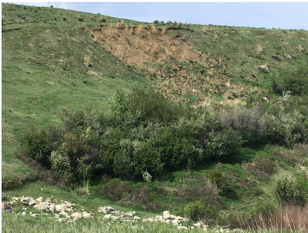
Photo 1: Pond 6 slump of 2023 at the right in the photo and slope fissures.