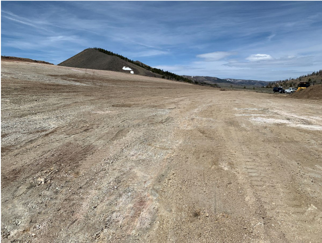
Photo 2- Pit area sloped to north with shallow swale directing runoff to lower left of photo. Photo facing the west.

Nate Davis Medicine Bow - Routt National Forest USDA Forest Service 210 S. 6th St. Kremmling, CO 80459