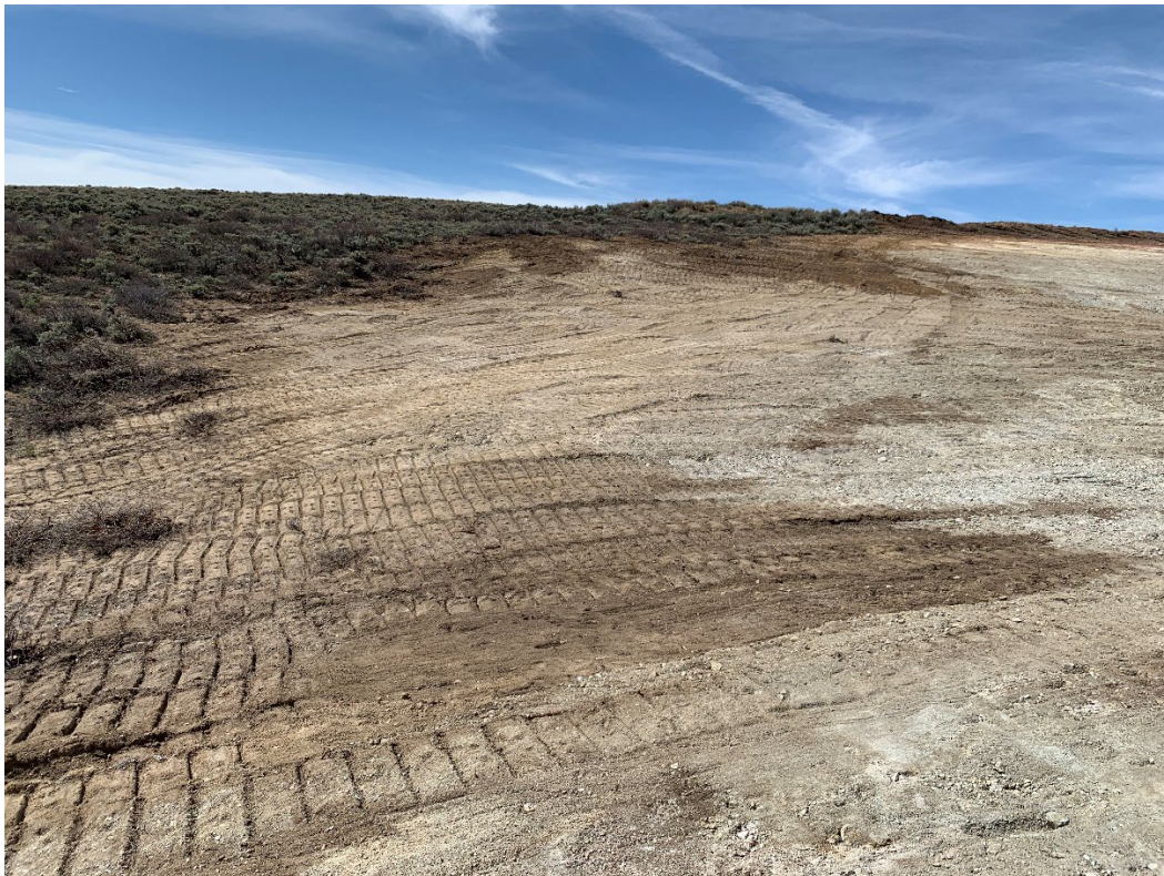
Photo 1- East end of backfilled highwall, facing south