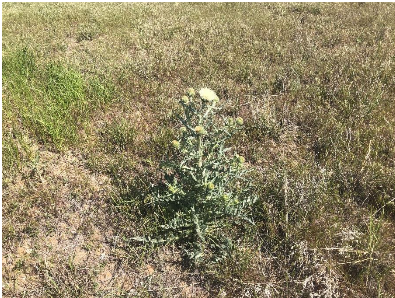
Thistle in Area 43 (appears to be native species)

Number of Partial Inspection this Fiscal Year: 7