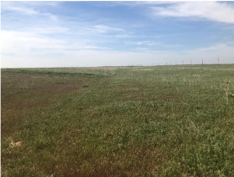
Western side of reclaimed B Pit, looking south, with undisturbed area on the right

Number of Partial Inspection this Fiscal Year: 7