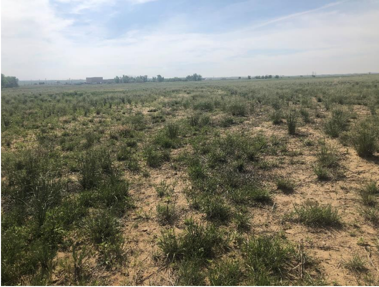
Bare area in eastern portion of reclaimed Long Term Spoil Area