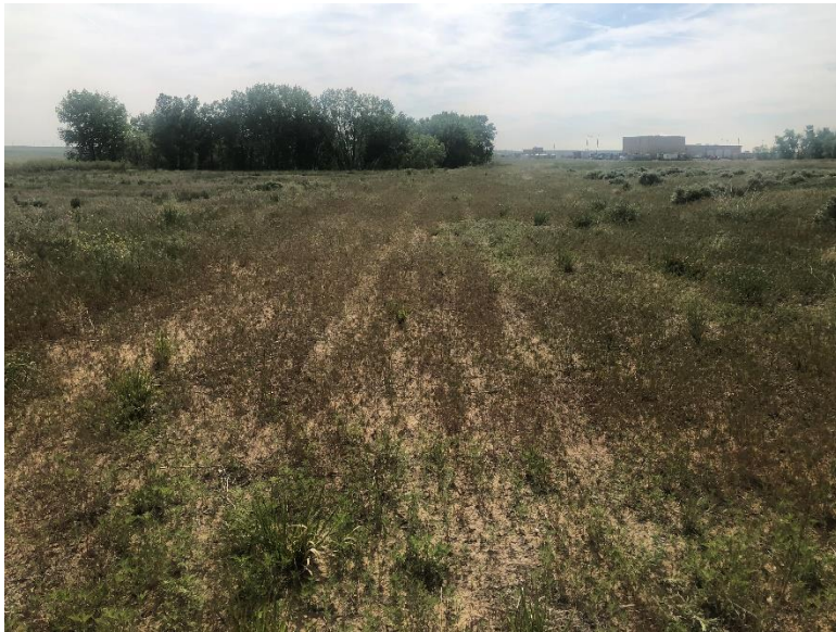
Cheat grass within reclaimed road area, west of Sediment Pond 2