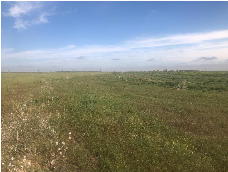
North side of site, looking northwest at fence line

Number of Partial Inspection this Fiscal Year: 7