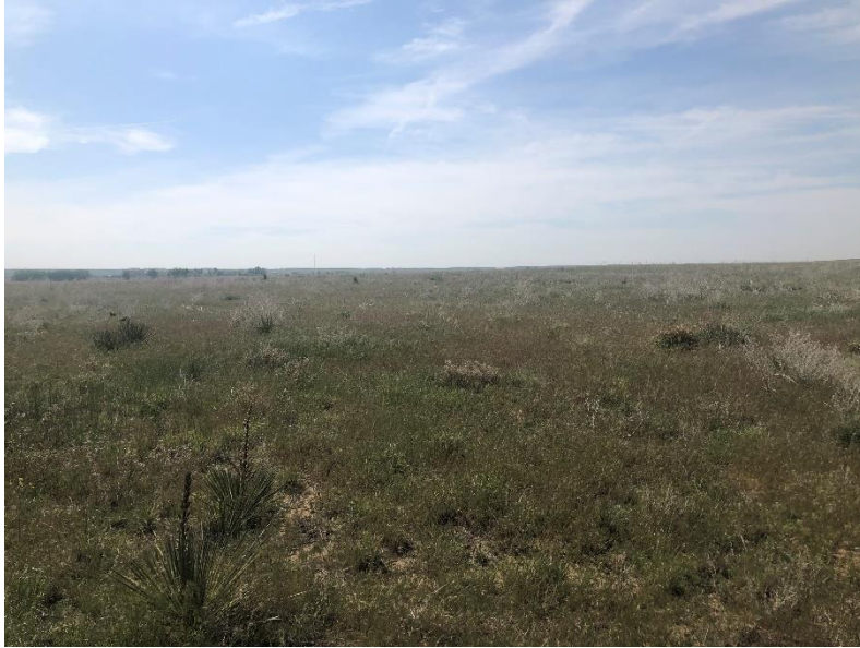
Area 43, looking southeast (note yucca and cheat grass)