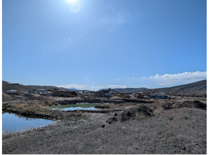
Wash ponds and crushing area