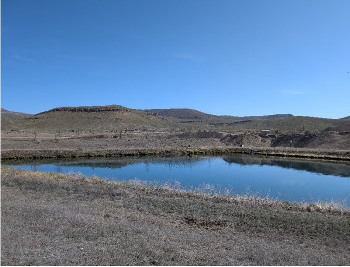
Wash pond near crusher