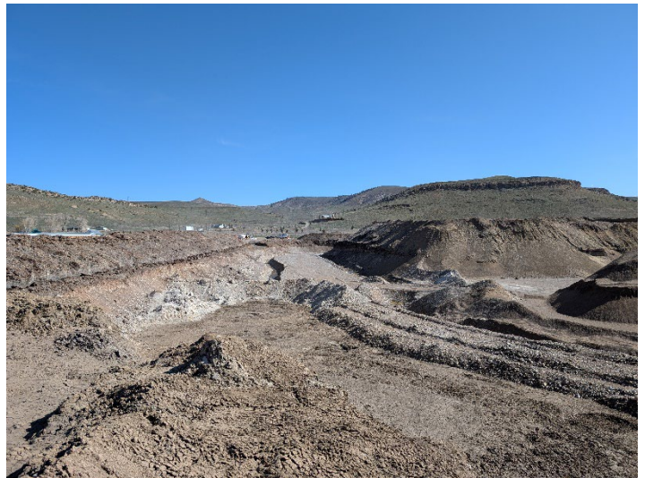
Pit viewed from southwest end