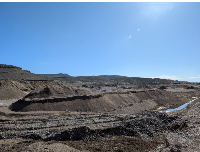
Pit viewed from southwest end