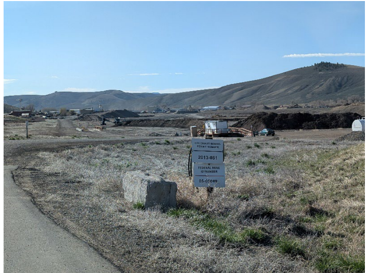
Sign at entrance