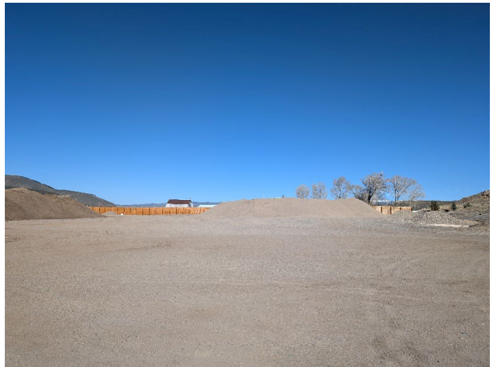
Stockpile area near scalehouse