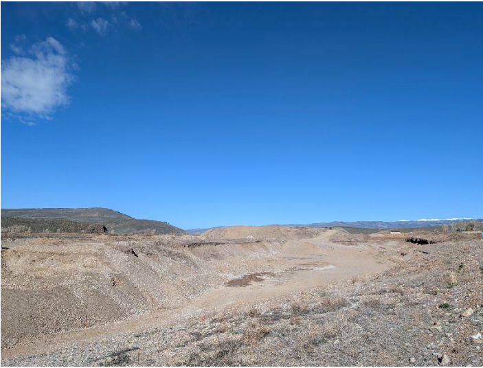
Pit viewed from northeast end