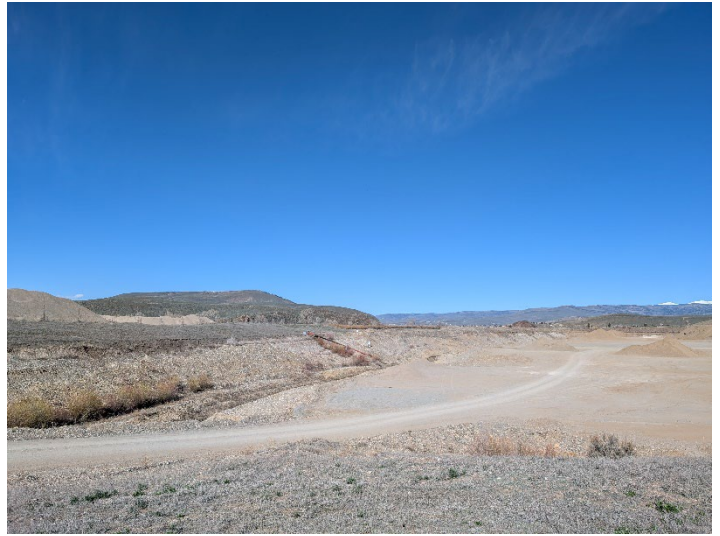
Pit viewed from east side