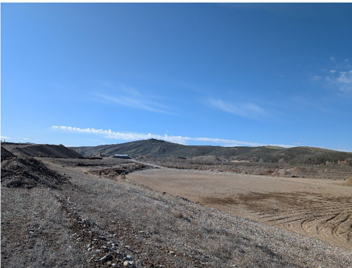
Pit viewed from northeast end