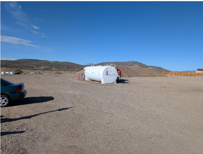
Fuel storage near scalehouse