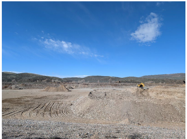
Pit viewed from northeast end