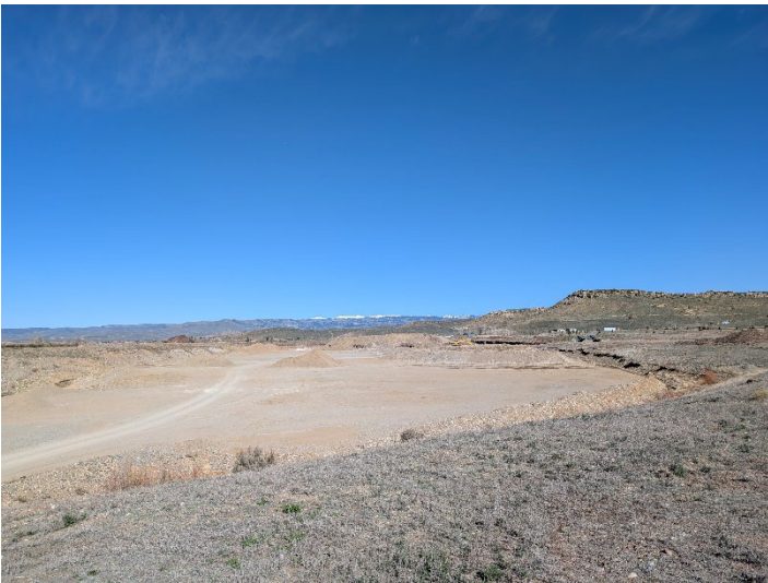
Pit viewed from east side