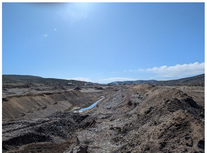
Pit viewed from southwest end