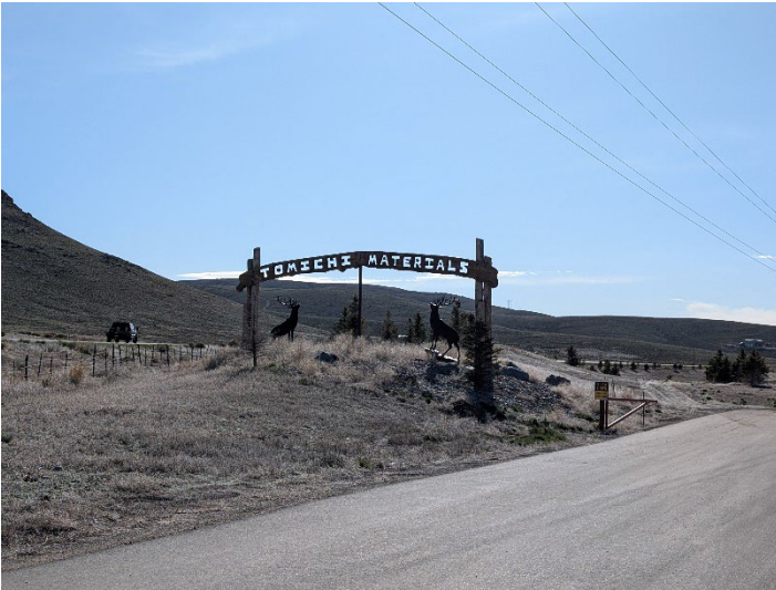
Sign at entrance