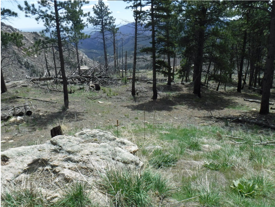
Photo 1: Looking down on a possible location of one of the drilling pads