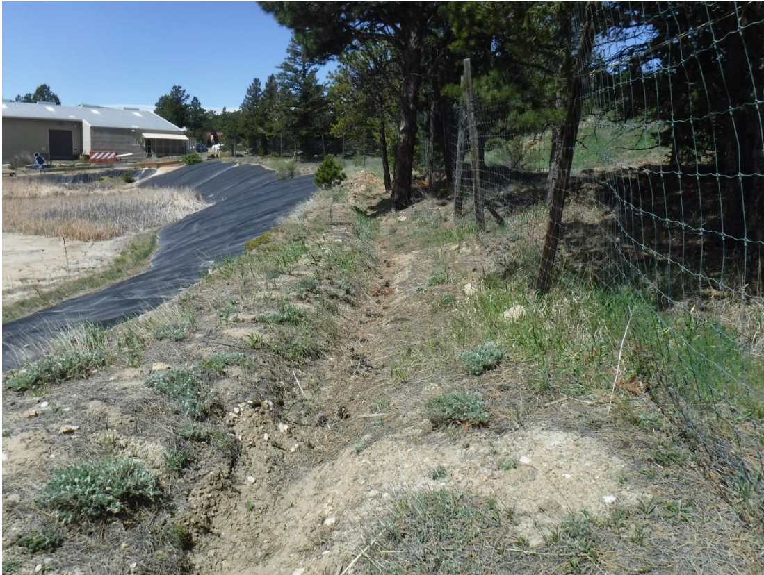
Photo 9: Run on/off control ditch along northern boundary of the TSF