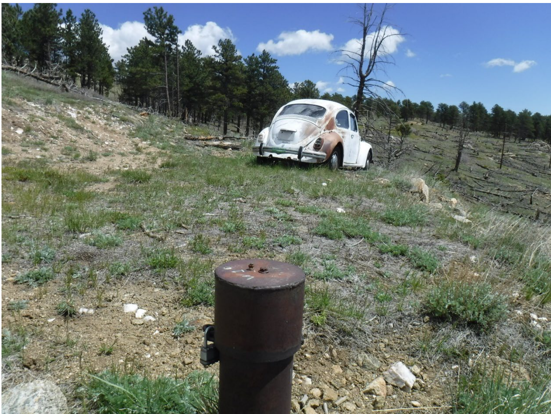
Photo 12: Monitoring Well W-1 west of W-2 located on the other side of Beetle