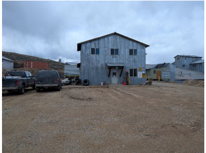
Office building near entrance