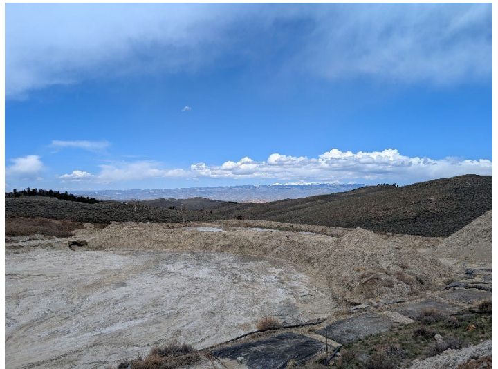
Tailings disposal area