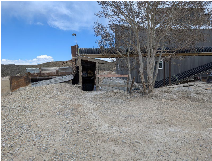
Crusher circuit on backside of mill building