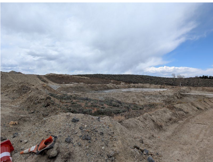
Tailings disposal area