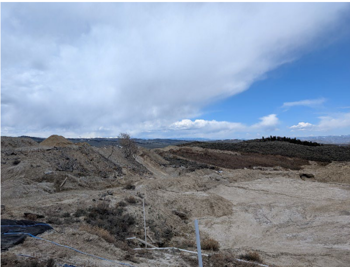
Tailings disposal area