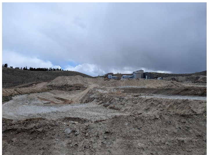
Tailings disposal area