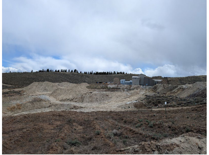
Tailings disposal area