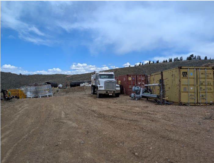
Equipment storage area