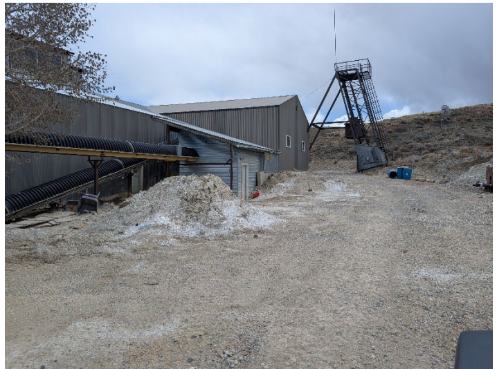
Crusher circuit on backside of mill building