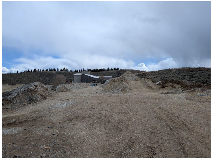
Tailings disposal area