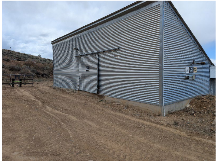
Fuel storage shed