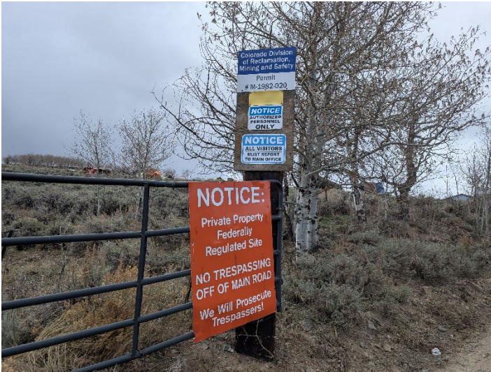
Sign at entrance