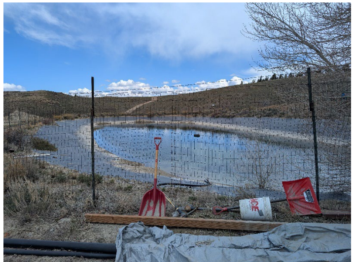
Lined recirculation pond