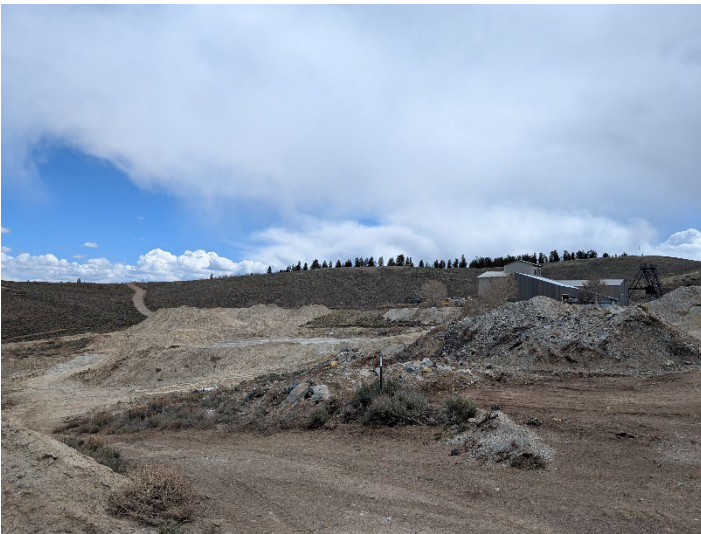
Tailings disposal area