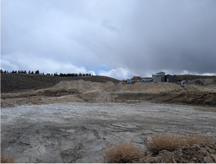
Tailings disposal area