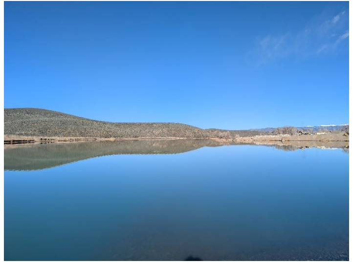
Pit lake viewed from east end