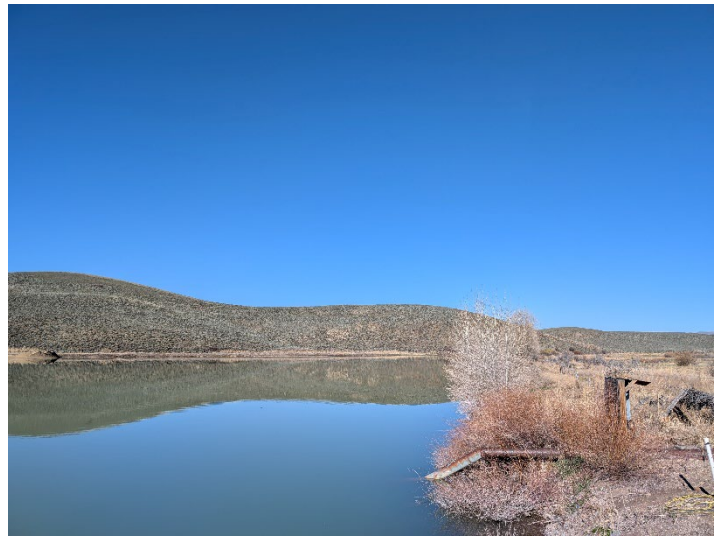
Pit lake viewed from north side