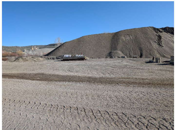
Crushing/stockpile area north of pit