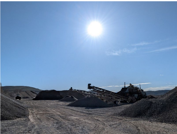
Crushing/stockpile area north of pit