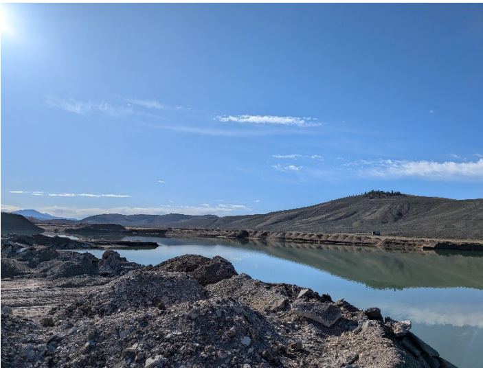
Pit lake viewed from north side