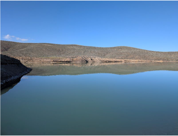
Pit lake viewed from east end