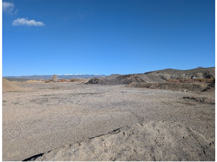
Stockpile area on south side of Tomichi Creek