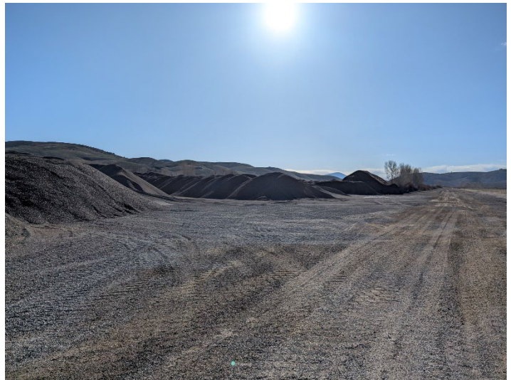
Stockpile area on south side of Tomichi Creek

Jason Burkey Oldcastle SW Group, Inc. dba United Companies of Mesa County 2273 River Road Grand Junction, CO 81502