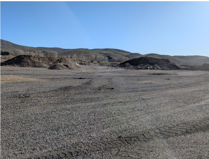
Stockpile area on south side of Tomichi Creek