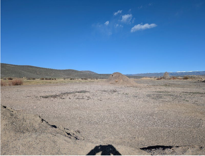
Stockpile area on south side of Tomichi Creek