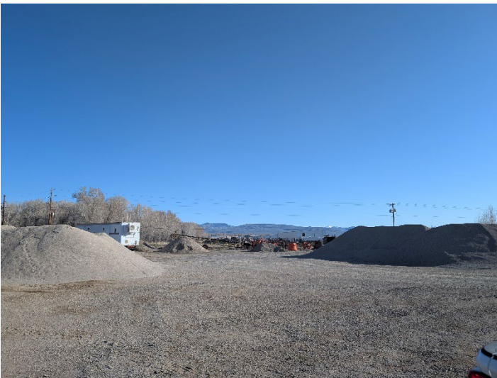
Stockpile/storage area northwest part of permit area