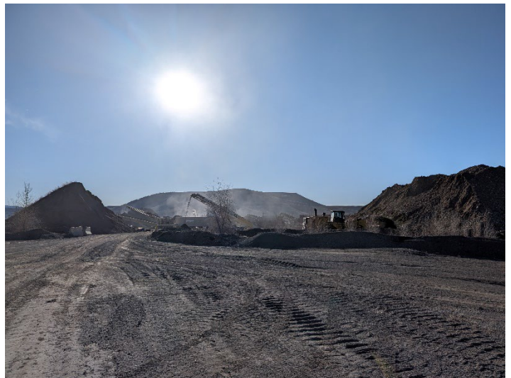
Processing area north part of permit area