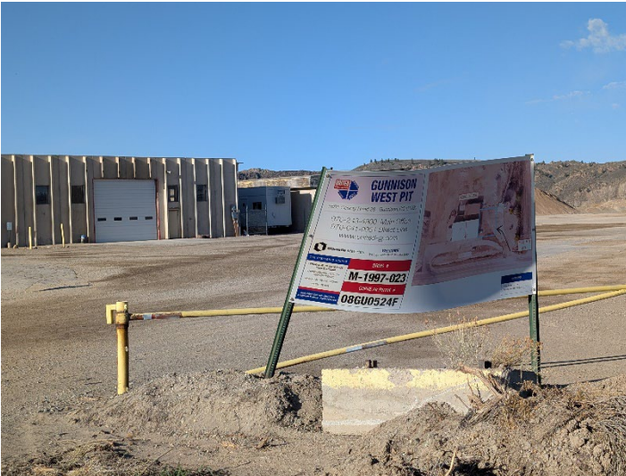
Sign at mine entrance