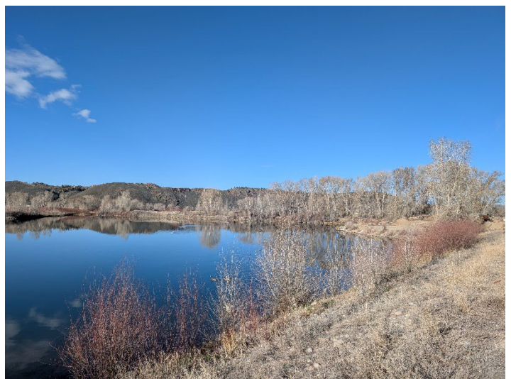
Southwest reclaimed pond