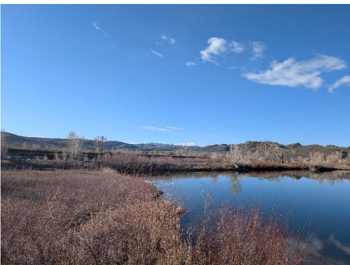
Southwest reclaimed pond