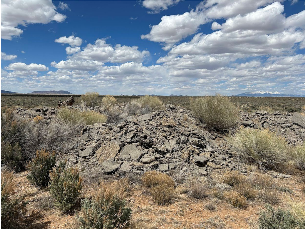
Photo 6: View of recycled asphalt stockpile outside the gravel pit, facing west.