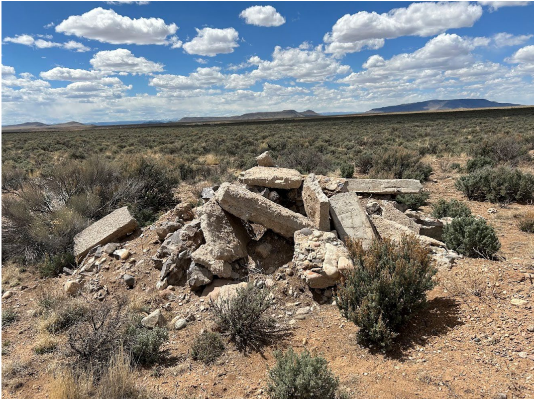
Photo 5: View of concrete road base outside the gravel pit, facing west.