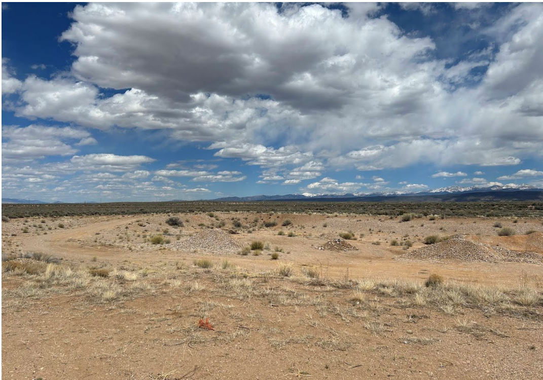
Photo 2: View of gravel pit containing stockpiles of material, facing east.