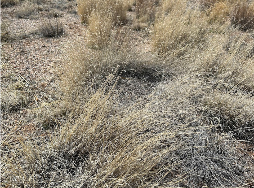
Photo 7: View of native vegetation, including Blue grama, within the undisturbed portion of the permit area.