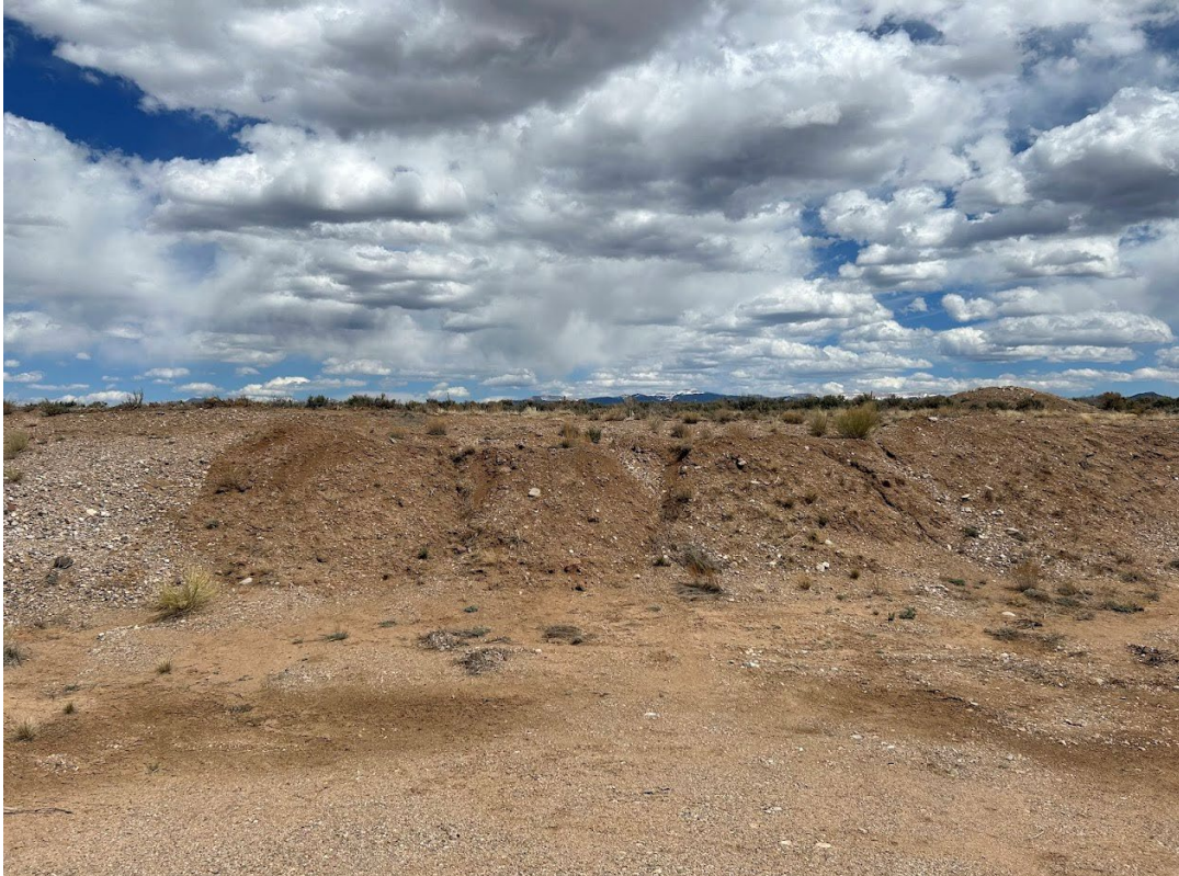
Photo 3: View of gravel pit wall with minor amount of erosional rilling, facing east.