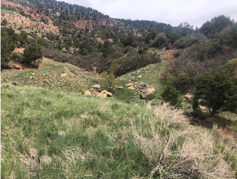
Reclaimed Pond 1 at East Mine, looking upstream