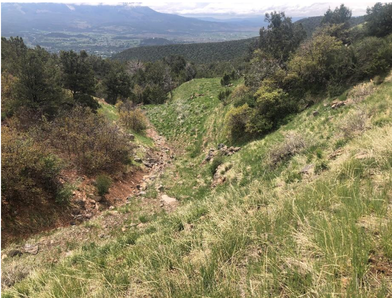
Reclaimed Pond 2 at East Mine, looking downstream

Number of Partial Inspection this Fiscal Year: 7