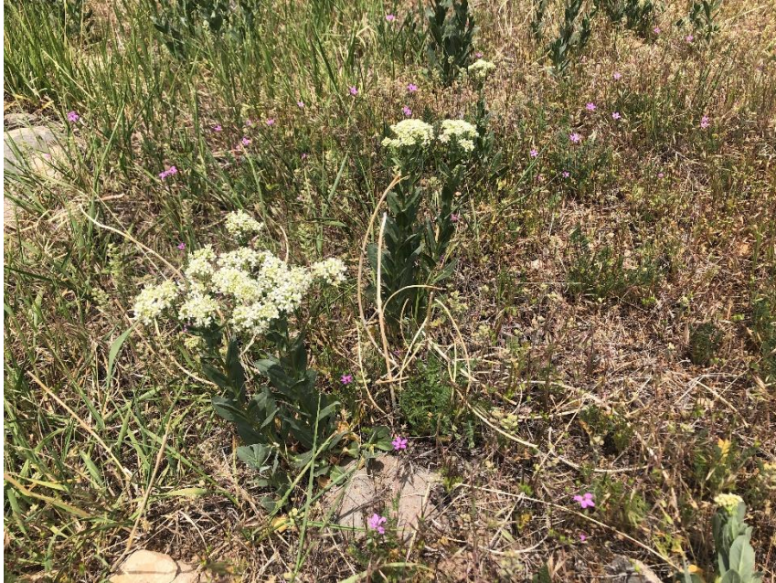
Whitetop at Coal Storage by Highway