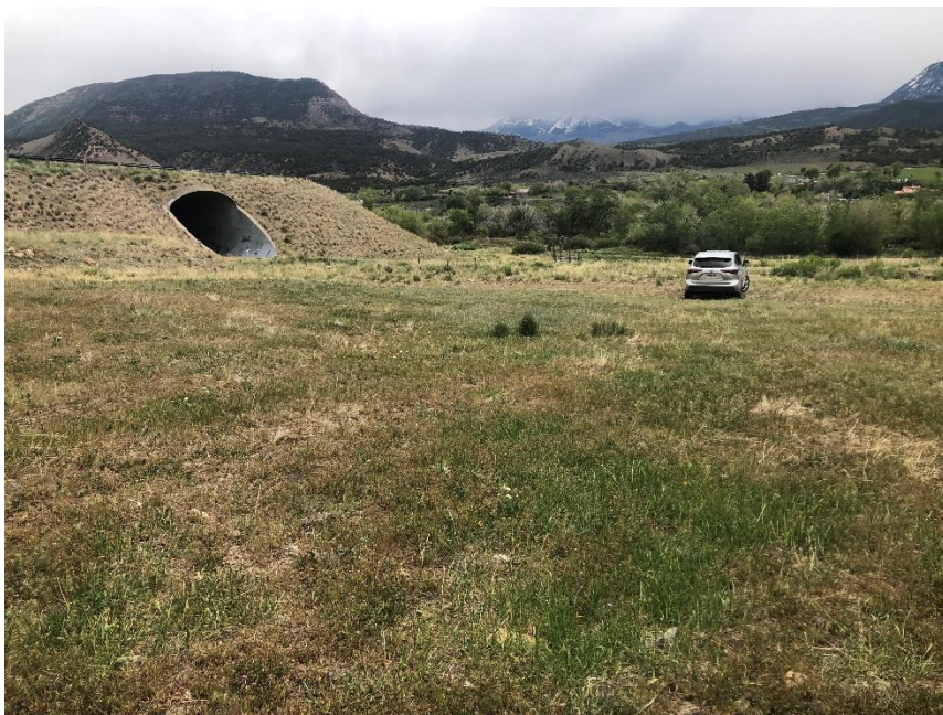
Coal Storage by Highway

Number of Partial Inspection this Fiscal Year: 7