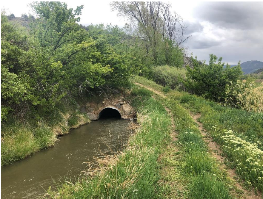
Lower end of large culvert at loadout (Farmers Ditch)

Number of Partial Inspection this Fiscal Year: 7