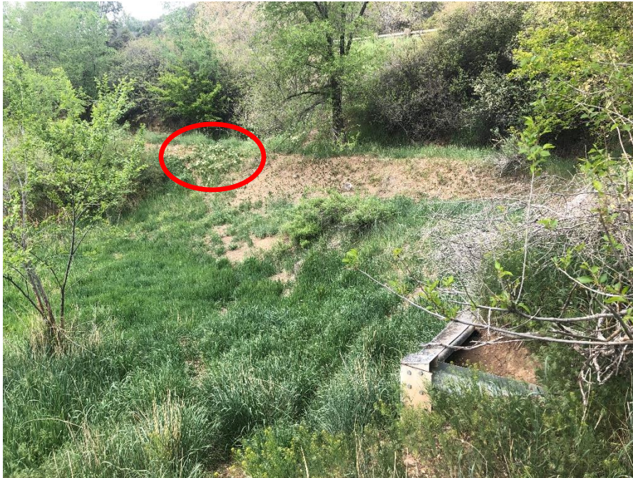
Pond at loadout – note whitetop in circle