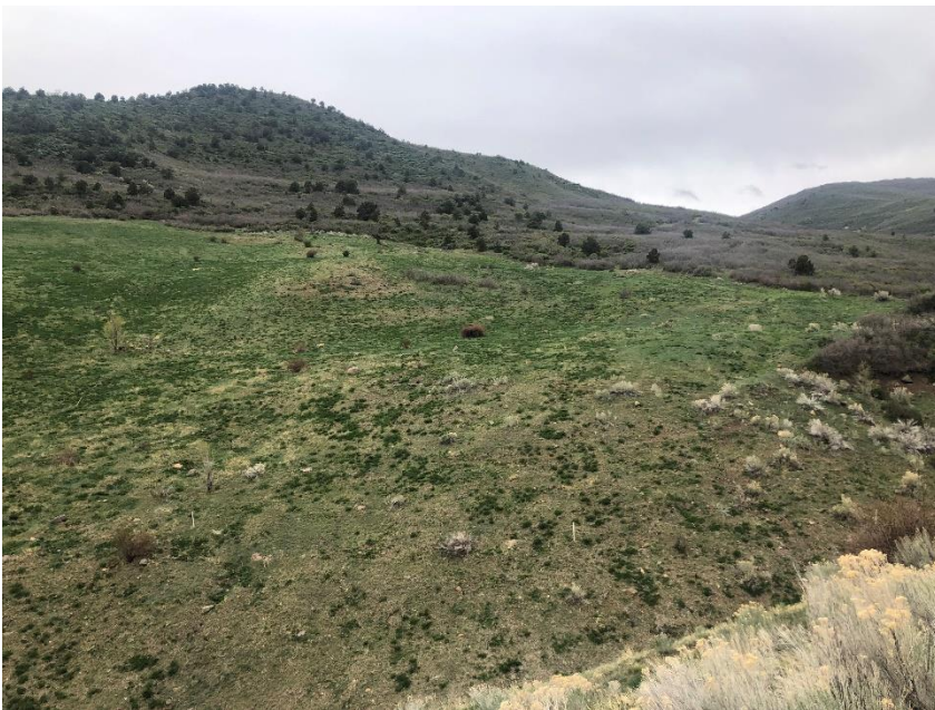
Northern portion of West Mine

Number of Partial Inspection this Fiscal Year: 7