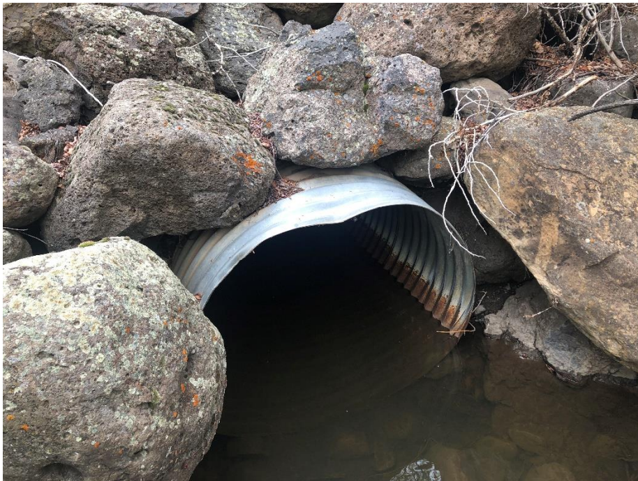
Lower end of large culvert at West Mine (East Roatcap Creek)

Number of Partial Inspection this Fiscal Year: 7