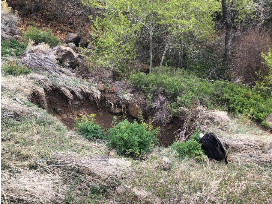
Sinkhole near lower end of large culvert at West Mine