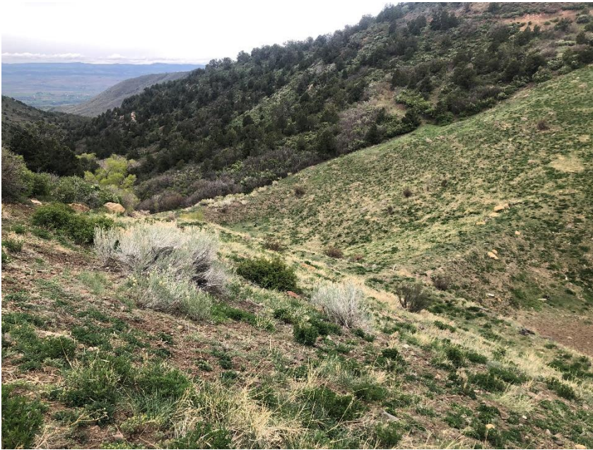
Pond W-1 at West Mine