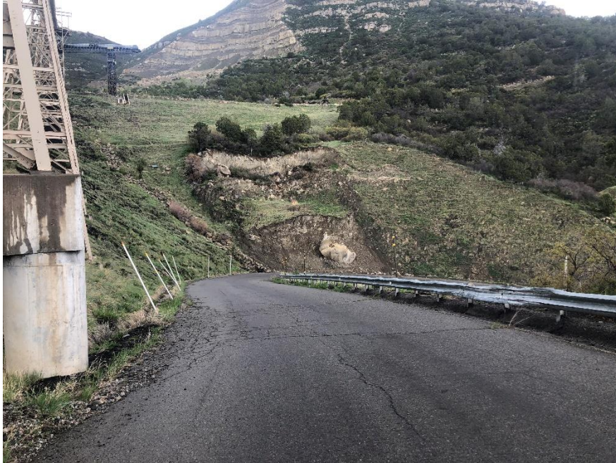
Slide at Curve 10