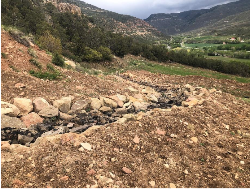
Riprap ditch below Gob Pile #2