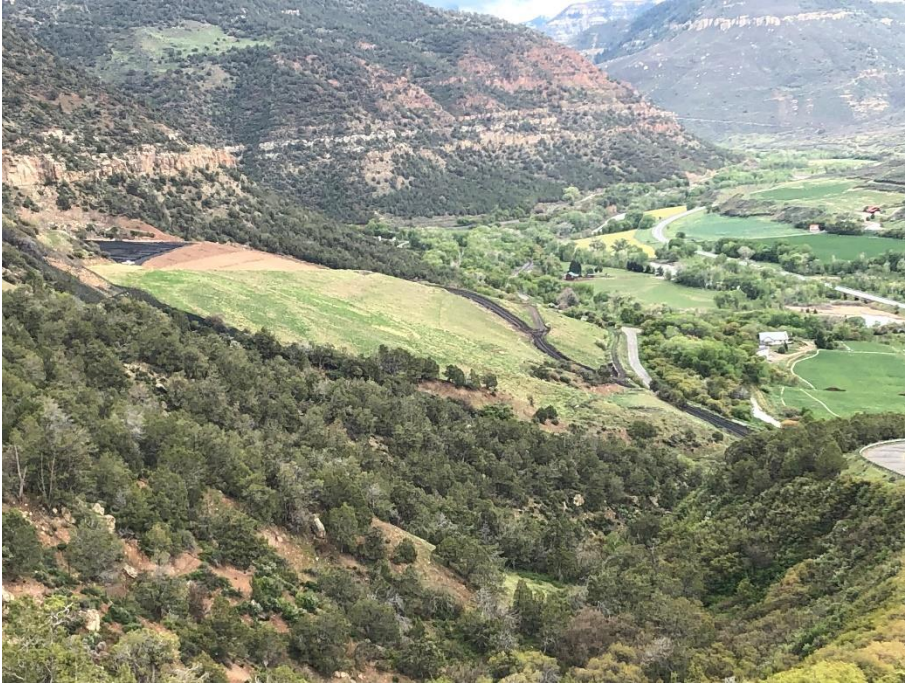
Looking east toward Gob Piles 1,2, and 4