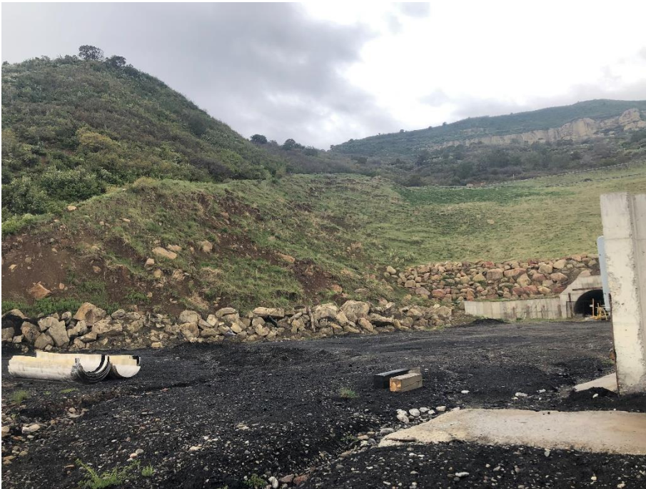
West slope above B Portal Bench

Number of Partial Inspection this Fiscal Year: 7