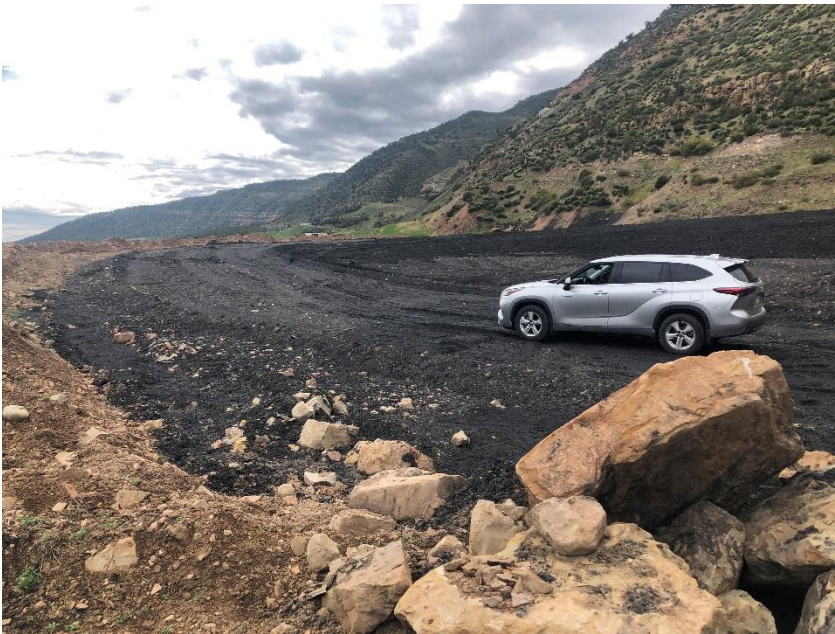
Upper portion of Gob Pile #2, looking west

Number of Partial Inspection this Fiscal Year: 7