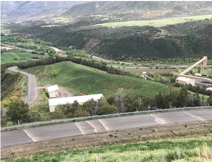
Topsoil Stockpile A

Number of Partial Inspection this Fiscal Year: 7