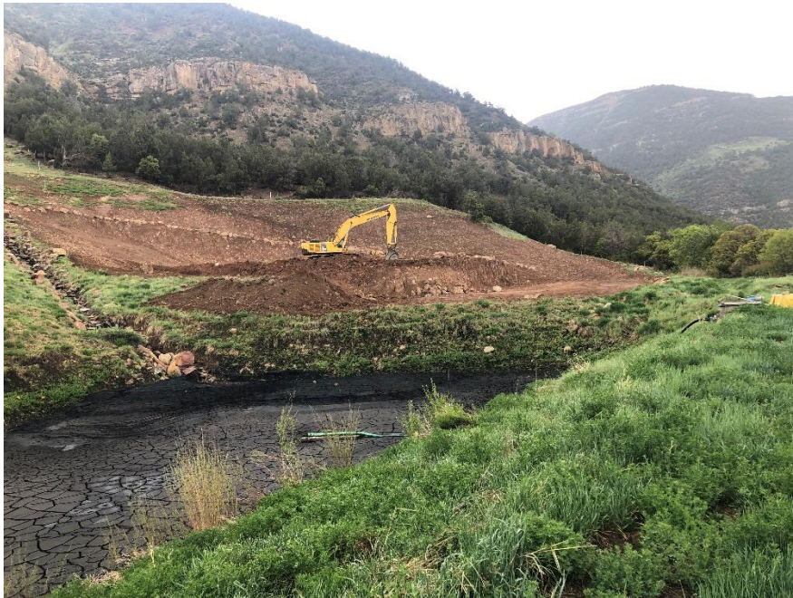
Pond F and adjacent soil pile