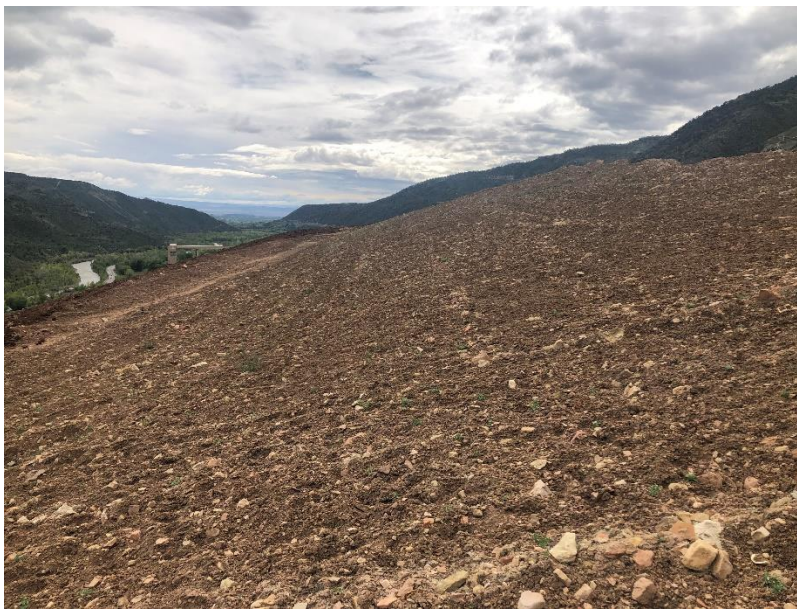
Recently reclaimed portion of Gob Pile #2, looking west

Number of Partial Inspection this Fiscal Year: 7