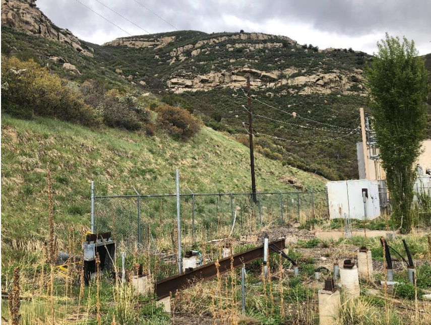
Slope above Utility Bench