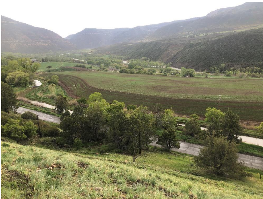
Gob Pile #3

Number of Partial Inspection this Fiscal Year: 7