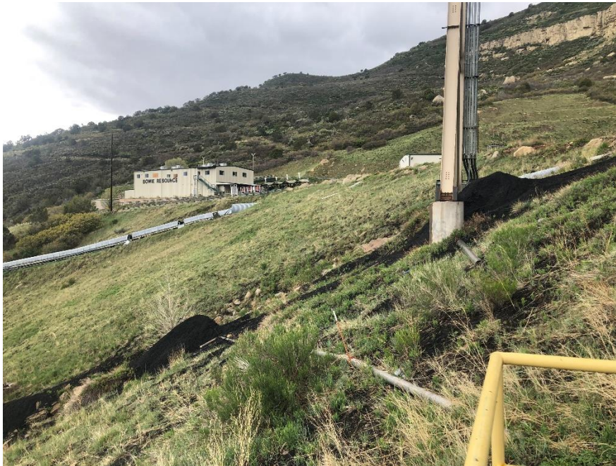
Slope below D Portal Bench

Number of Partial Inspection this Fiscal Year: 7