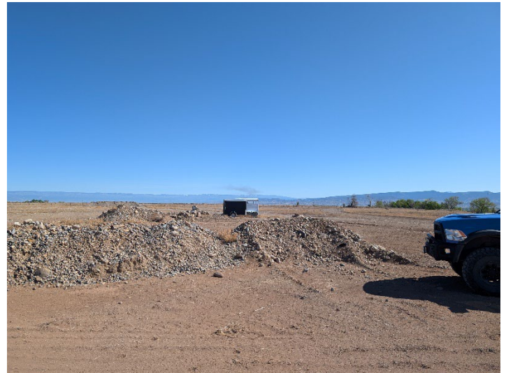
View towards the north end of the property. Various piles of rock, dirt, wood slash and construction debris are located throughout the property.

Thomas Conrad 59220 Lone Eagle Road Montrose, CO 81403