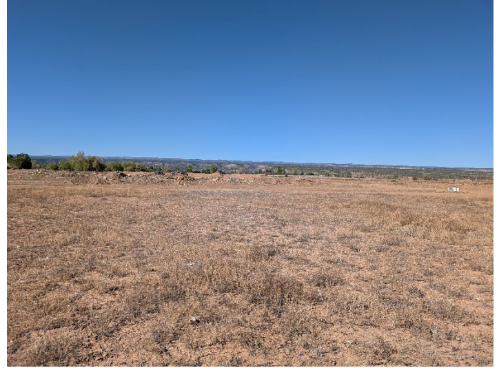
View towards the south end of the property. Various piles of rock, dirt, wood slash and construction debris are located throughout the property.