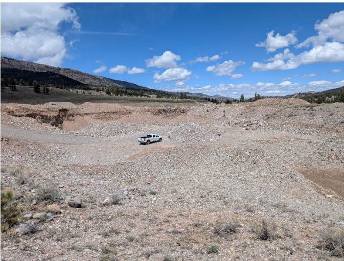
View of pit from south end