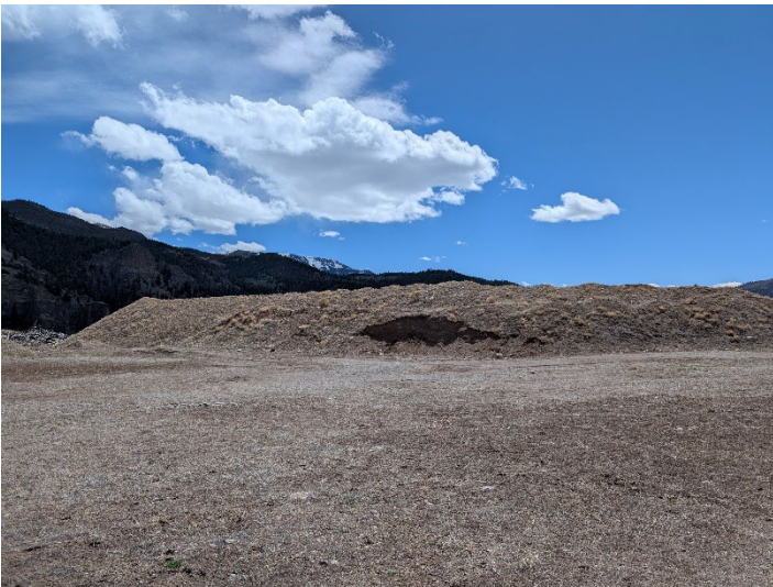
Topsoil stockpile on south end of pit