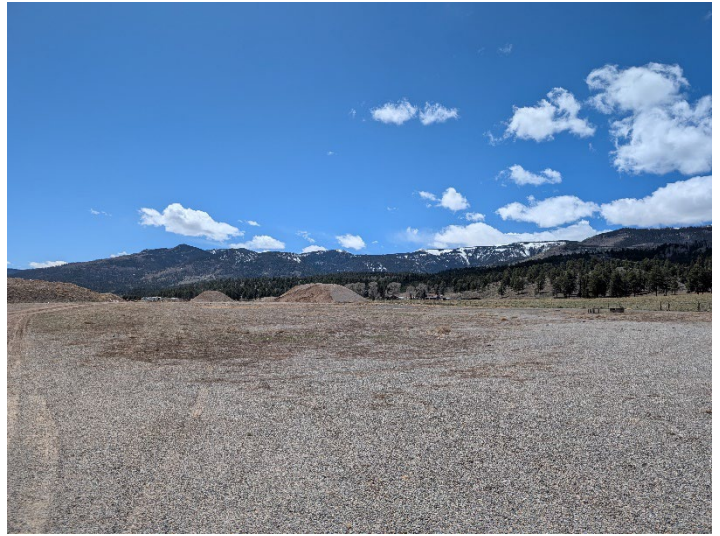
Stockpiled material on west side of pit