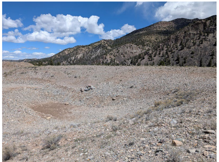
View of pit from south end