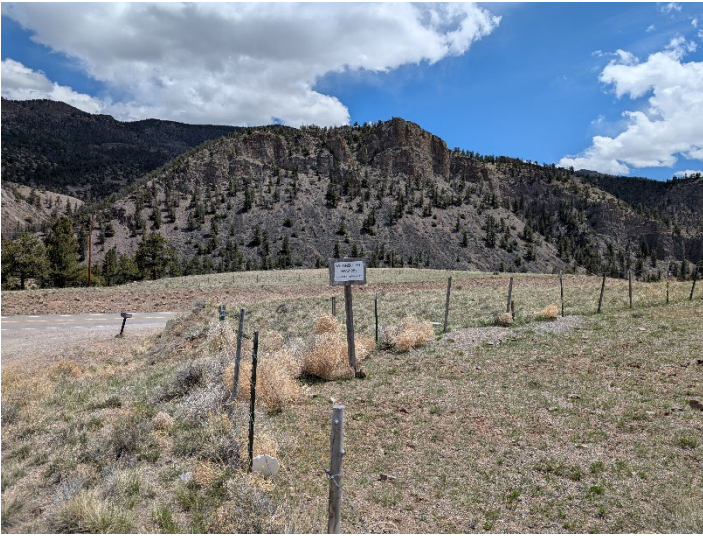
Mine sign at site entrance