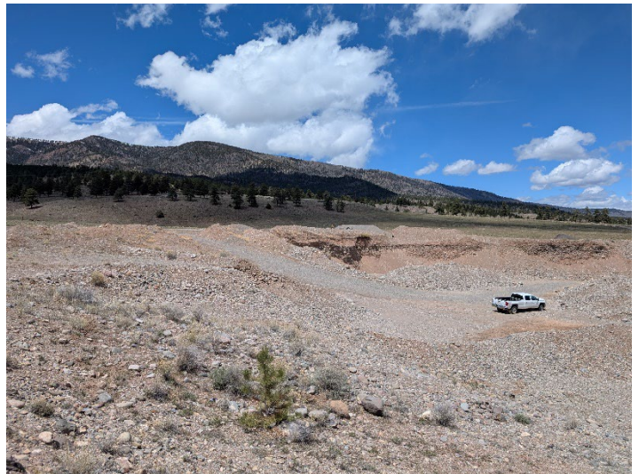
View of pit from south end