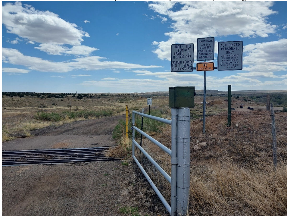
Photo #7: Additional permit sign posted at the entrance of the Dist. No. 2 Pit.