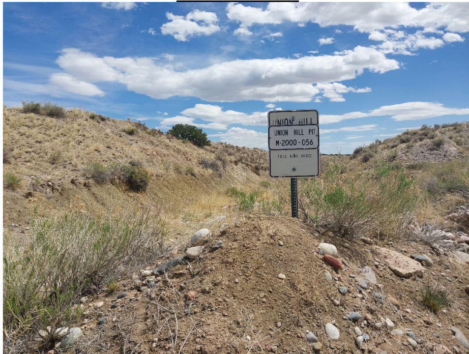
Photo #1: Mine sign posted at the entrance, located along the west side of the permit area, accessed through the Dist. No. 2 Gravel Pit permit area.