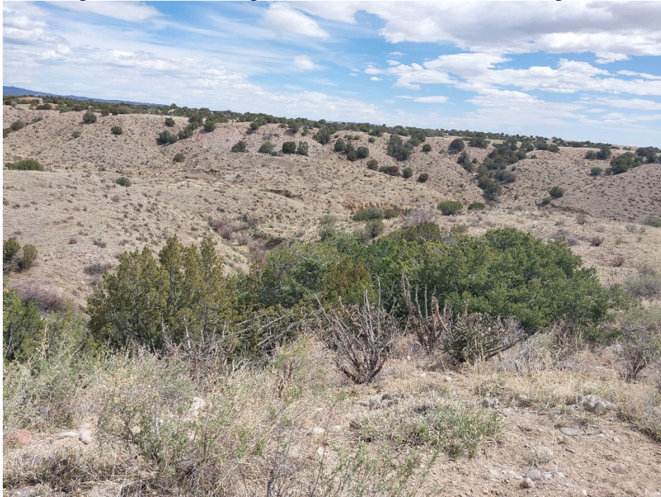
Photo #5: View of the northern area of the permit, looking to the east from the northwest of the permit area.