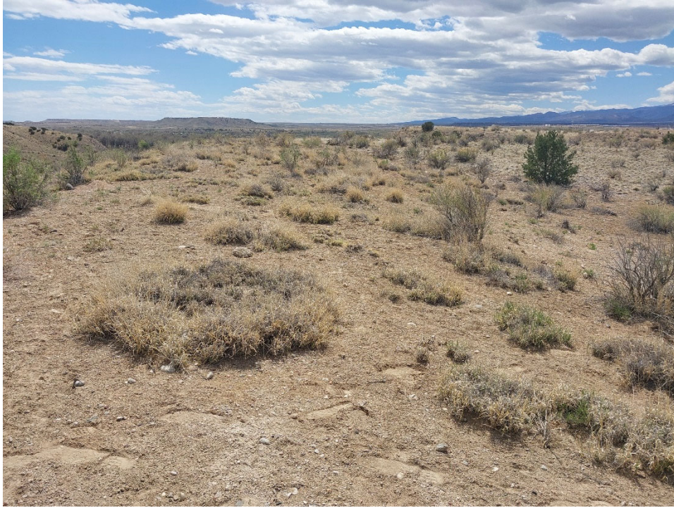
Photo #6: View of the western portion of the permit area, looking to the south.