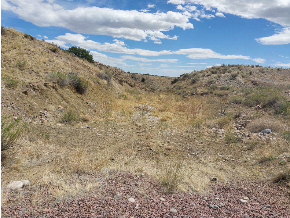
Photo #2: View of the trail used to access the permitted area, looking to the east.