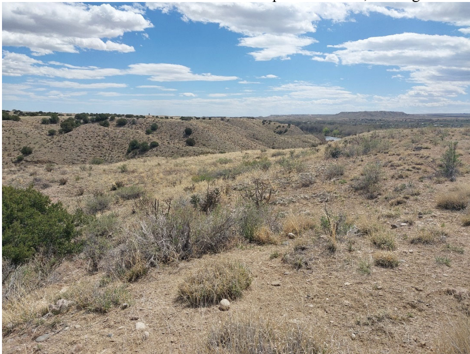
Photo #3: View of the southern portion of the permitted area, looking east.