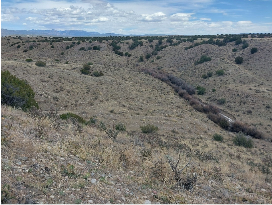
Photo #4: View of the permit area, looking northeast from the southwestern portion of the permit area.