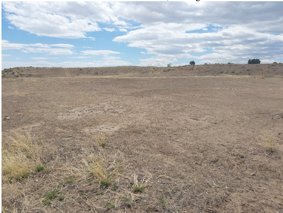
Photo #3: View of the pit floor, looking to the south. The topsoil berm can be seen in the background.