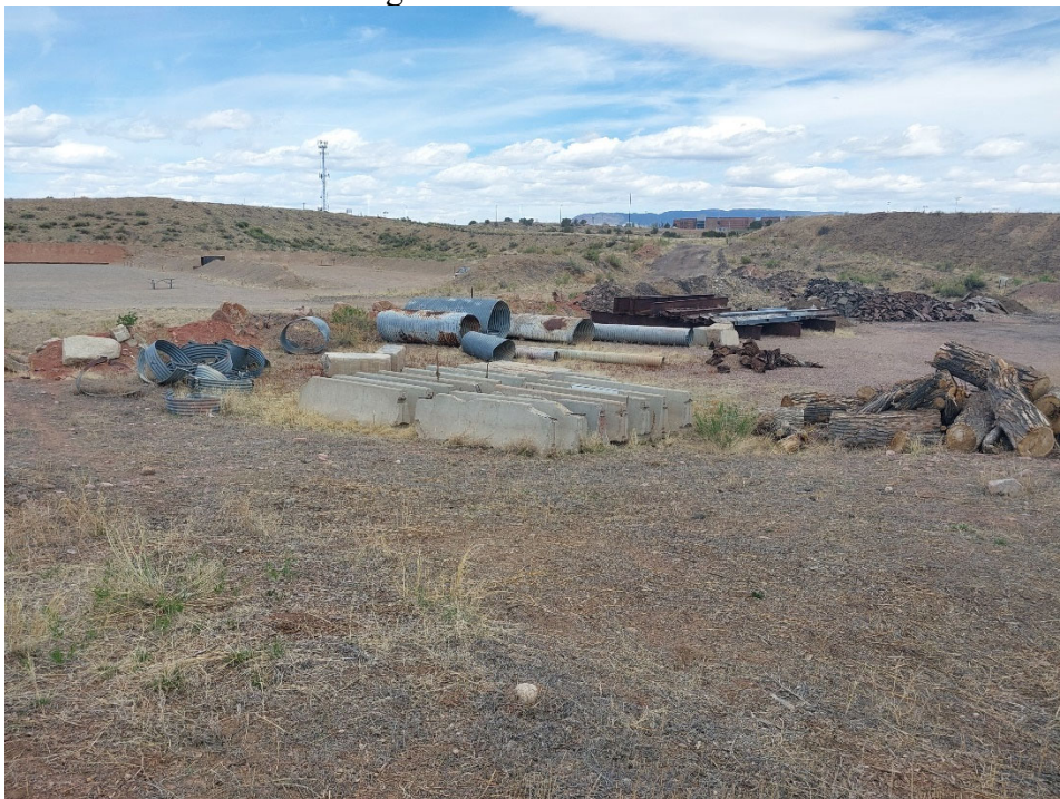
Photo #5: View of the various imported materials stockpiled on the site.