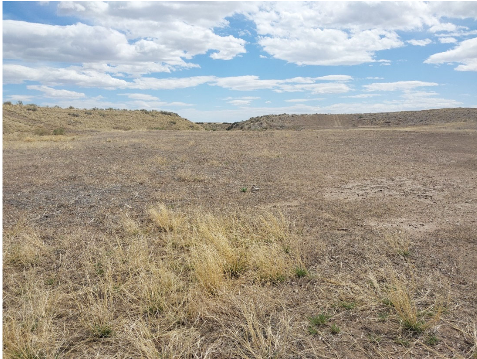
Photo #4: View of the pit floor, looking to the southeast. The entrance to the Union Hill Gravel Pit can be seen in the background at the break in the berm.