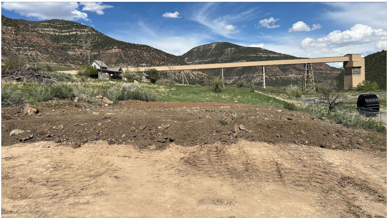
Figure 2: Site of substation covered with topsoil

Number of Partial Inspection this Fiscal Year: 7