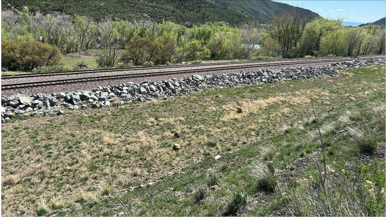
Figure 5: Railroad embankment, weed spraying partially complete

Number of Partial Inspection this Fiscal Year: 7