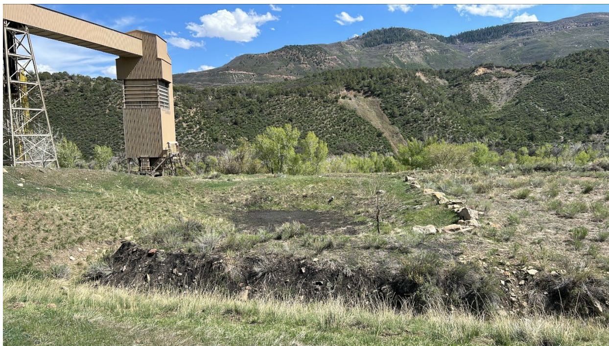
Figure 4: Sediment pond

Number of Partial Inspection this Fiscal Year: 7