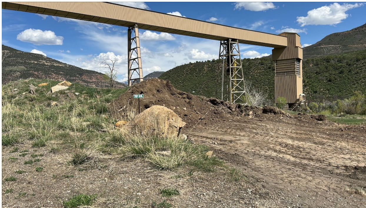
Figure 3: Topsoil stockpile at east end of site