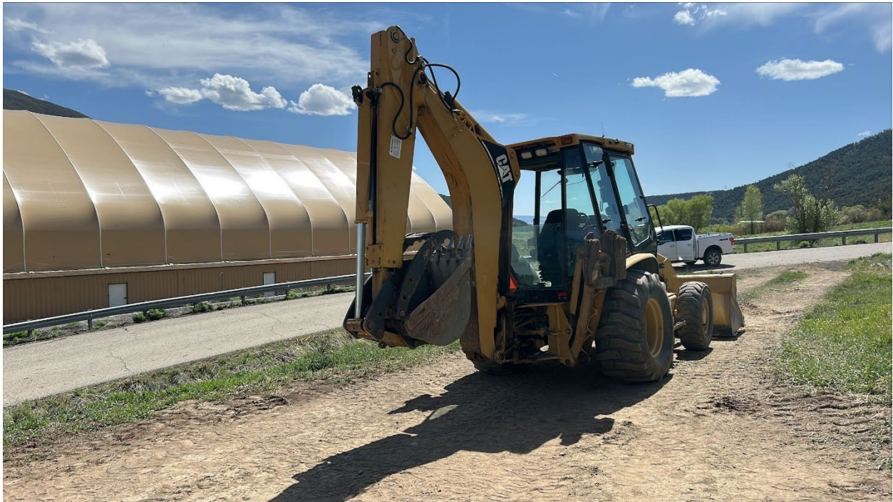
Figure 1: Remaining concrete from substation broken up and buried with backhoe