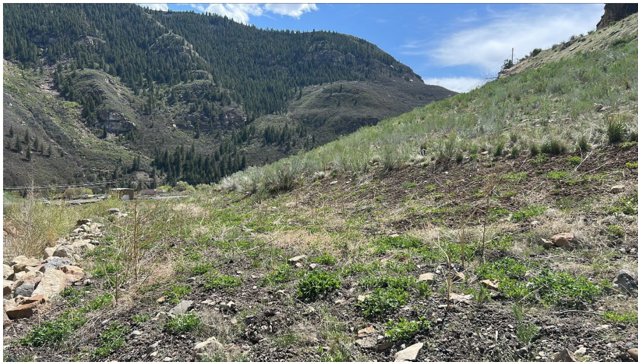
Figure 7: Elk Creek channel, 7 of 8