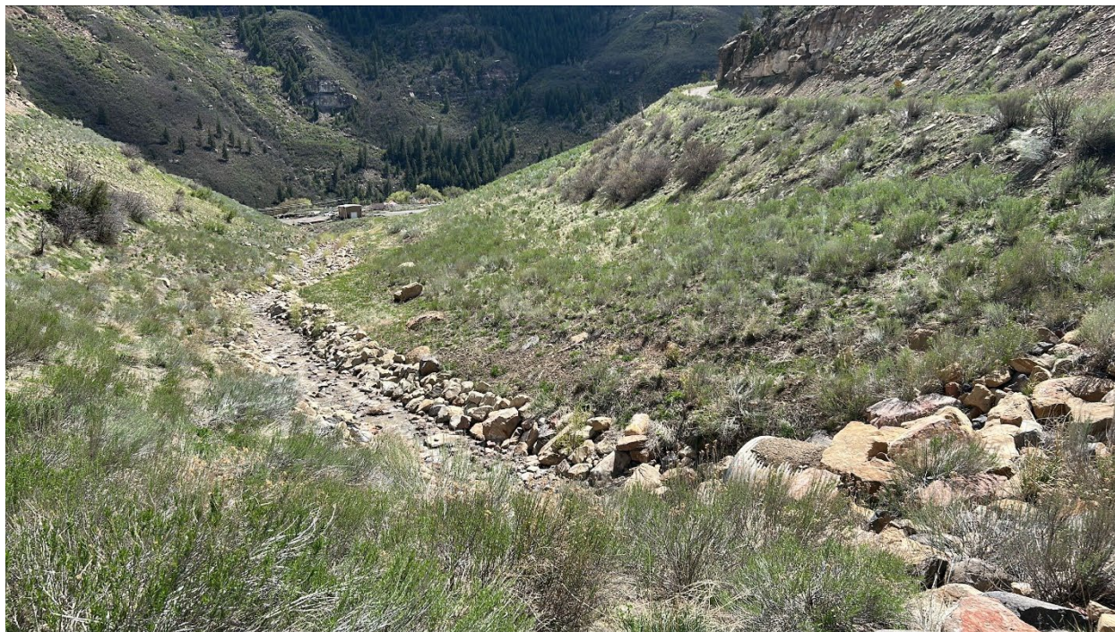
Figure 5: Elk Creek channel, 5 of 8

Number of Partial Inspection this Fiscal Year: 7