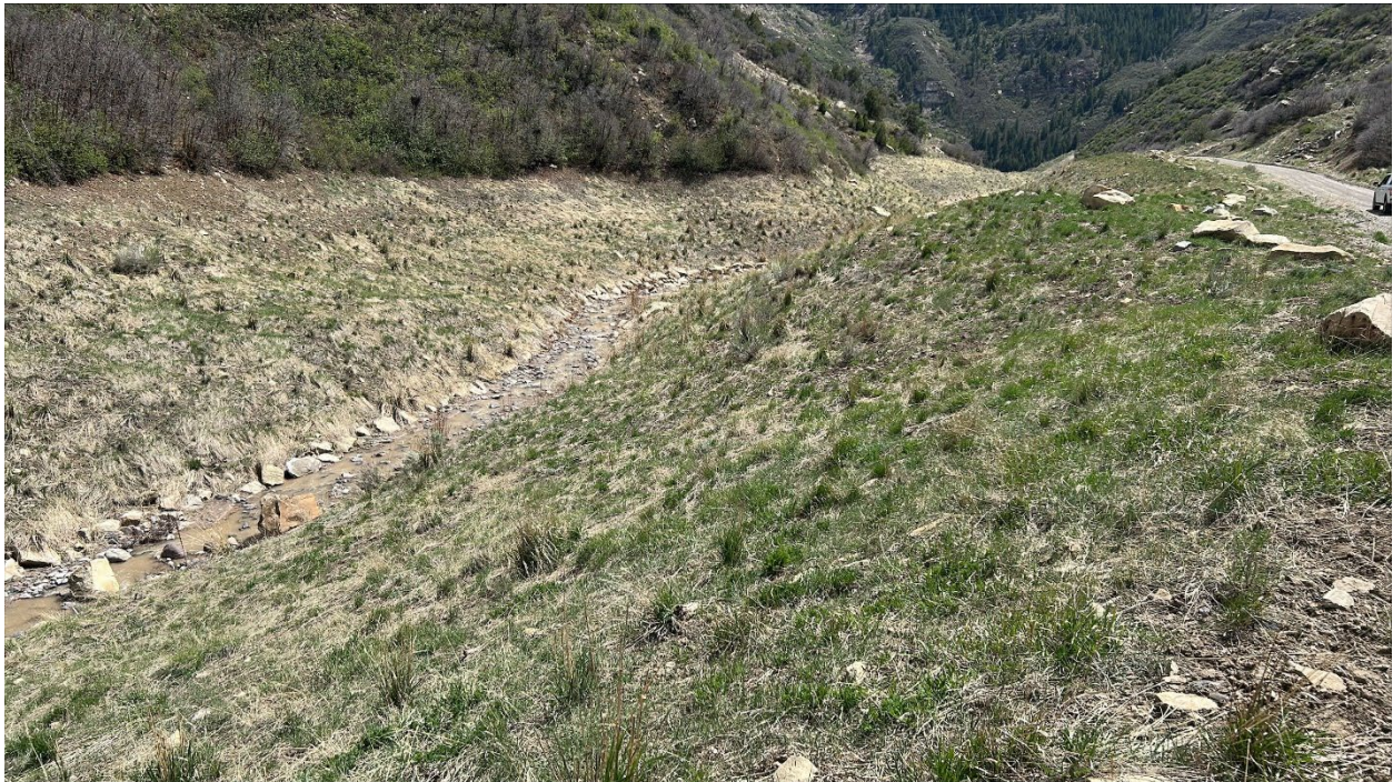
Figure 2: Elk Creek channel, 2 of 8

Number of Partial Inspection this Fiscal Year: 7