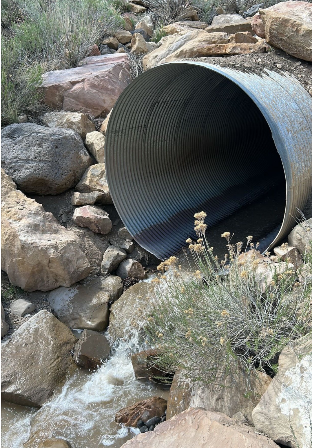
Figure 6: Elk Creek channel, 6 of 8

Number of Partial Inspection this Fiscal Year: 7