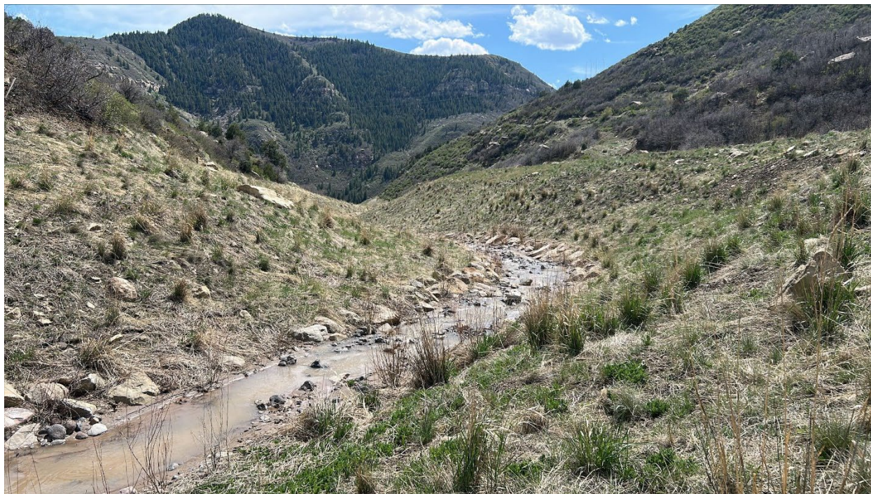
Figure 3: Elk Creek channel, 3 of 8