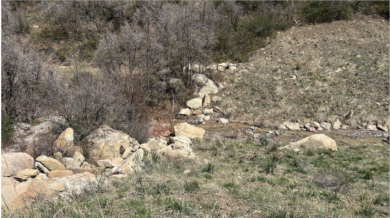
Figure 1: Elk Creek channel, 1 of 8