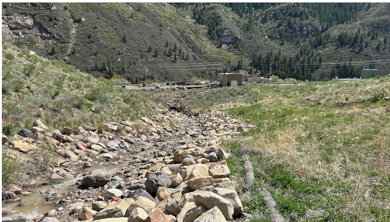
Figure 8: Elk Creek channel, 8 of 8

Number of Partial Inspection this Fiscal Year: 7