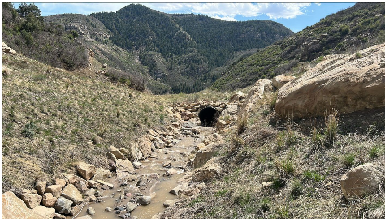
Figure 4: Elk Creek channel, 4 of 8

Number of Partial Inspection this Fiscal Year: 7