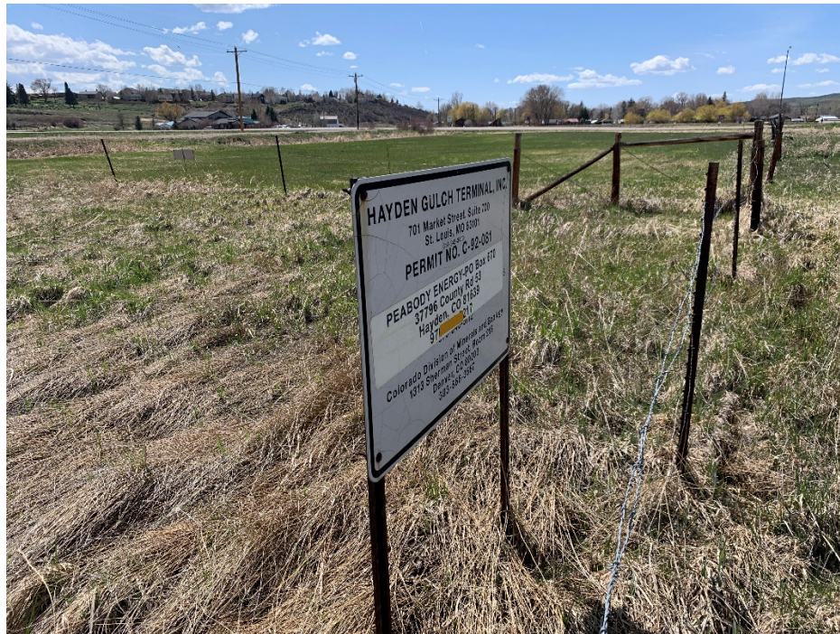
Photo 3- Mine identification sign facing Hwy 40

Number of Partial Inspection this Fiscal Year: 6