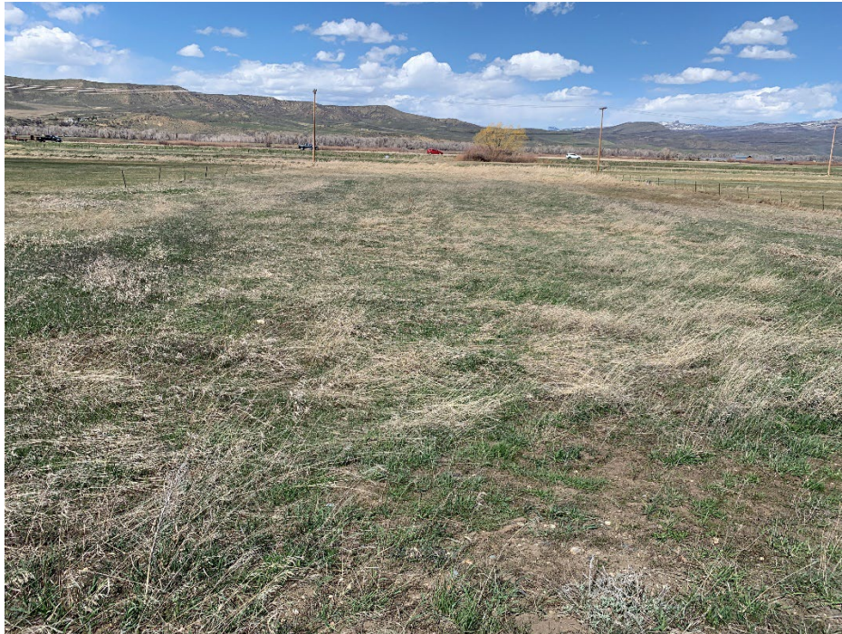
Photo 2- Grasses are starting to sprout for the season north of trailhead parking area.

Number of Partial Inspection this Fiscal Year: 6