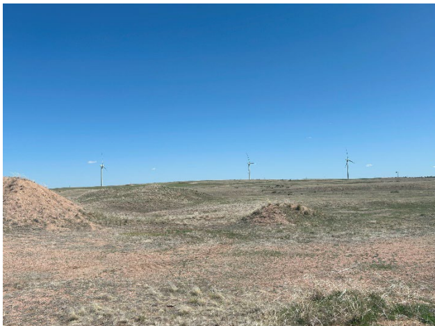
Photo 5: Reclaimed berms and additional documentation of the stockpile. Facing south.