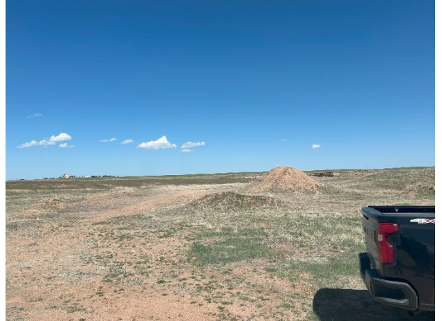
Photo 2: Less vegetated area and remaining stockpile. Owner states area is in acceptable condition.