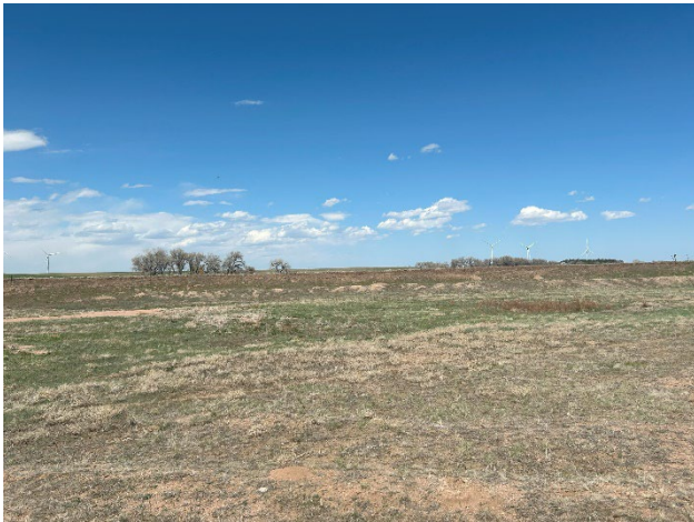
Photo 3: Reclaimed area within streambed. Facing northern portion of permit.